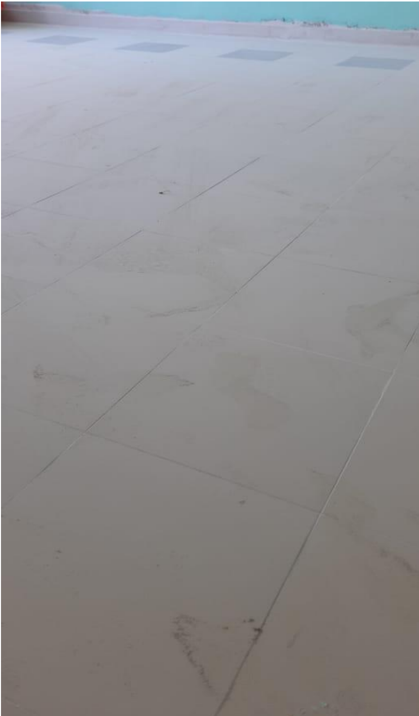
Defected porcelain floor tiles