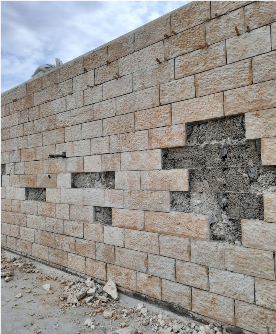
Removal of defected stones