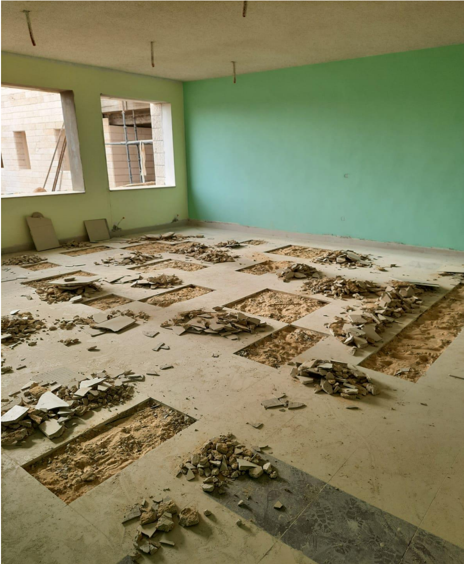
Starting with the removal of defected porcelain floor tiles