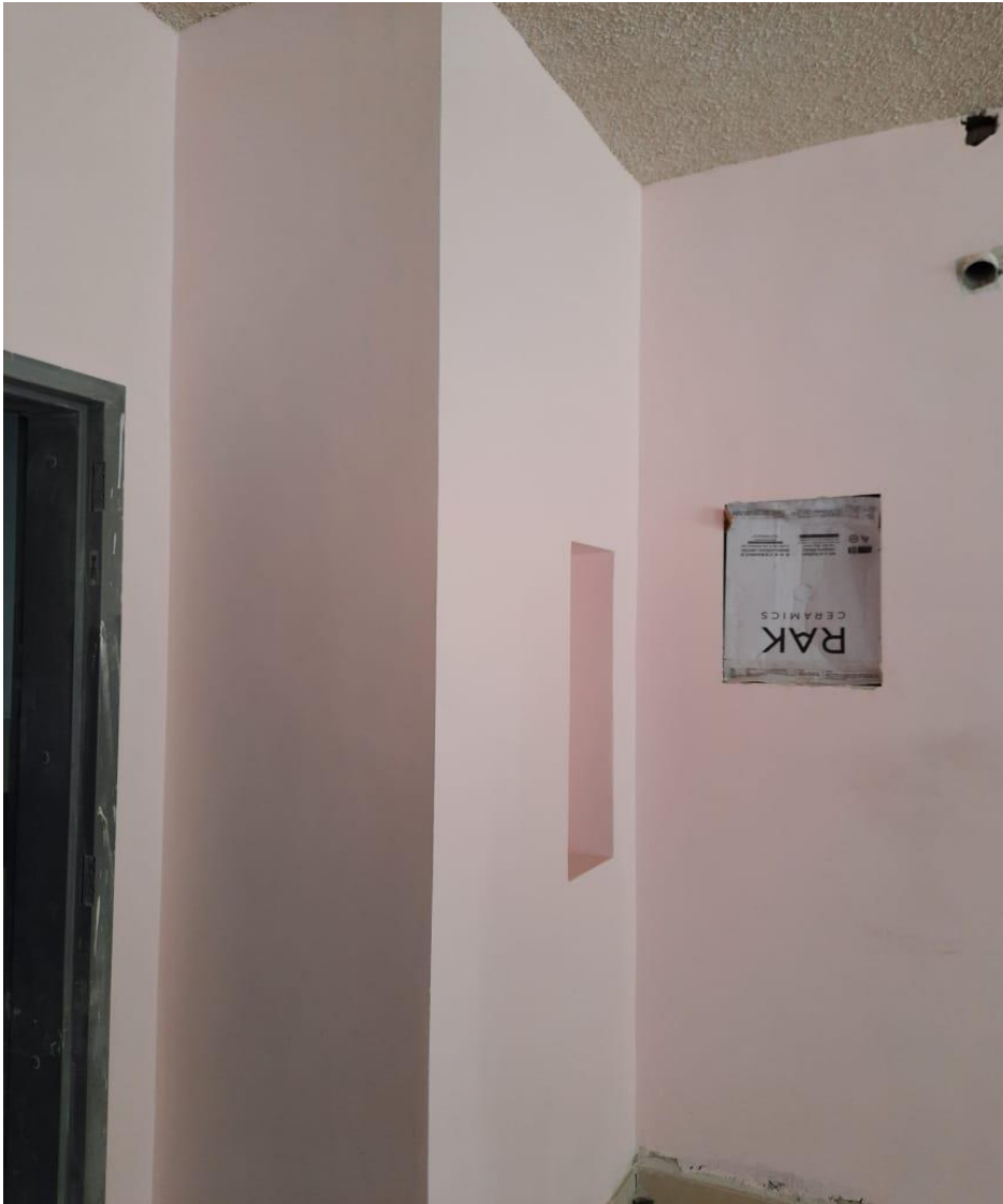
Corners not done properly