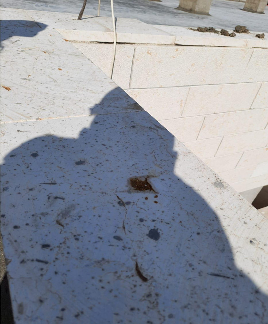
Defected stone coping