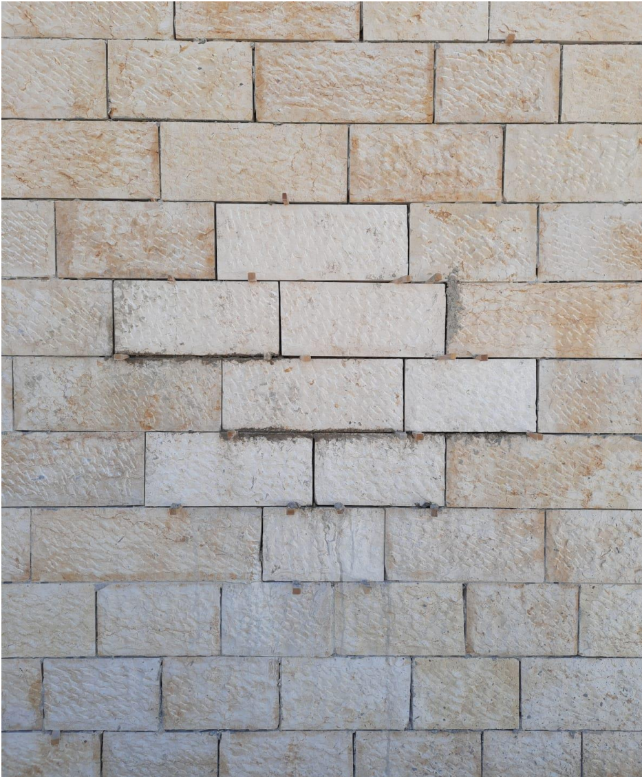
Replacing the defected stones