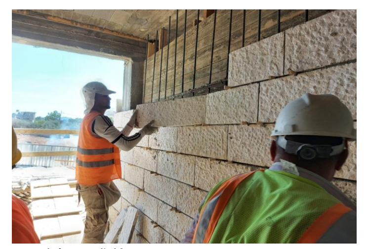
removal of un-complied Stone