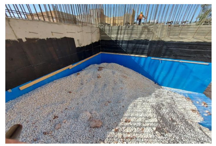
Conducting back-filling work without doing the appropriate insulation work