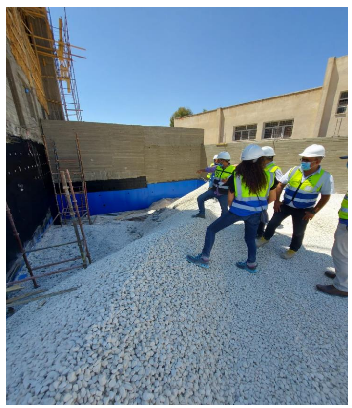
Starting remedy work in the presence of Engineer representatives