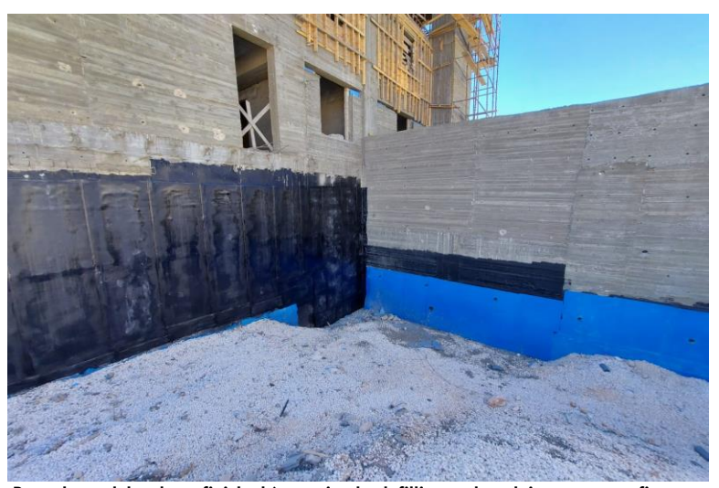
Remedy work has been finished (removing back-filling and applying waterproofing membrane as per specification)