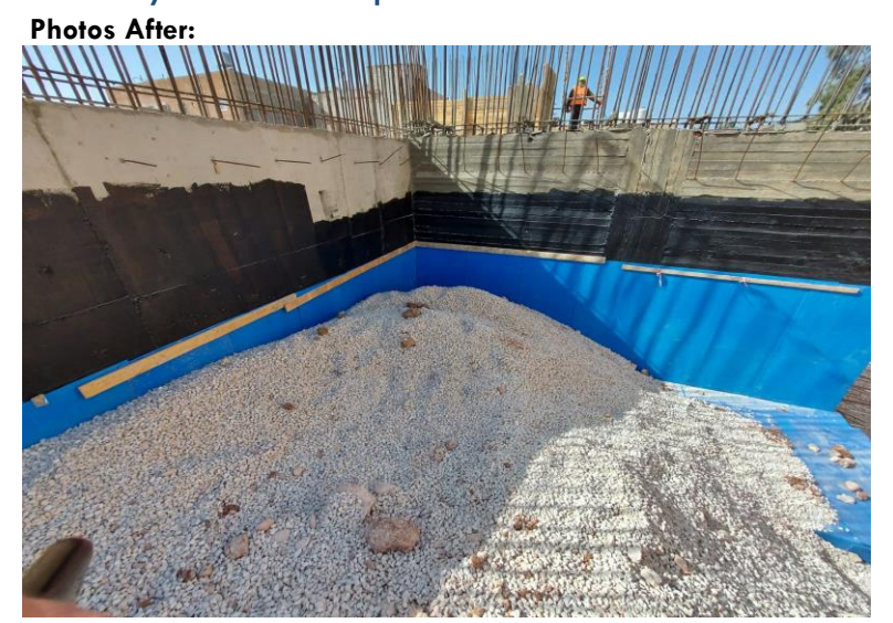
Completing the waterproofing work before backfilling