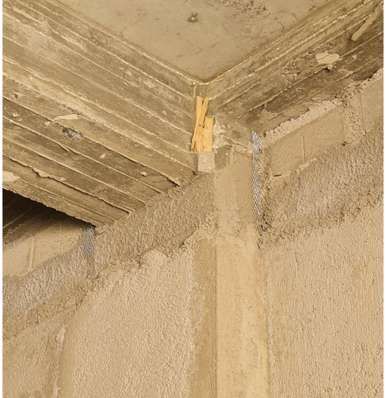
Remaining wooden pieces in the slab