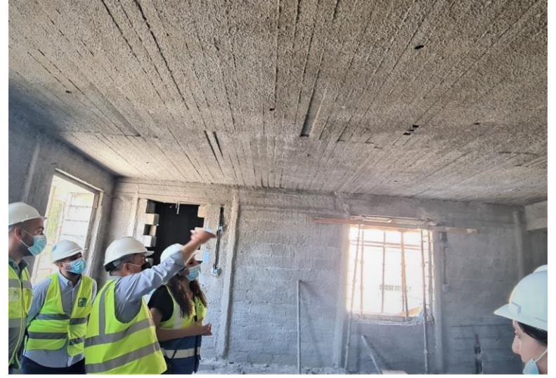
Irregularity in the formwork of the slab