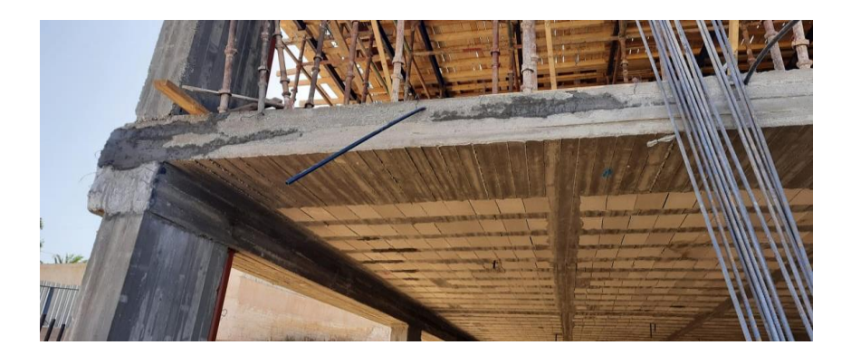
1- Corrective Action