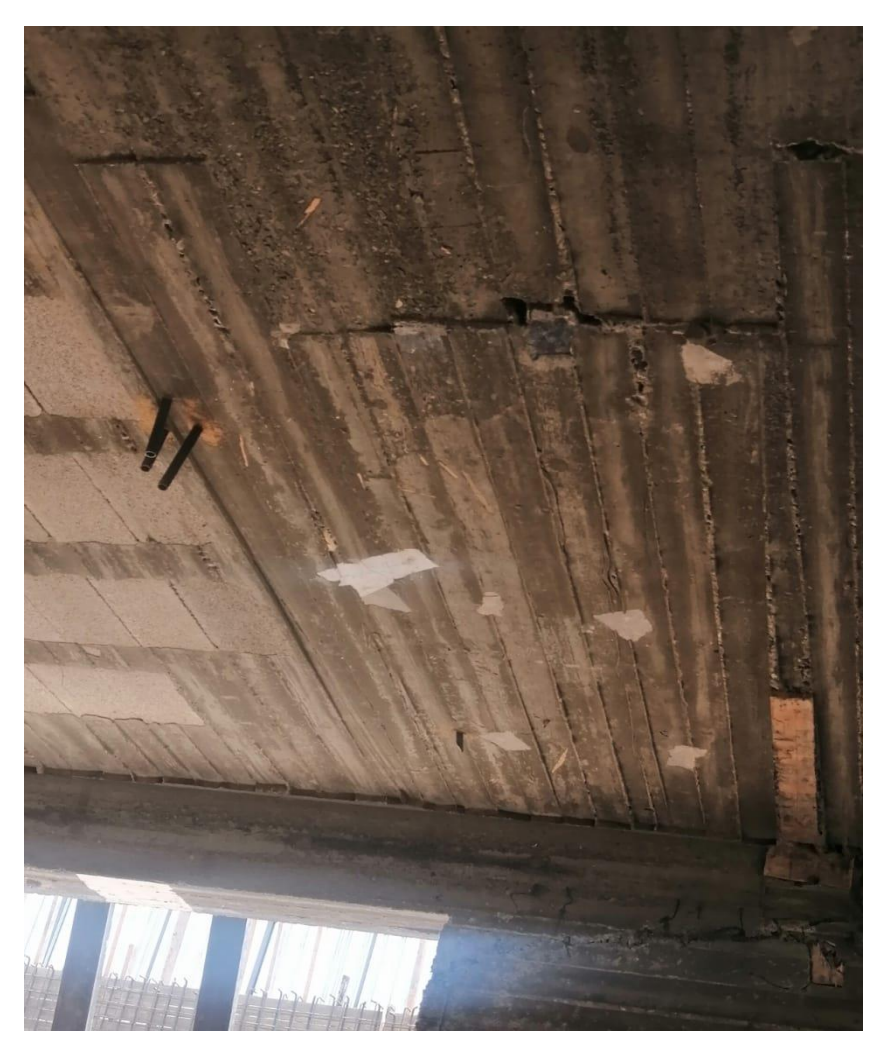
2- Defected Work