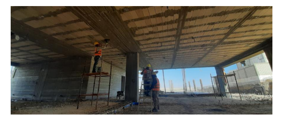
2- Corrective Action