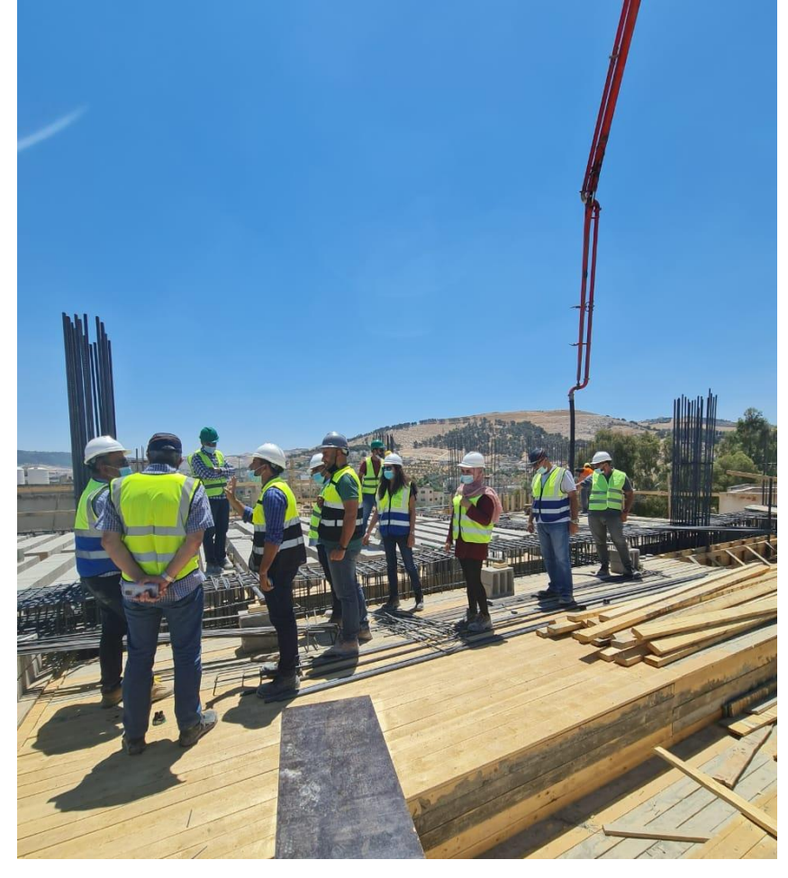
Checking reinforcement work for ground floor slab at zone A