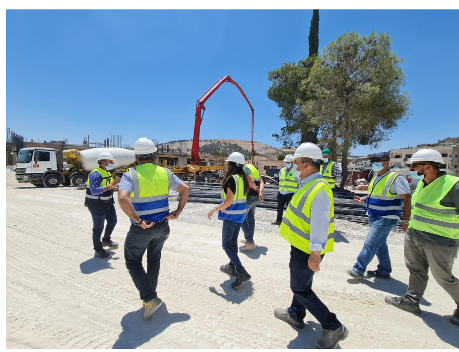
A tour inside the site was conducted