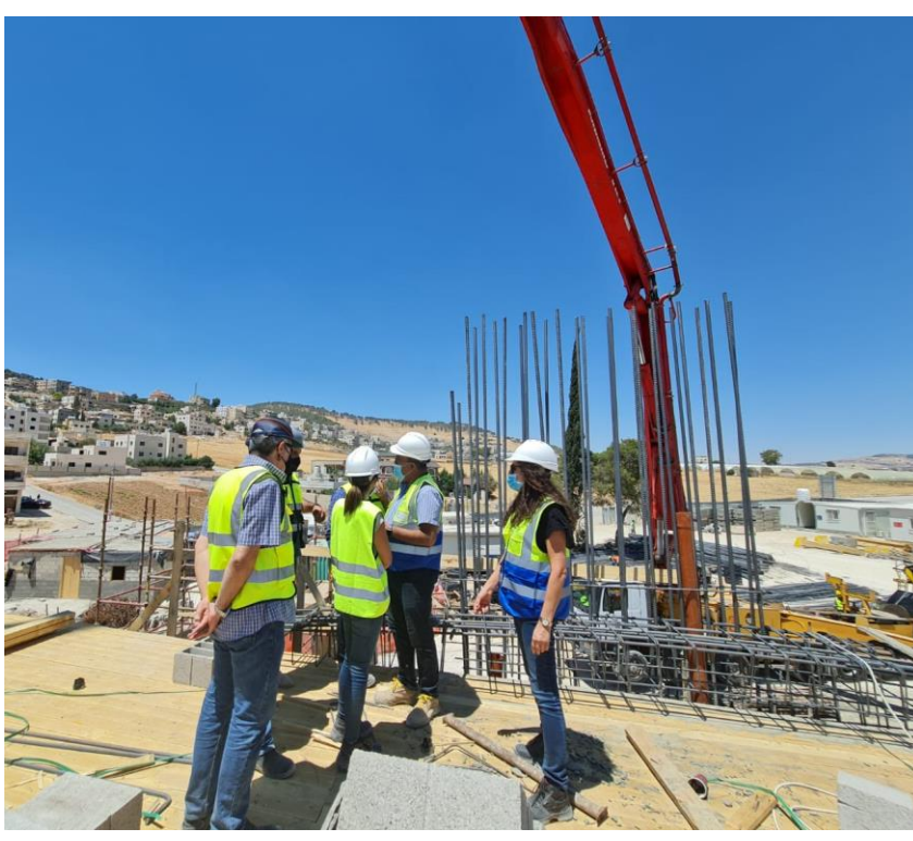
Discussing the distribution of bottom steel bars for ground floor drop beams/ground floor slab at zone A