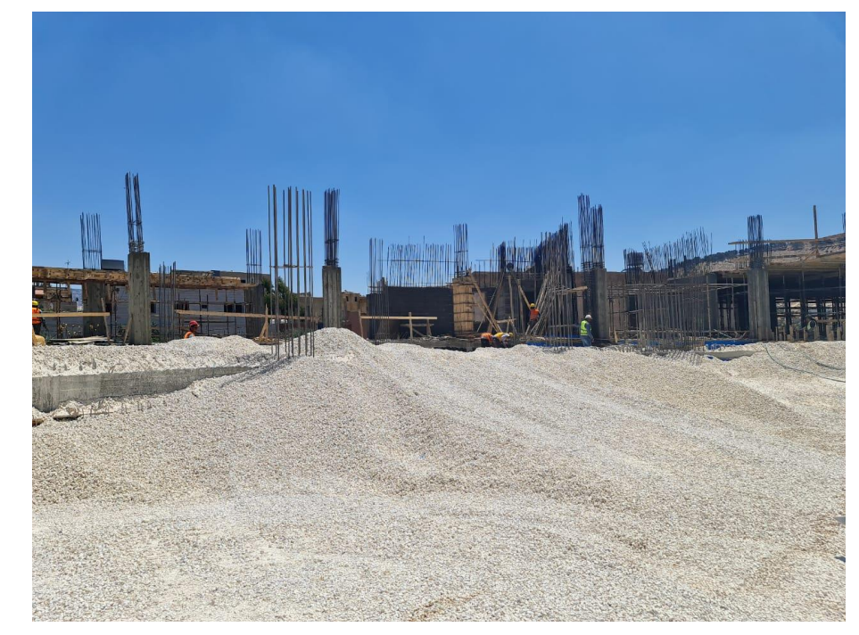
Checking the quality of Backfilling works at zone