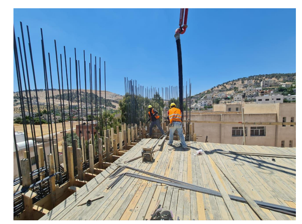
Casting last vertical element of ground floor (Core 2) at zone A