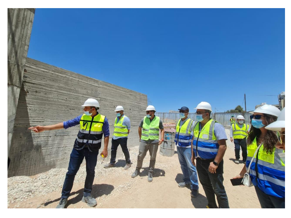
Inspecting casted vertical elements of Basement Floor and ground floor at zone B