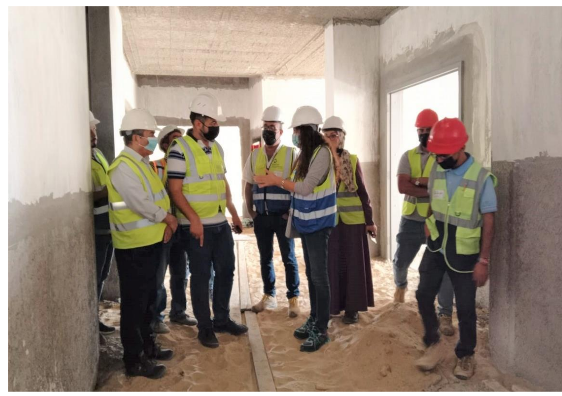
General discussion between the visiting team and the Contractor representative