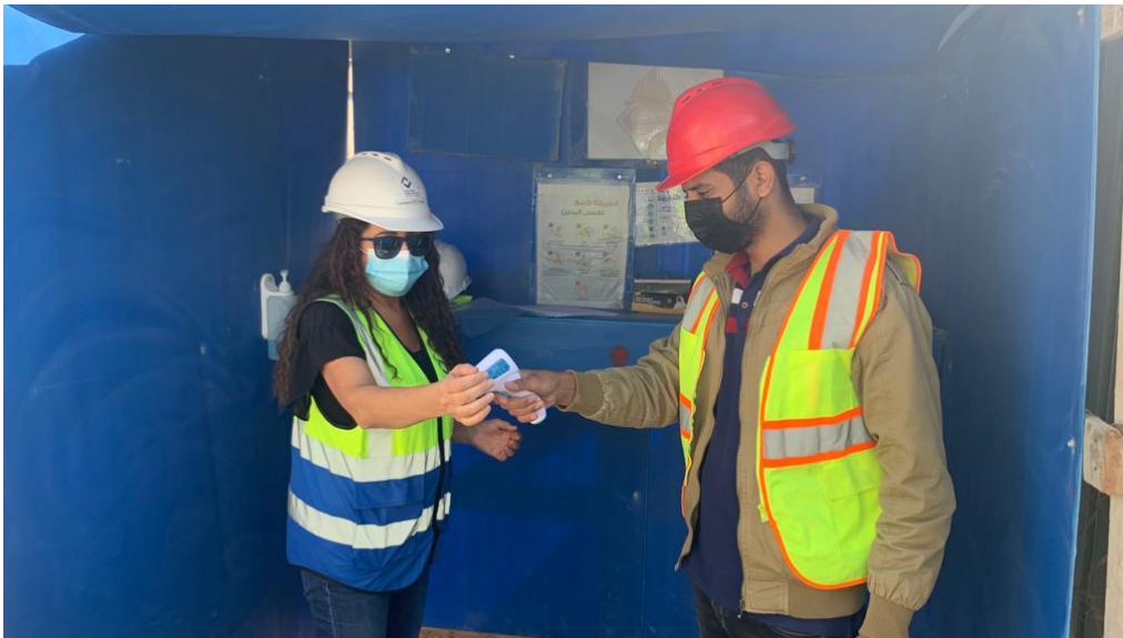
Temperature check, sterilization and signing visitors' attendance sheet at the entrance of the site, complying with Covid-19 Protocol