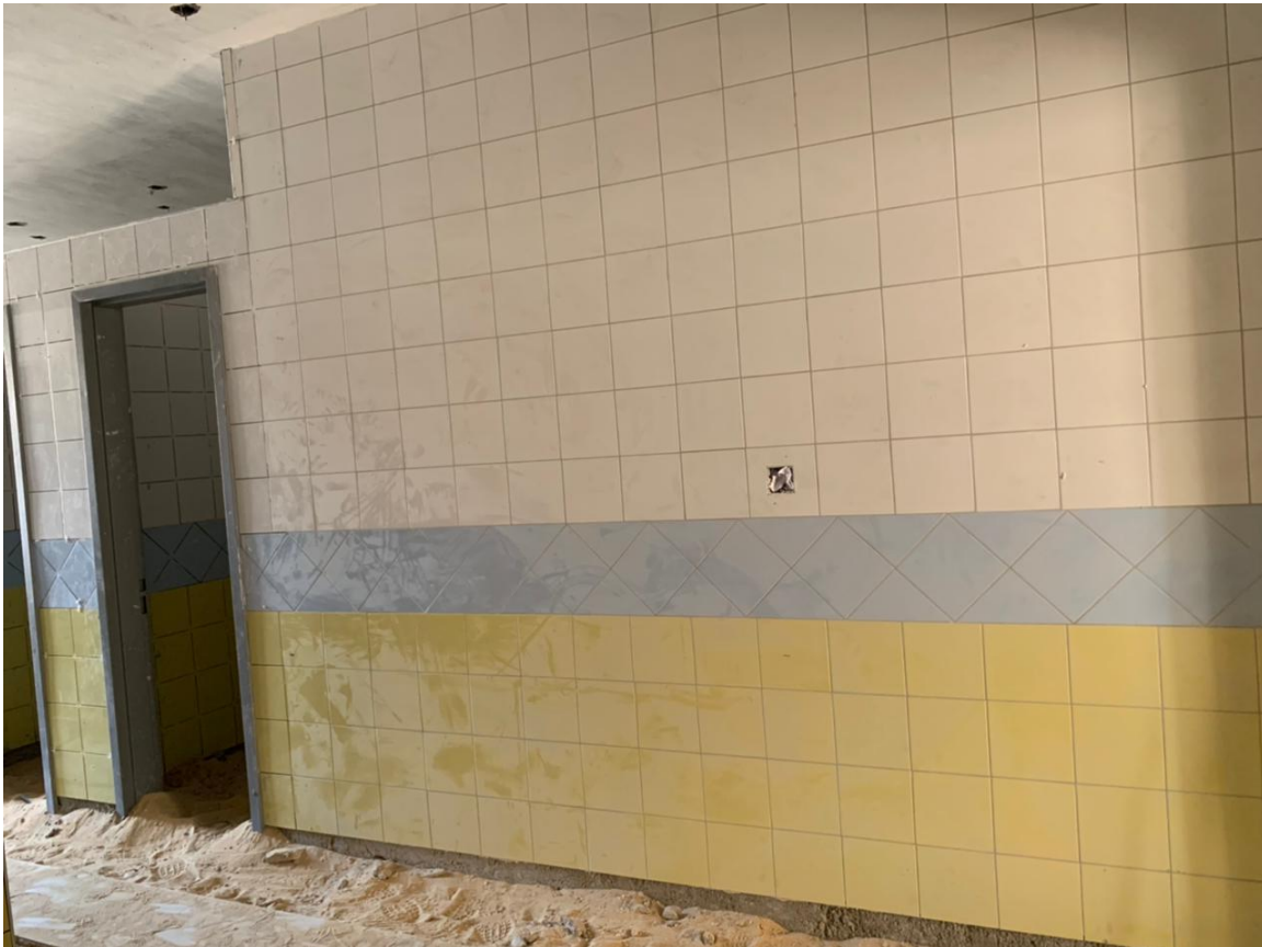
(Figure: 27 & 28)