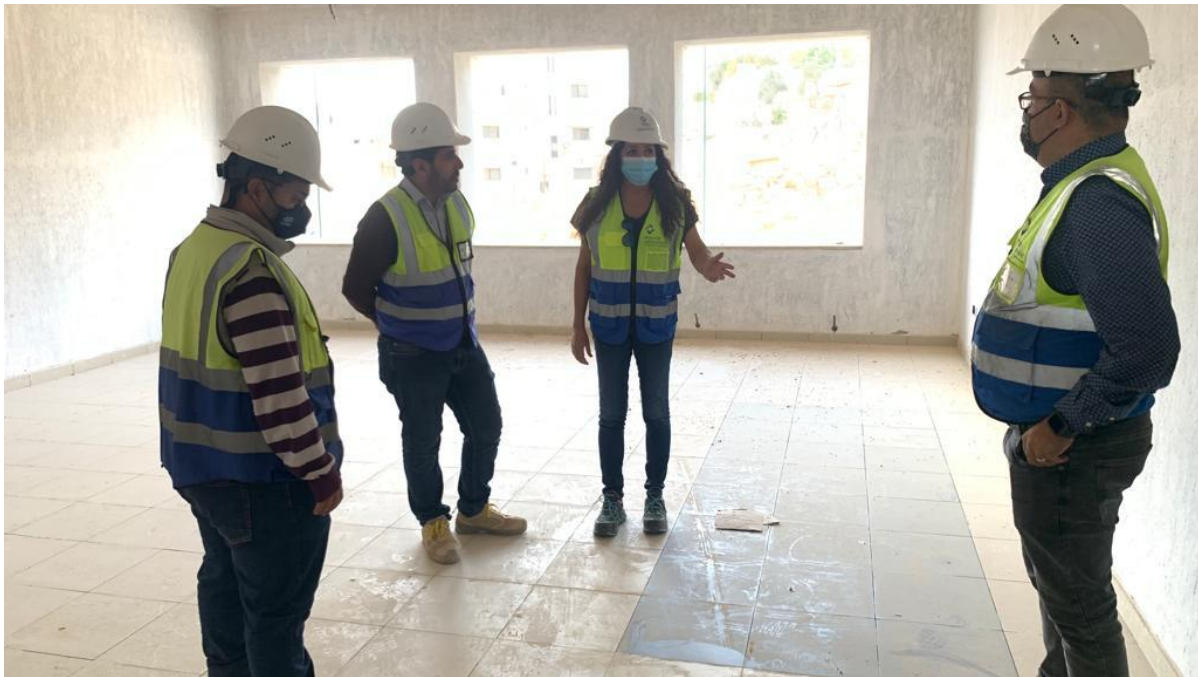
(Figure: 19 & 20)

The color of grout for tiles has been discussed with the Contractor for the areas which have more than one tile color. The Contractor will prepare samples of grout at the three schools subject to the approval of supervision