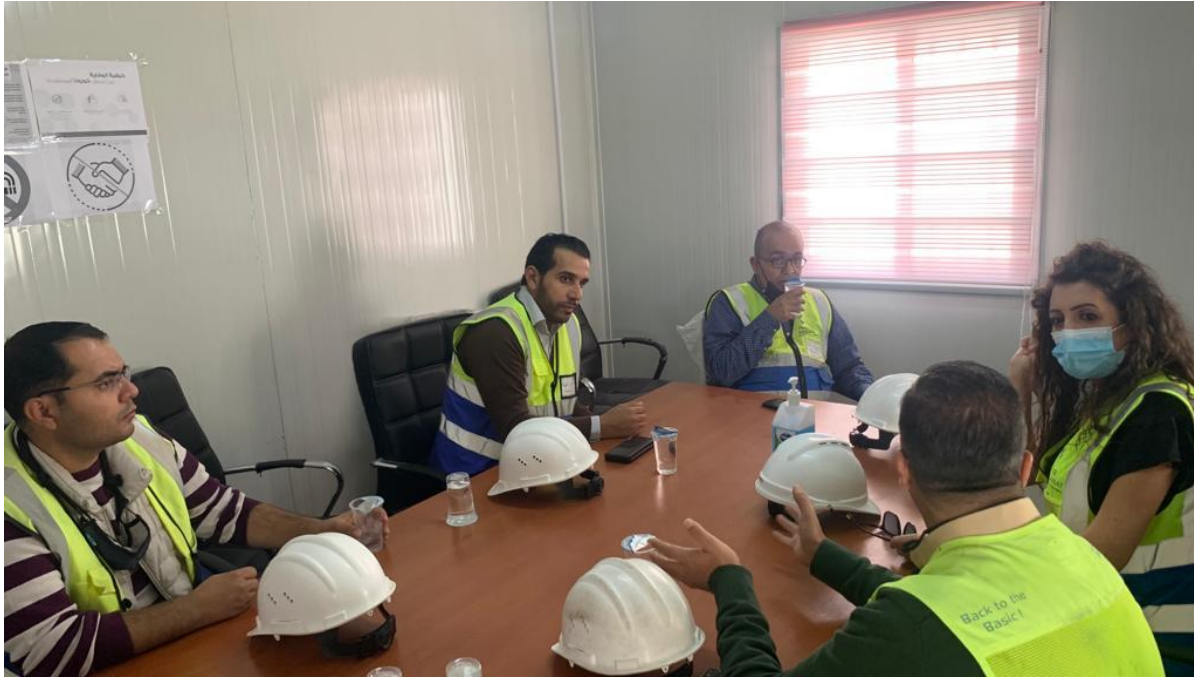
During the site meeting held at the supervision site offices