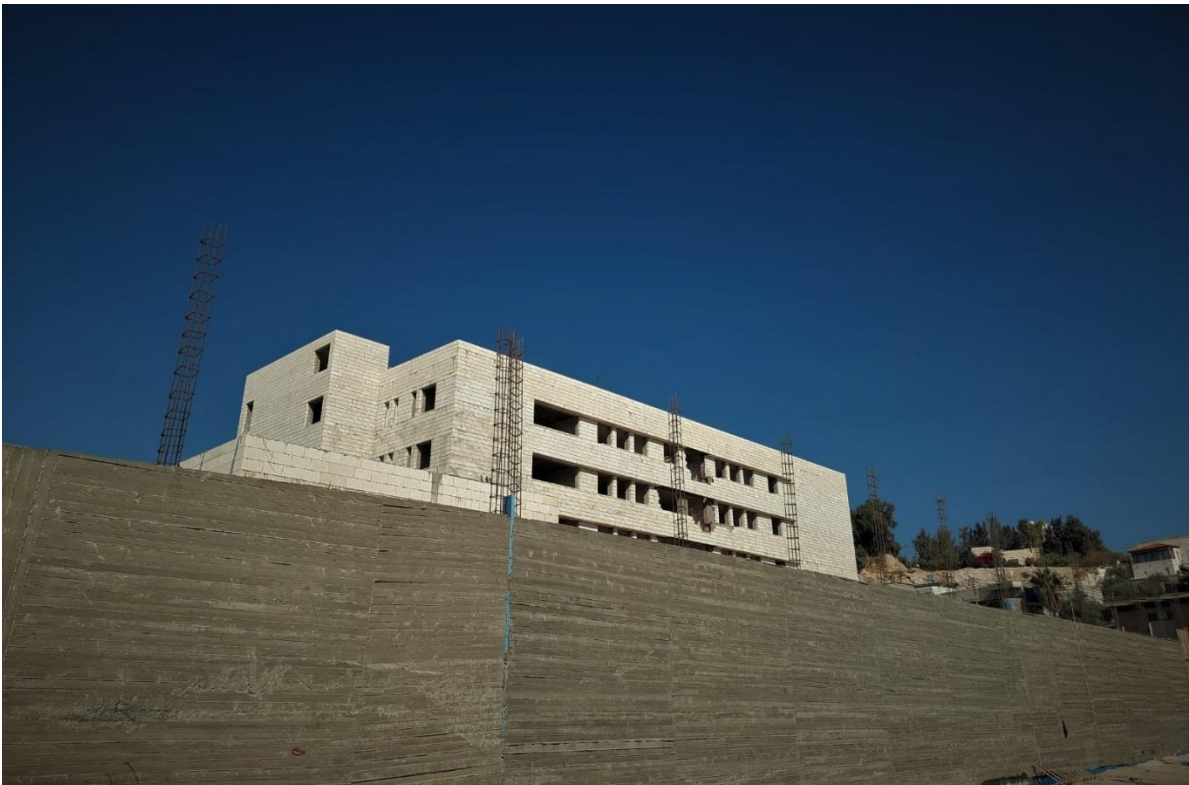
After removing the electrical poles (previous obstacle) on 03/10/2021, the external works continued as shown