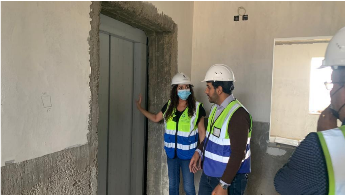
The elevator had been installed