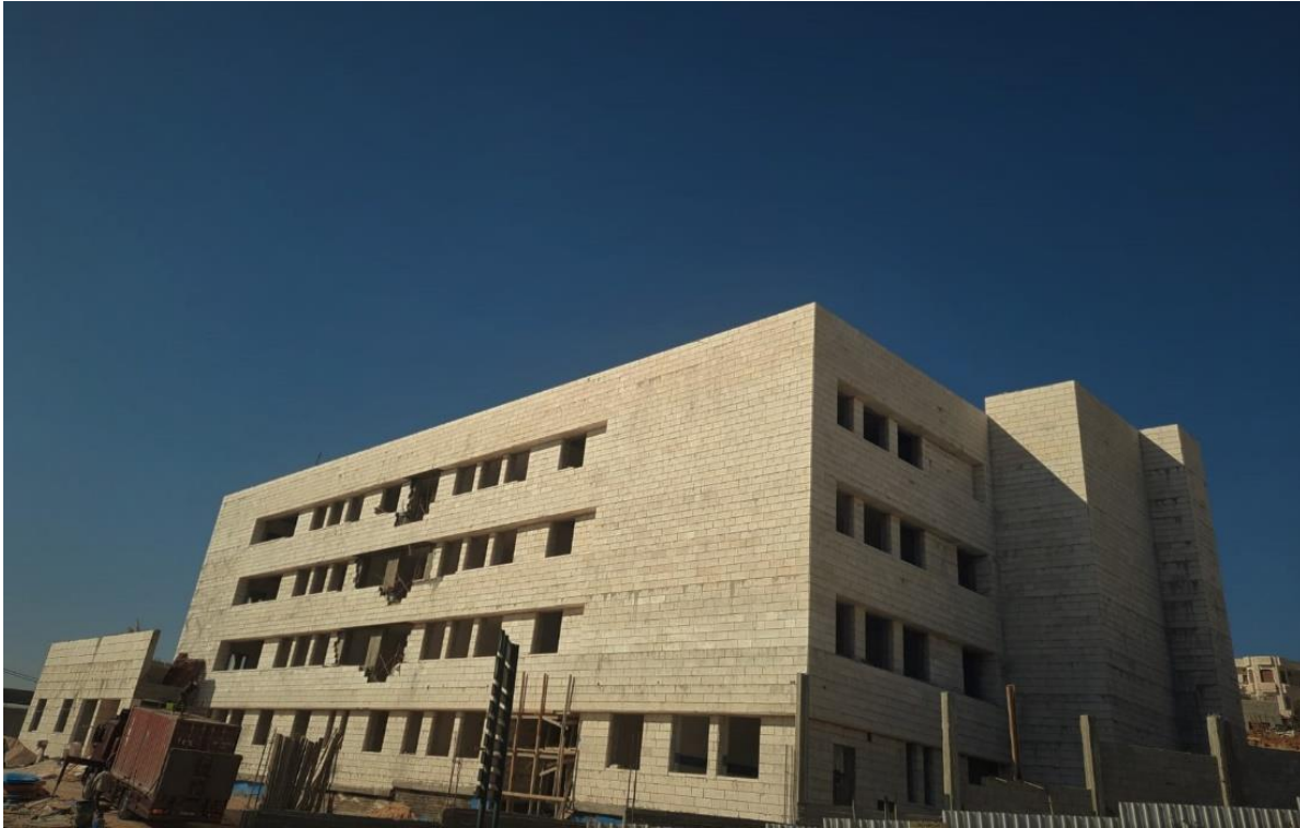
General view of the project