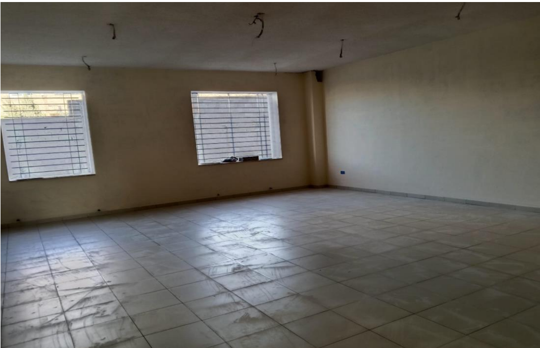
Defected porcelain floor tiles