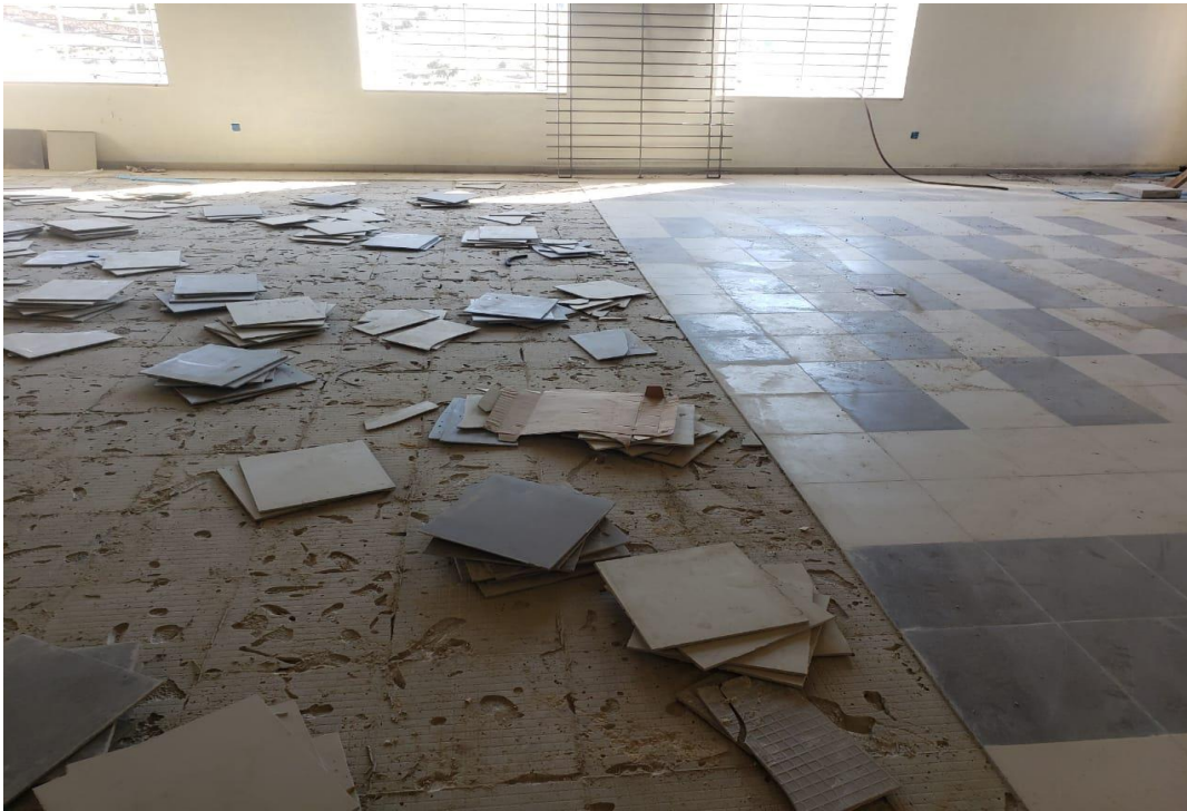
Removing defected porcelain floor tiles