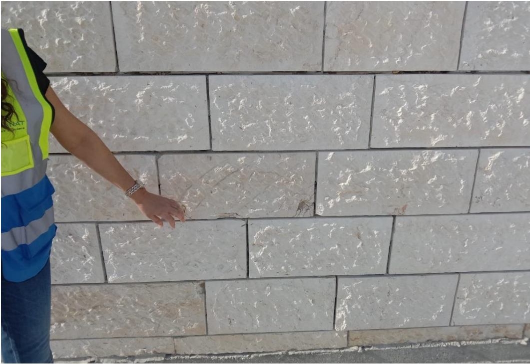
Defected stone work