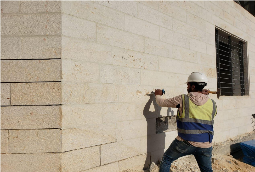
Starting with replacing defected stones