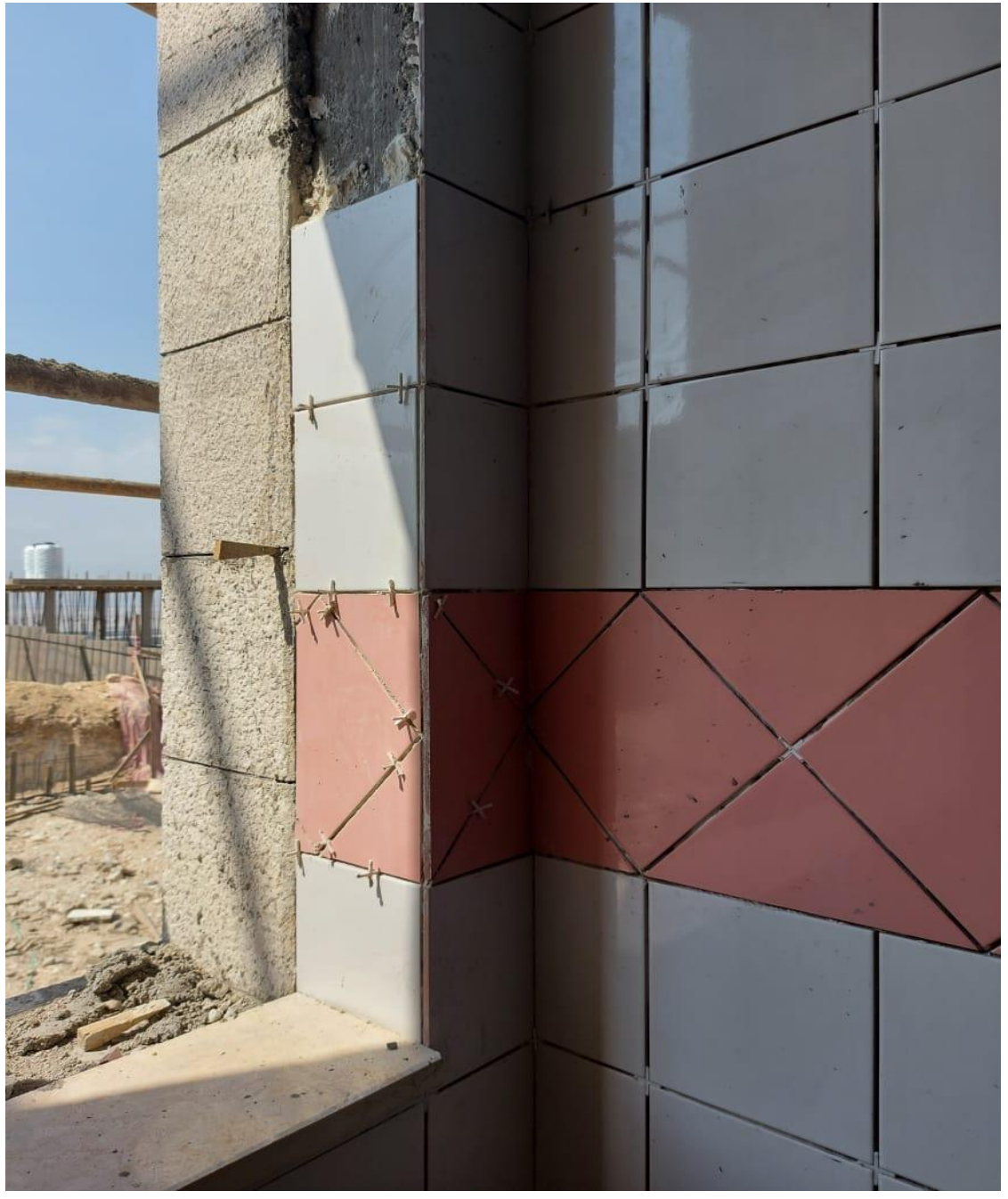
No tiles beads used in the tiling