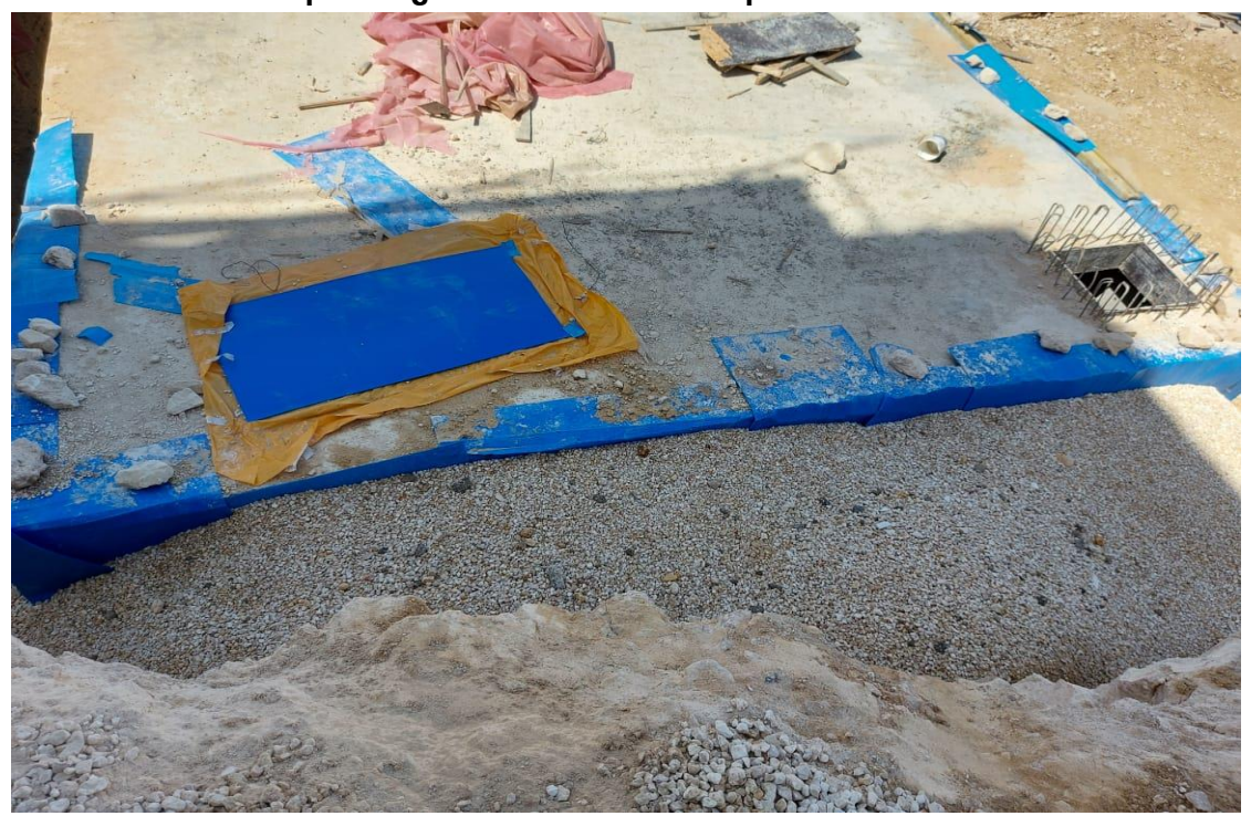
Back-filling for watertank and septic tank