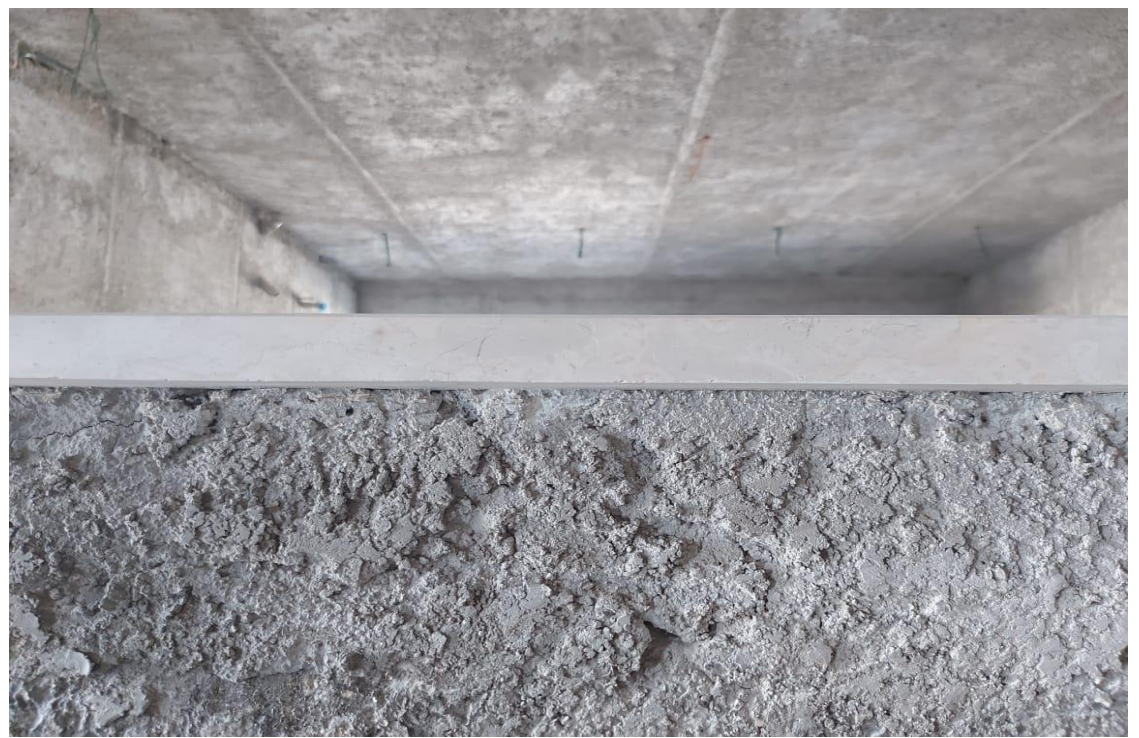
Defects in the sill and installation at lower level