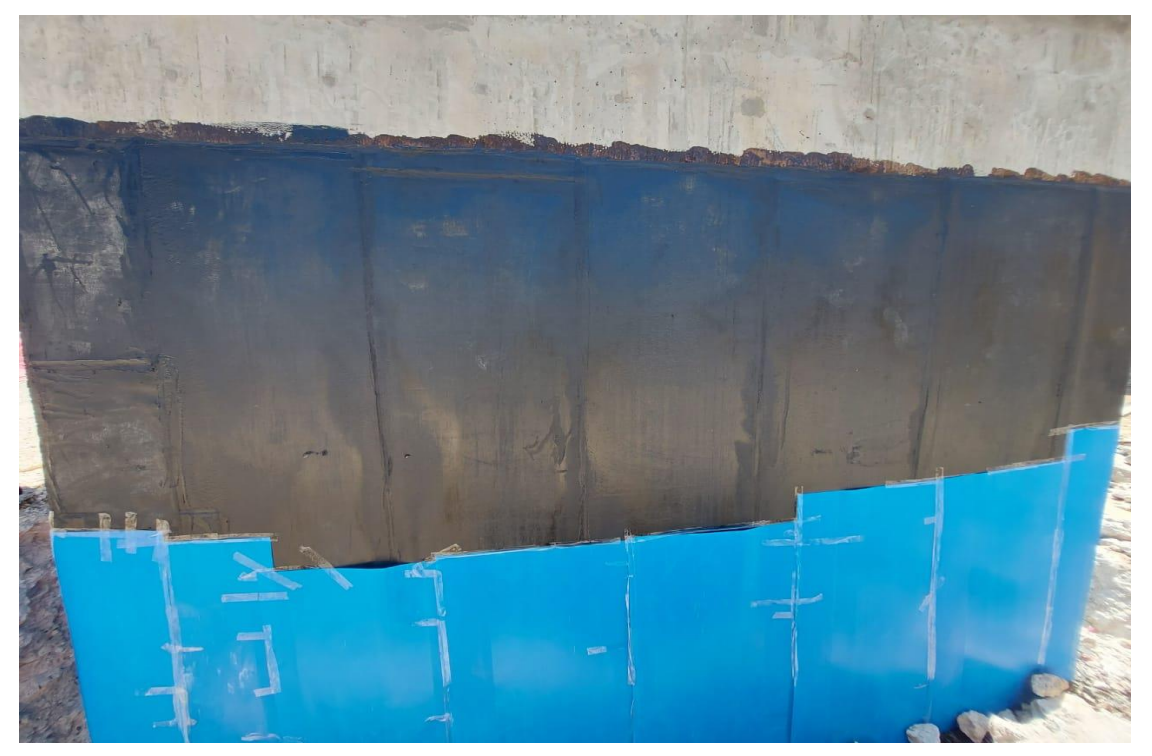
Protection for waterproofing for watertank and septic tank