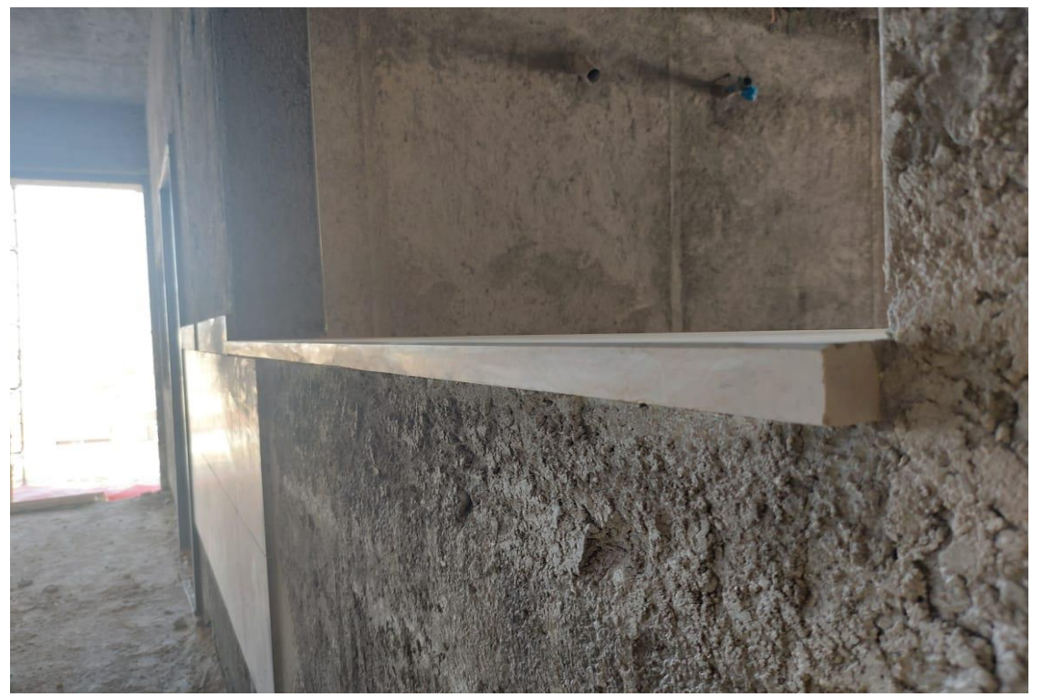
Complied sill at the right level installed