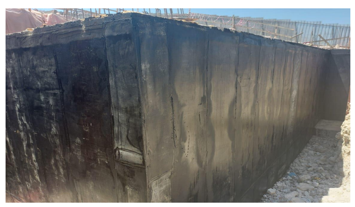
Unprotected waterproofing sheets for watertank and septic tank