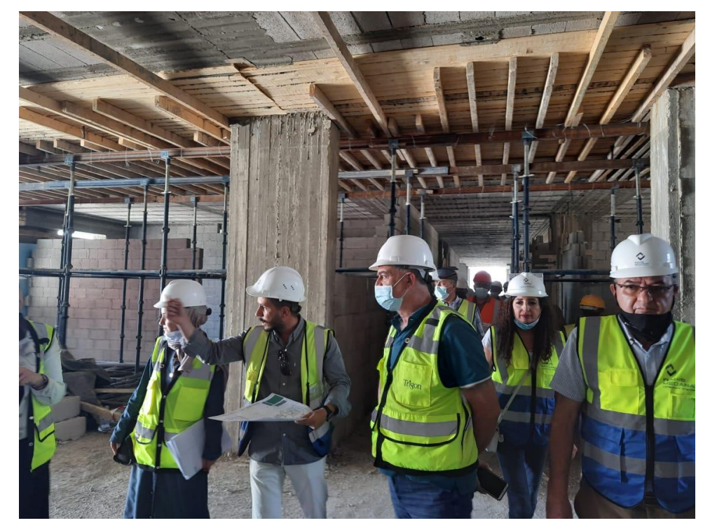
Observing work quality