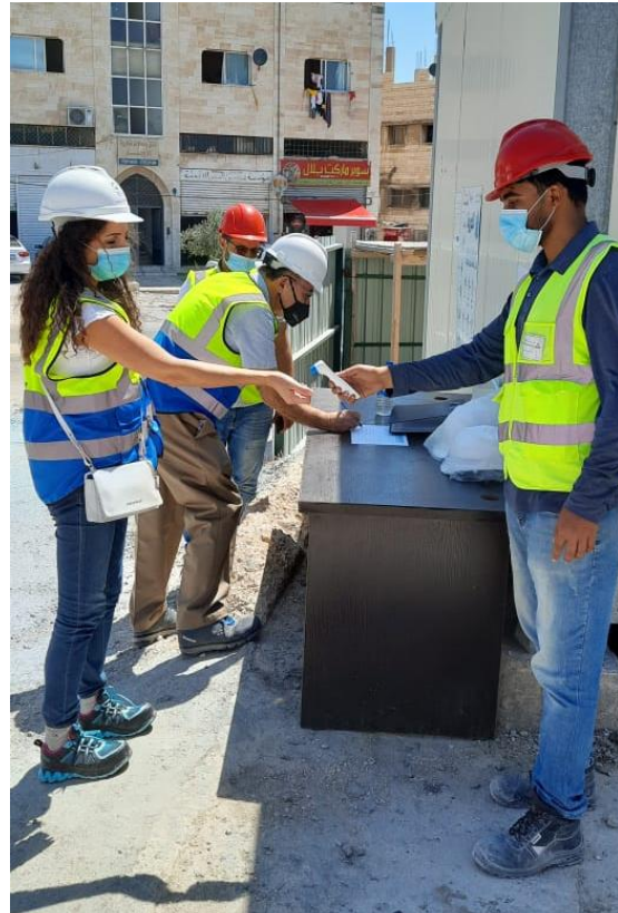
Temperature check, sterilization and signing visitors' attendance sheet at the entrance of the site, complying with Covid-19 Protocol