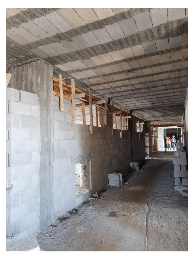
Formwork for lintels of internal windows