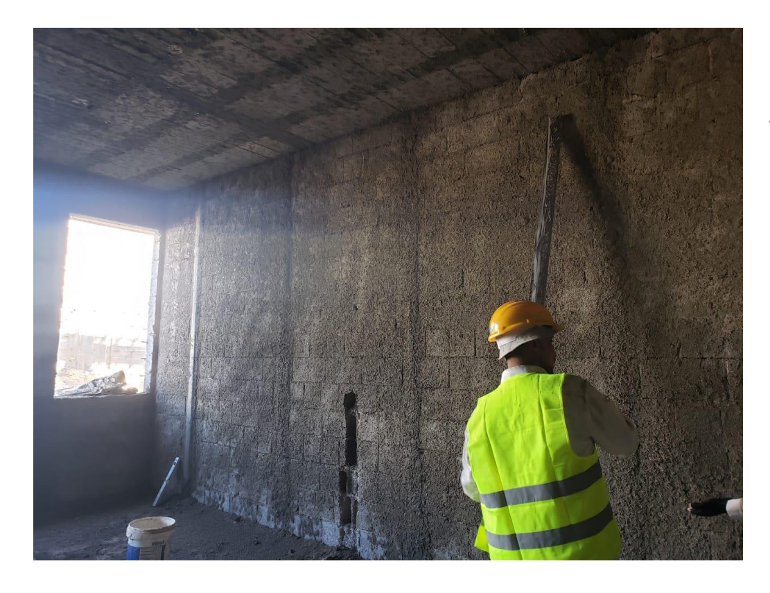
First stage of plastering work