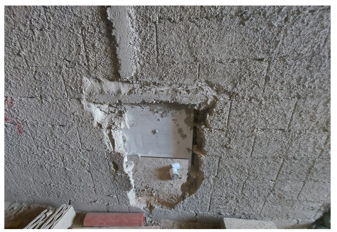
Starting to rectify Mechanical Cabinets Installation