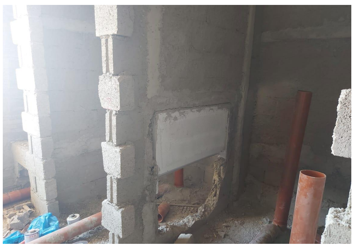
Case of Mechanical Cabinets installation