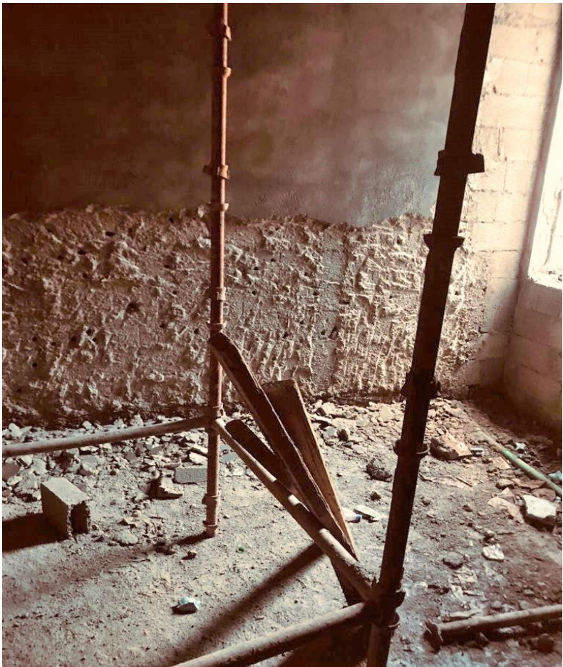
Removing of final layer of plastering