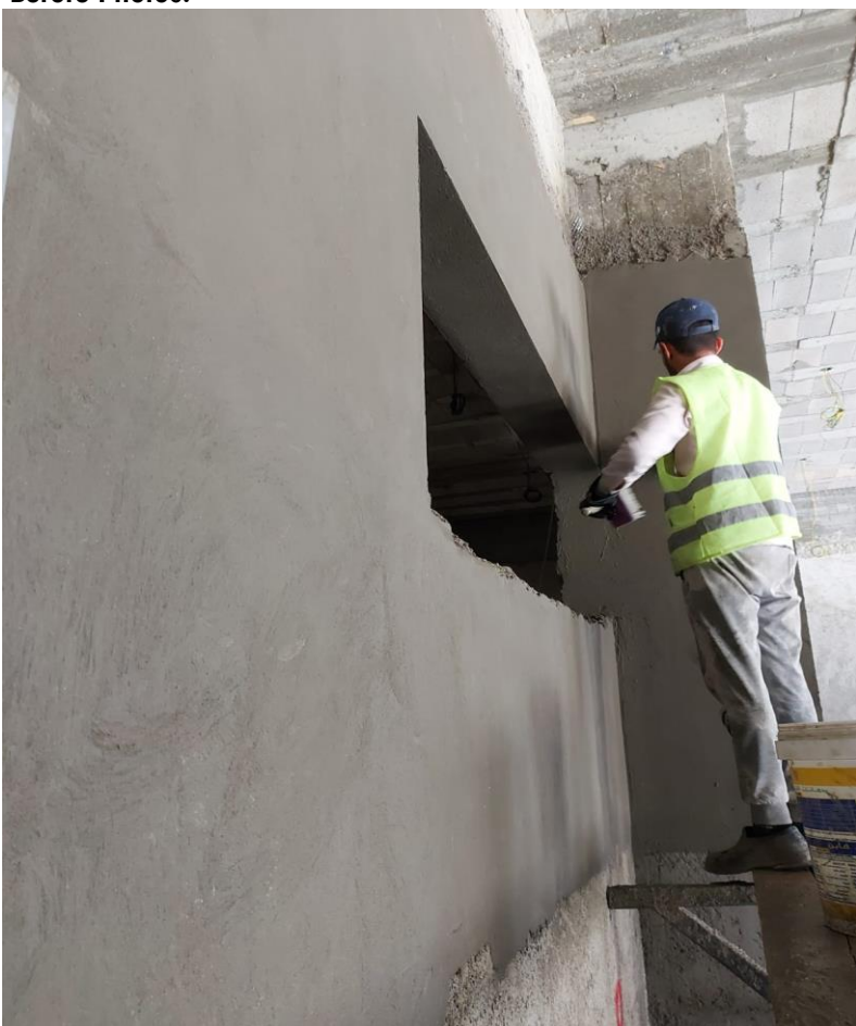
Starting with plastering final finish before completion of rough finish and sill installation