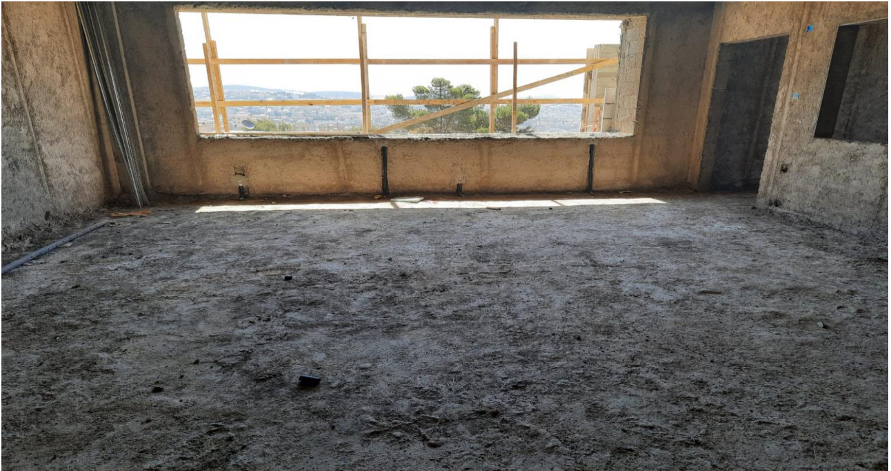
Radiators first fix have been installed top- bottom without approval