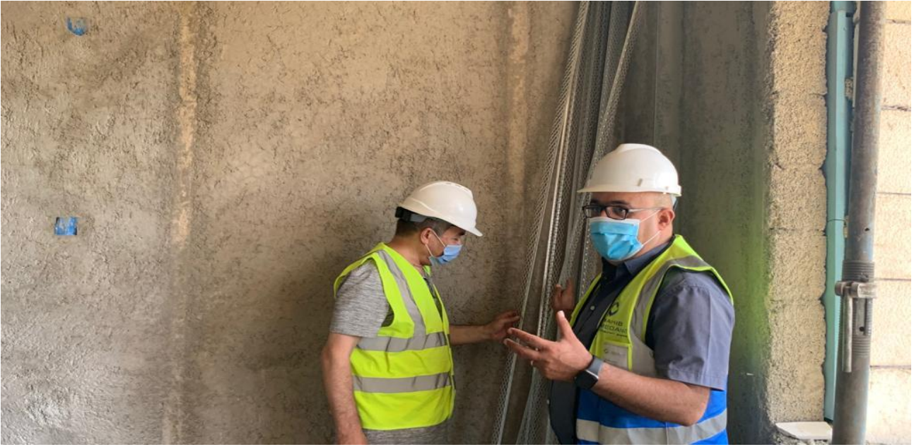
Substitution to the plastering beads