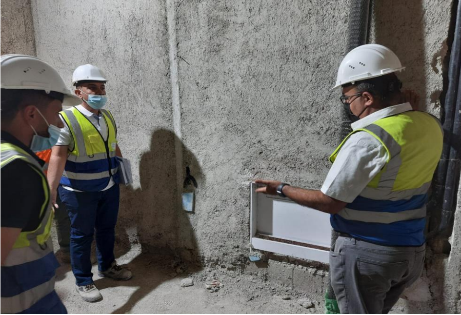
Mechanical cabinet not matching with plastering face