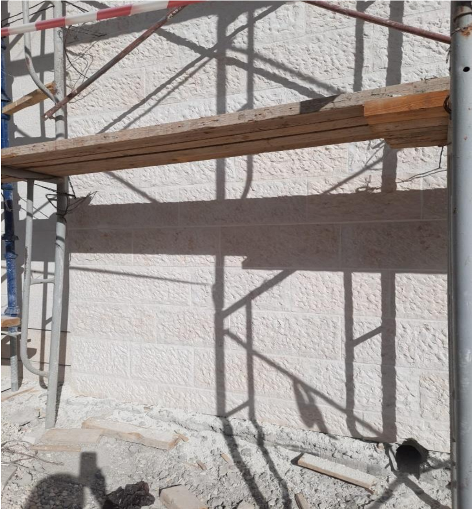
Stone façade after removing the paint and rectifying the defects