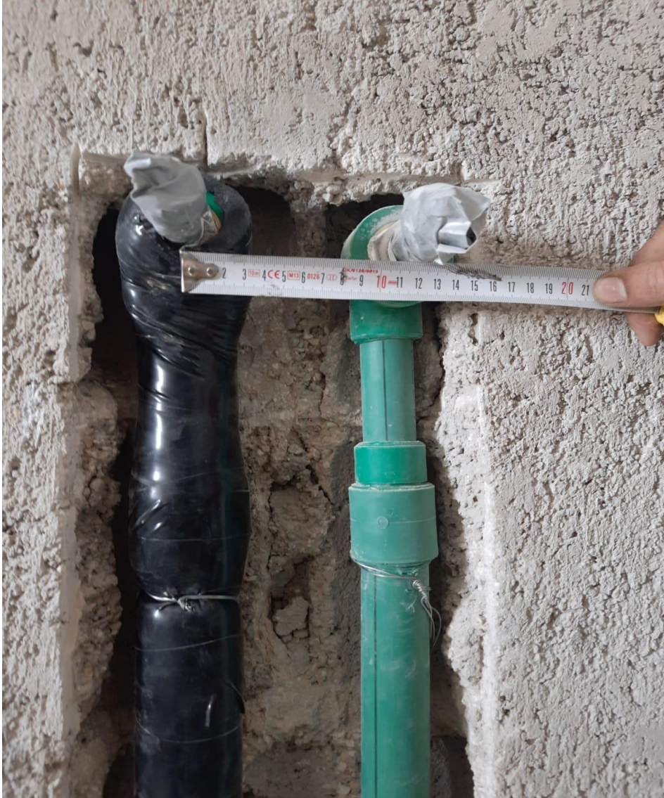
Creating a space between hot and cold water pipes and insulation to the hot water pipe