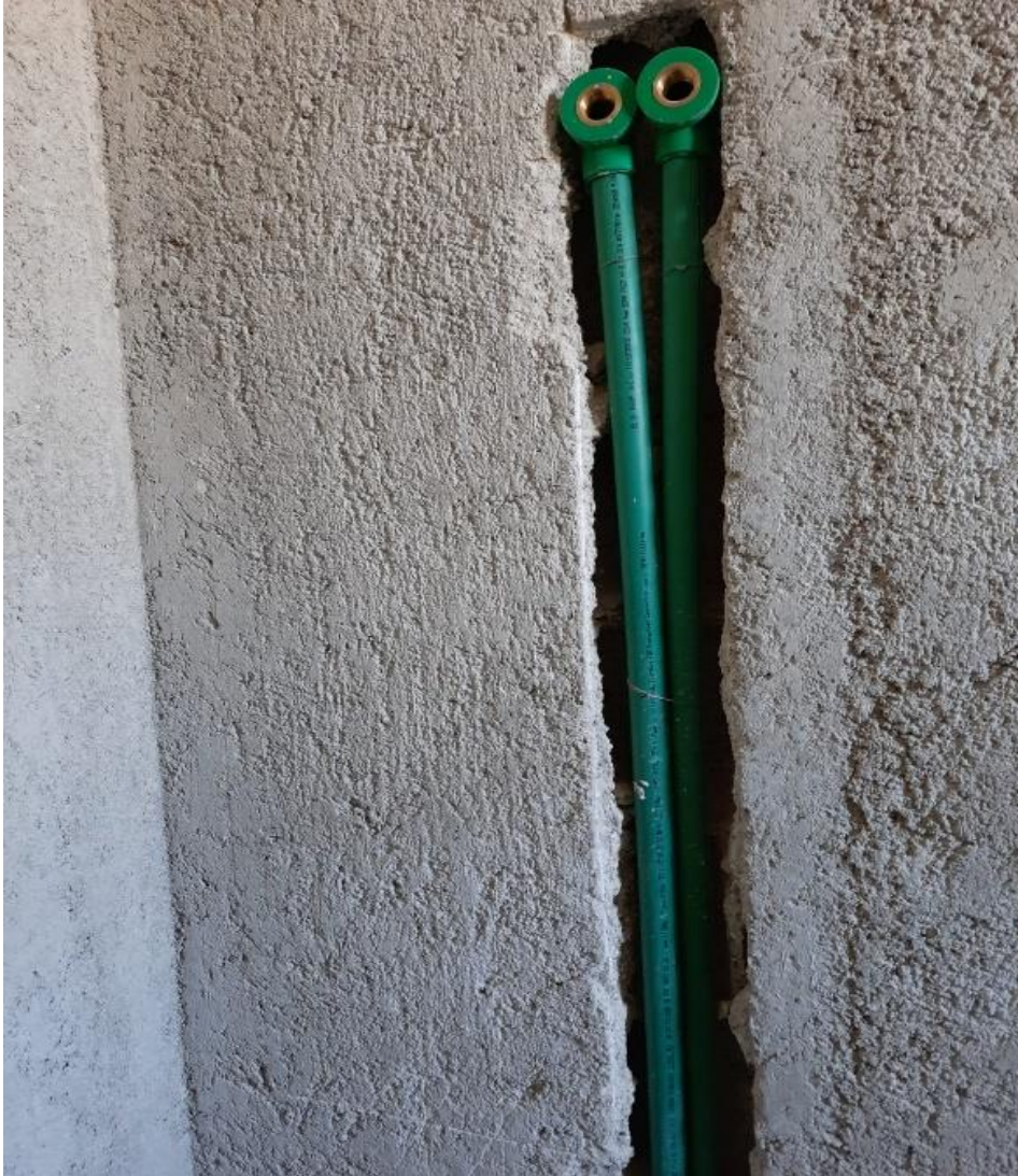
Hot and cold water pipes close together