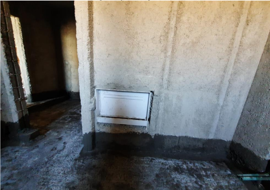
Mechanical cabinet close to the door frame.