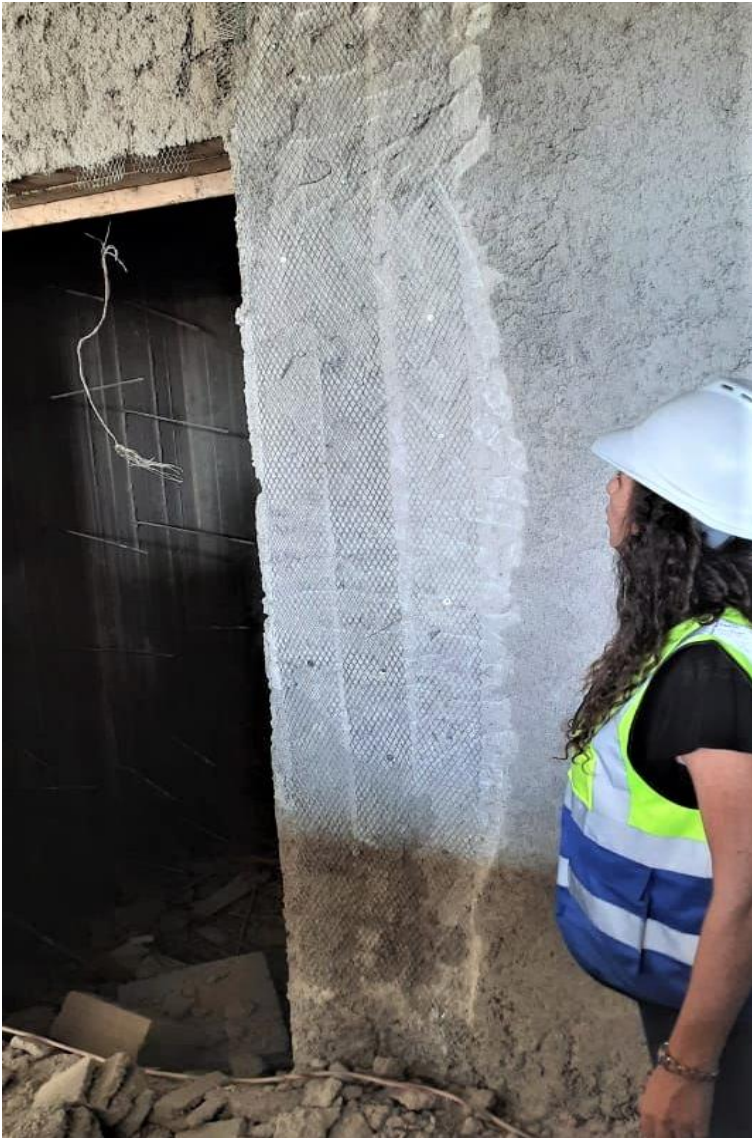
Repair to match the concrete wall with the block wall. (Previous Remark)