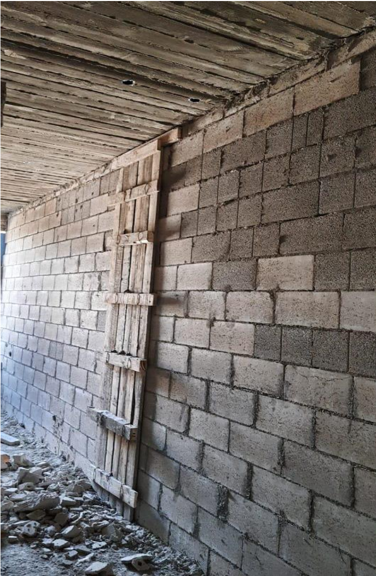
Creating a stiffner column in the block wall. (Previous Remark)