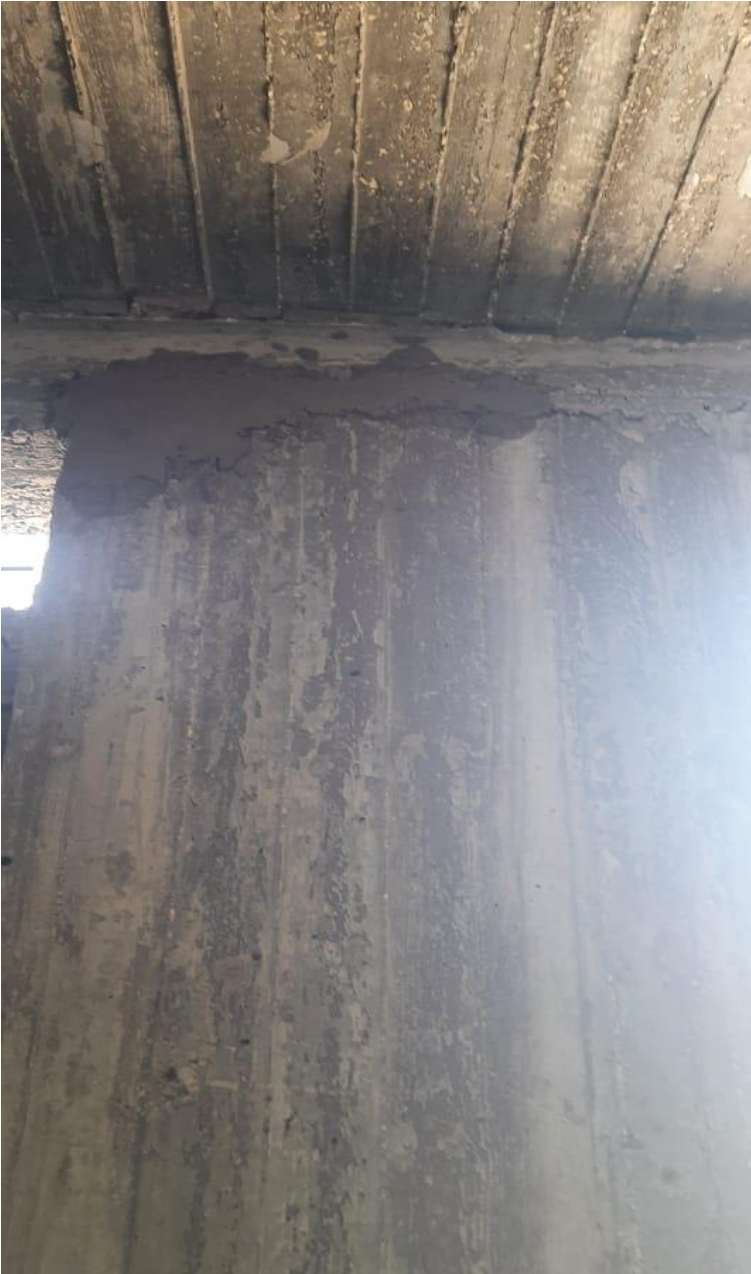
Repair of the segregation and roughness in the slab concrete