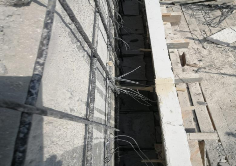
Complying with requirements in stone building (Previous Remark)