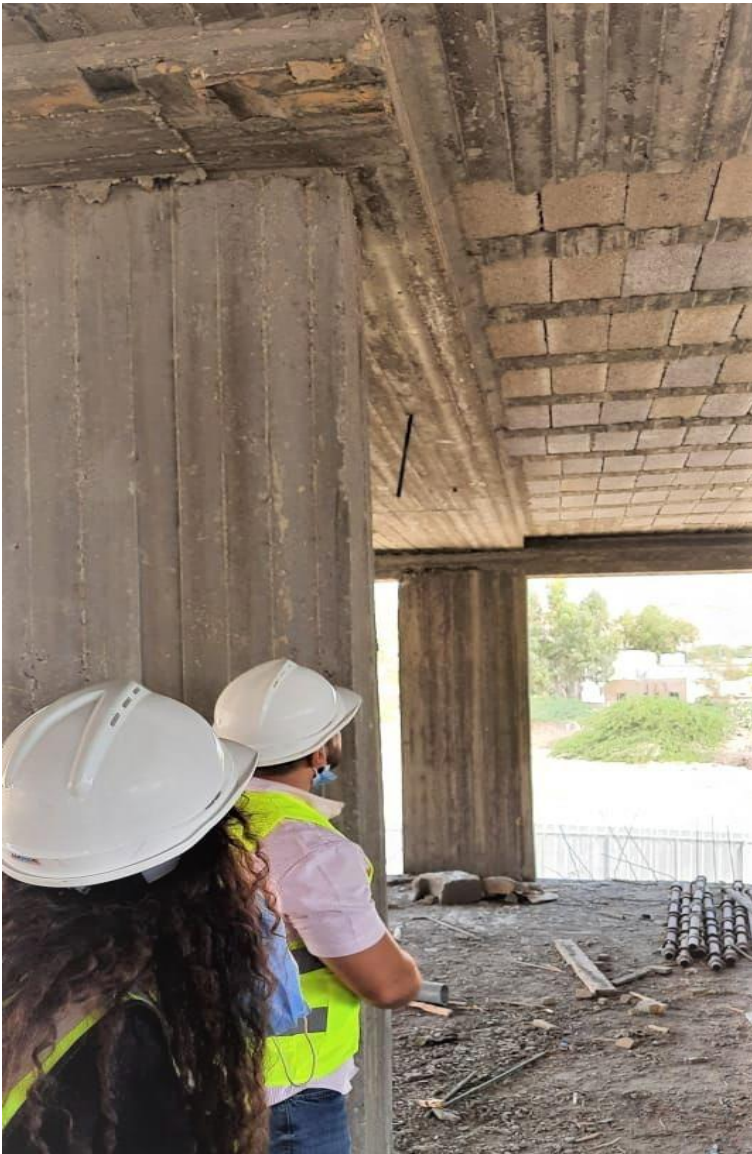
Remaining wooden pieces at the slab