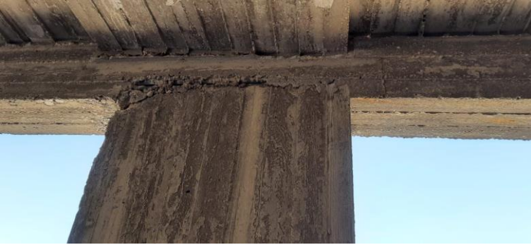
Segregation and roughness in the concrete of slab