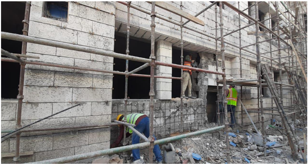
Finalizing the rectification for the elevation limit