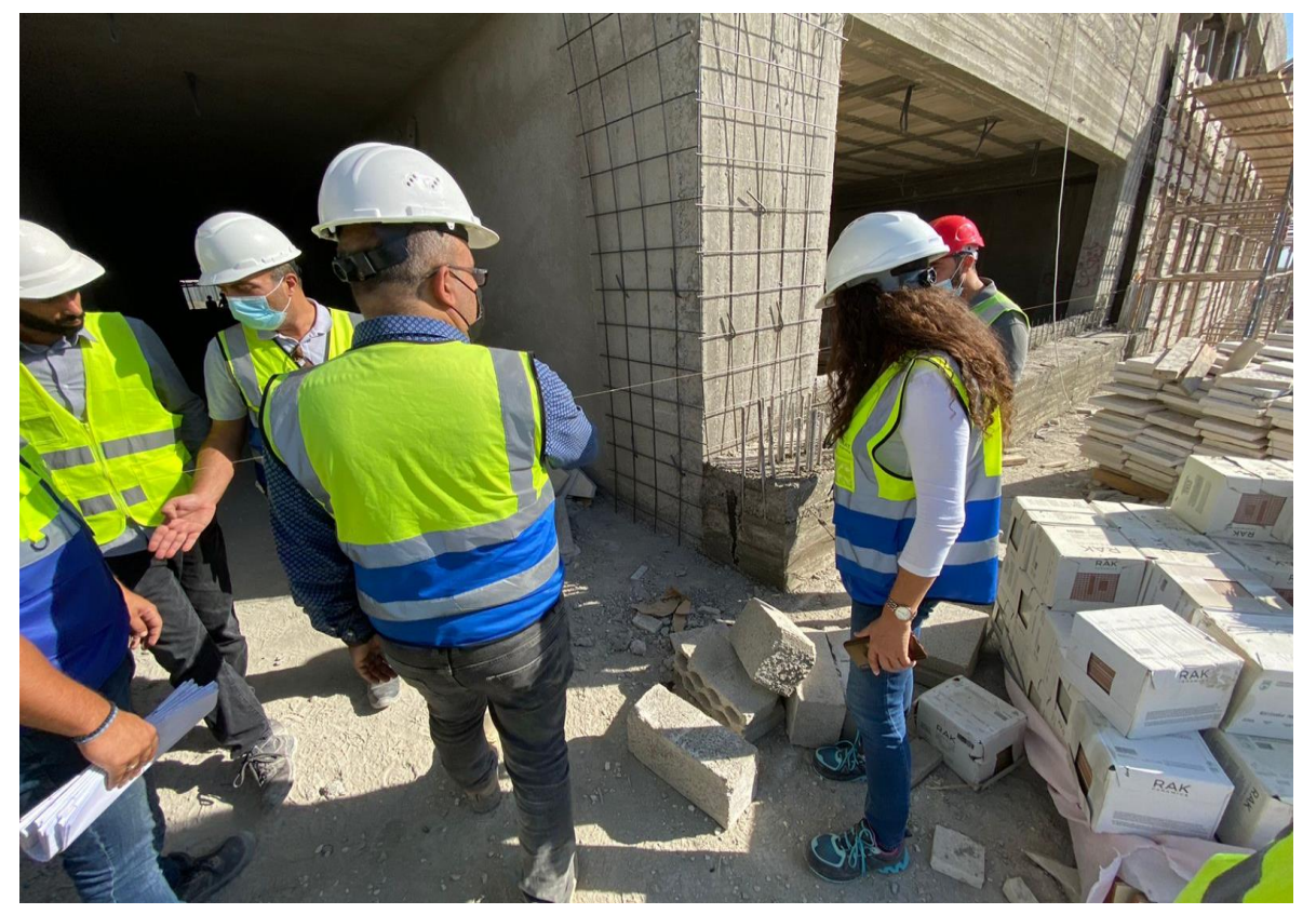
E xecuting expansion joint wrongly