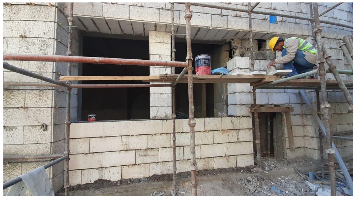
Process of rectification for the elevation limit