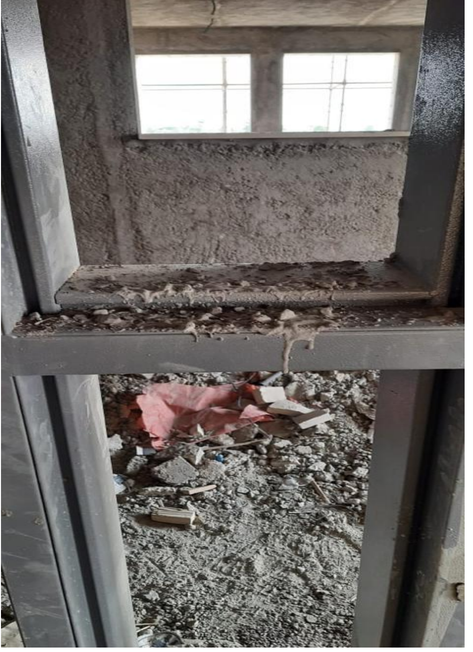
Door frames are not protected