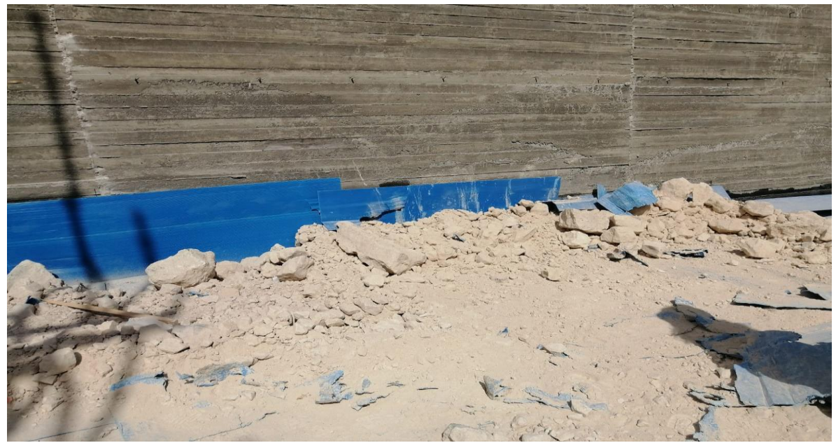
Uncomplied backfilling full of boulders

The limit of the elevation needs rectification