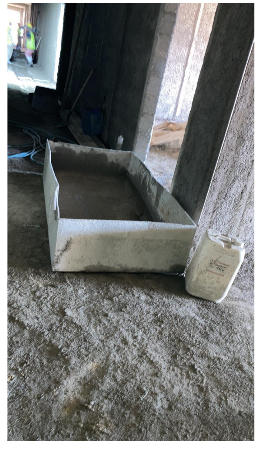
The Contractor is using a special container for mortar mixing used for plastering