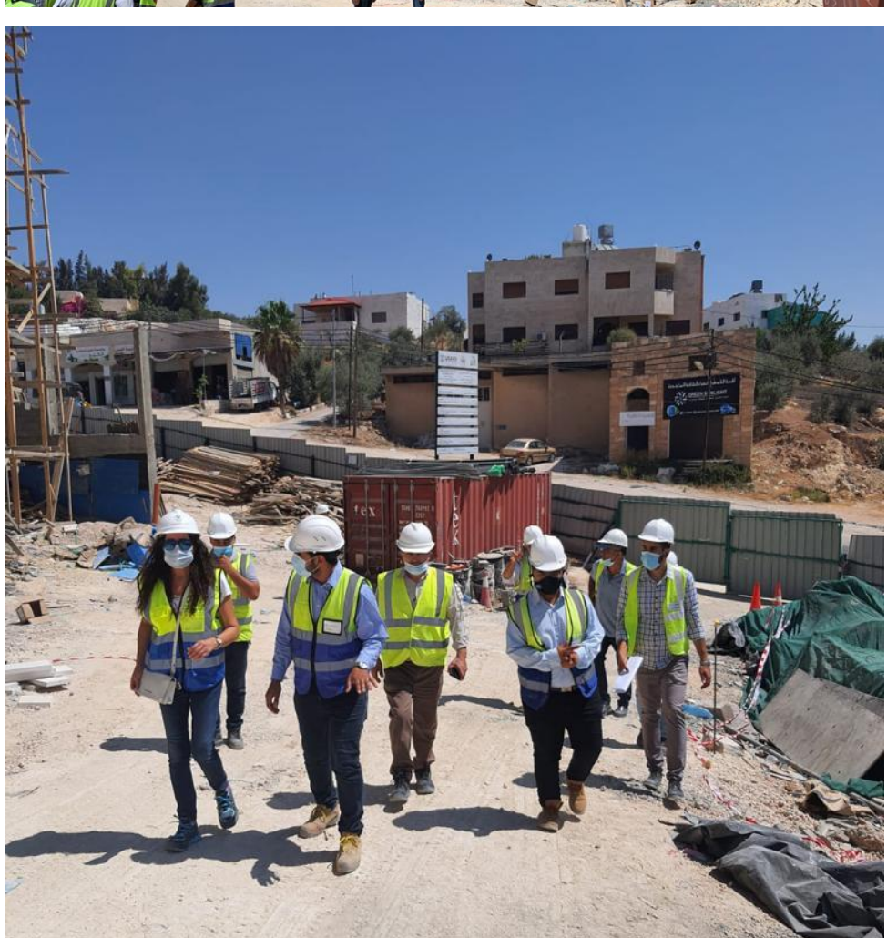
A tour inside the site was conducted