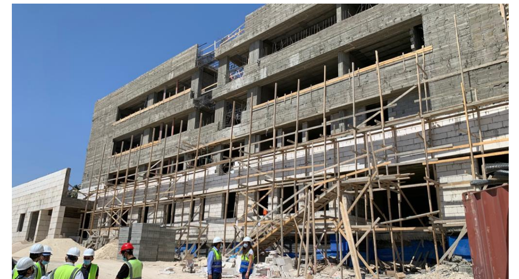
General view of the main building