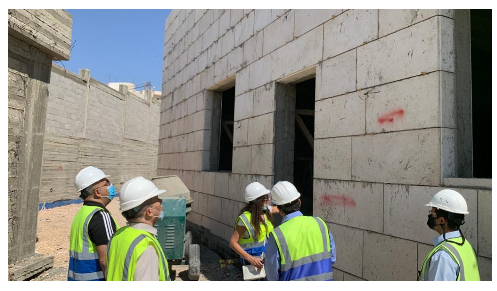
Checking quality of stonework

\\SERVER\Data\E\PROJECTS FILES\368\Home office support Site Visits\July Visits\22-17072021.docx