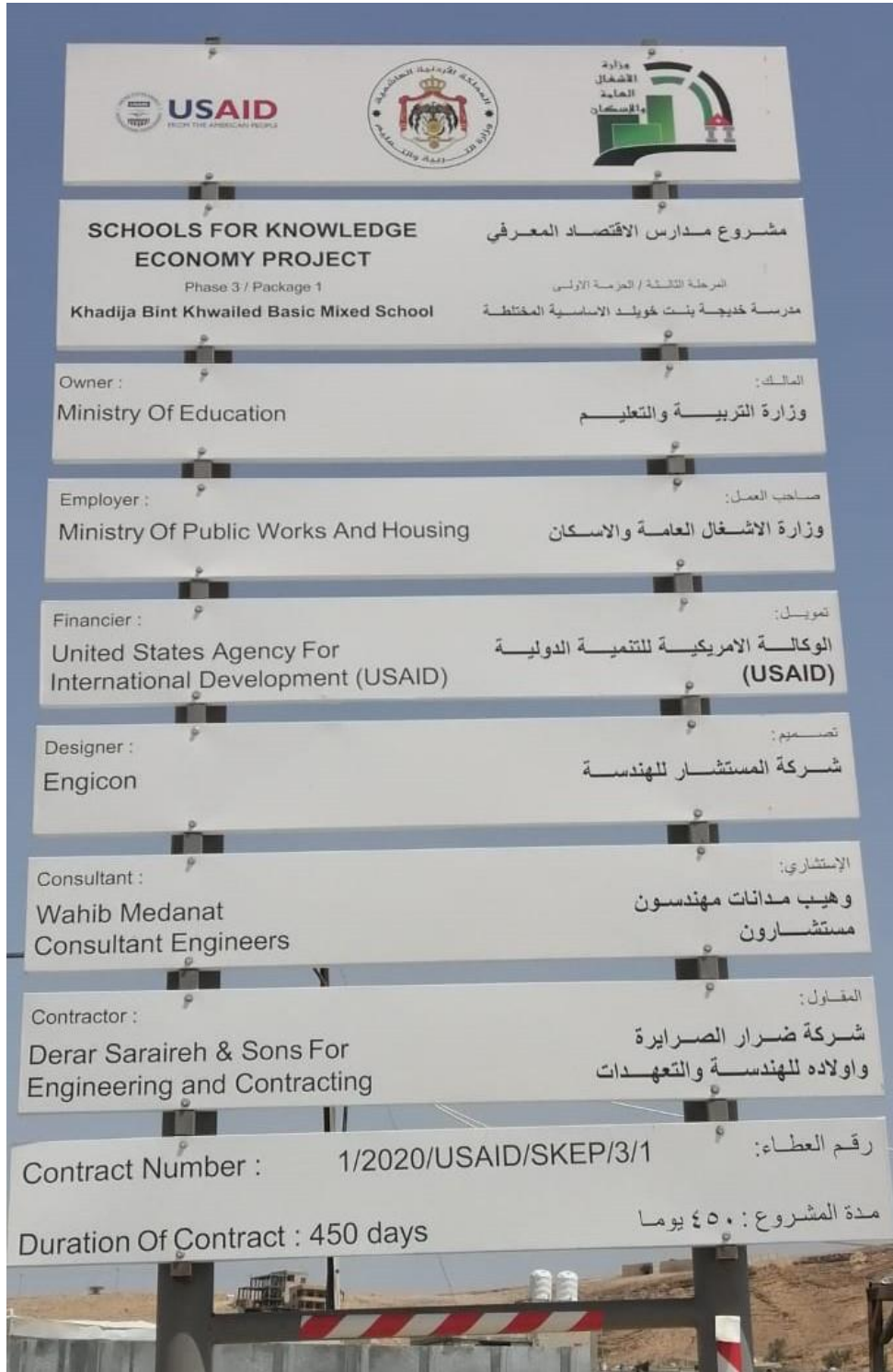
Project ID Sign on Site