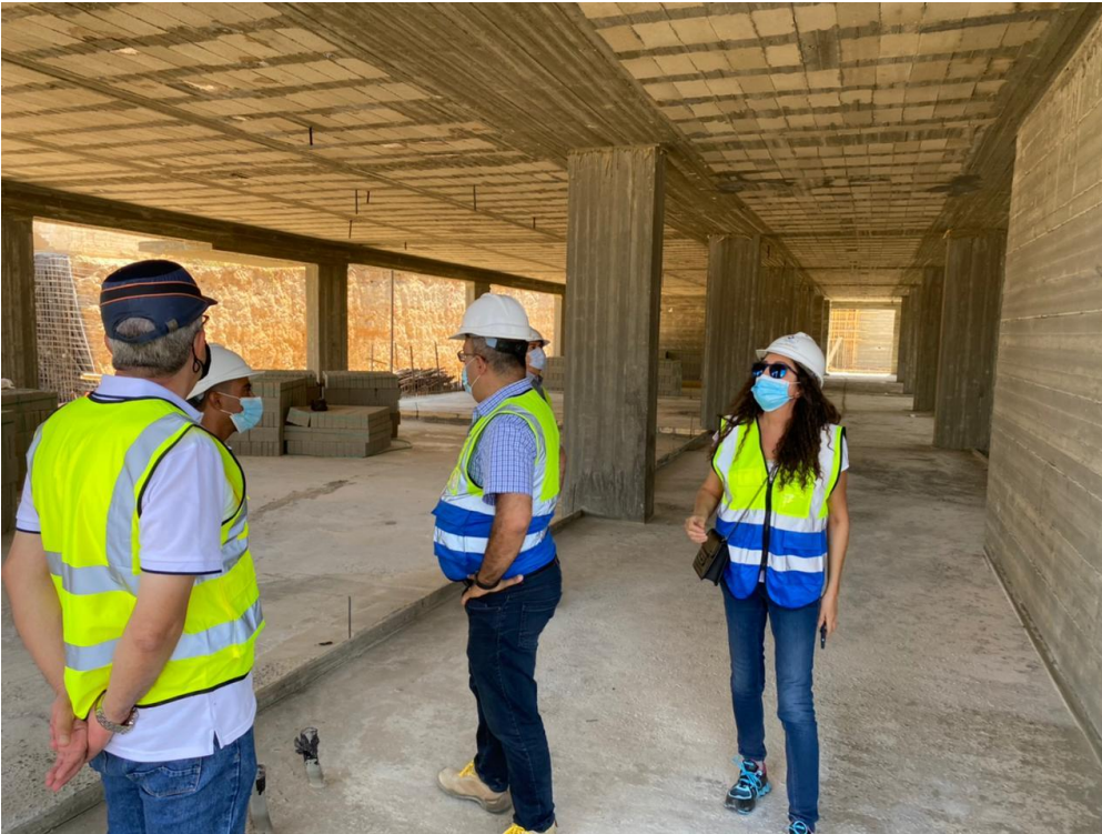
Block work in the school has not started yet