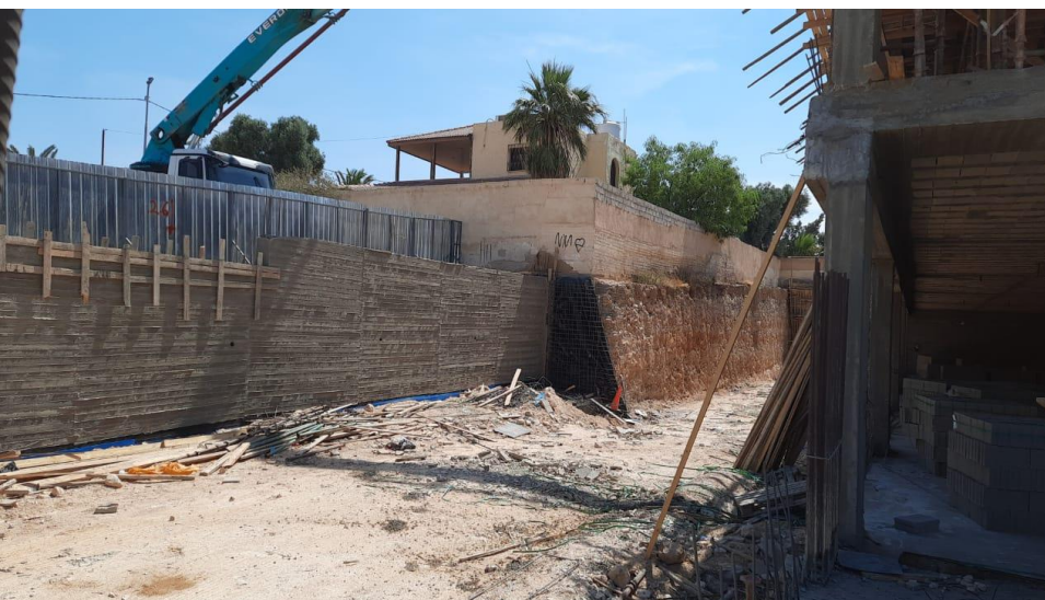
Construction of boundary wall adjacent to neighbor wall should start soon since the Contractor received approval several weeks ago