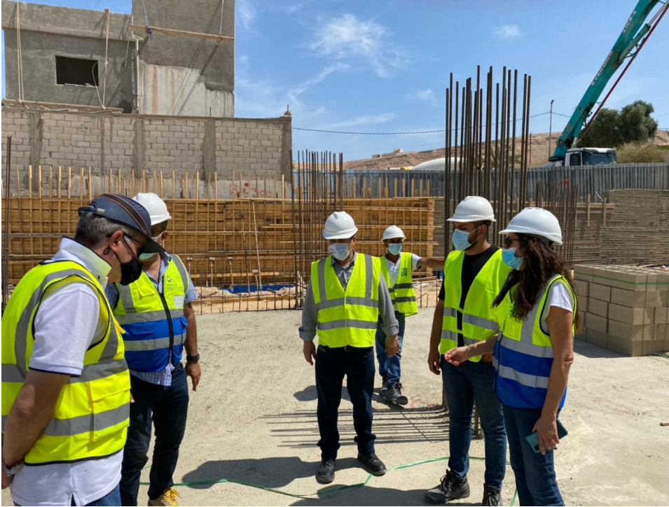
Discussion with the contractor as mentioned in the report