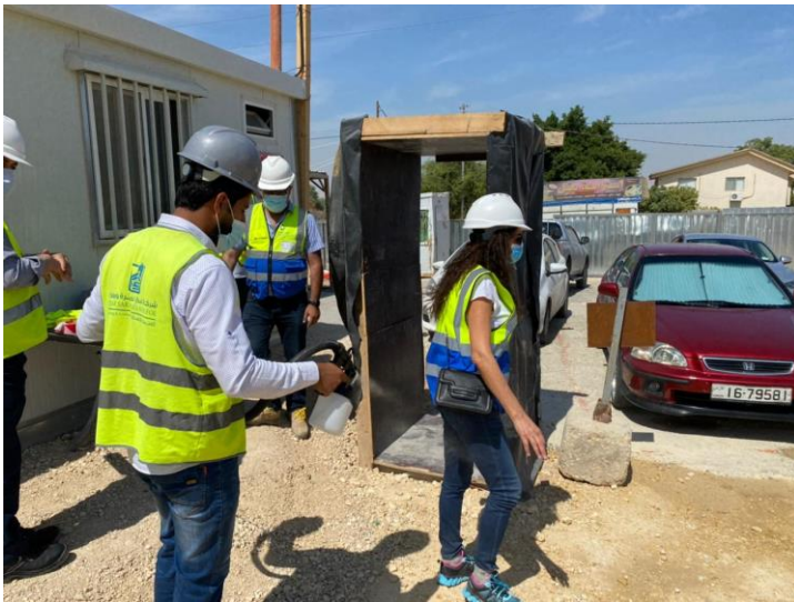
Temperature check, sterilization and signing visitors' attendance sheet at the entrance of the site, complying with Covid-19 Protocol