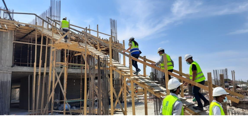
A tour was conducted around the site