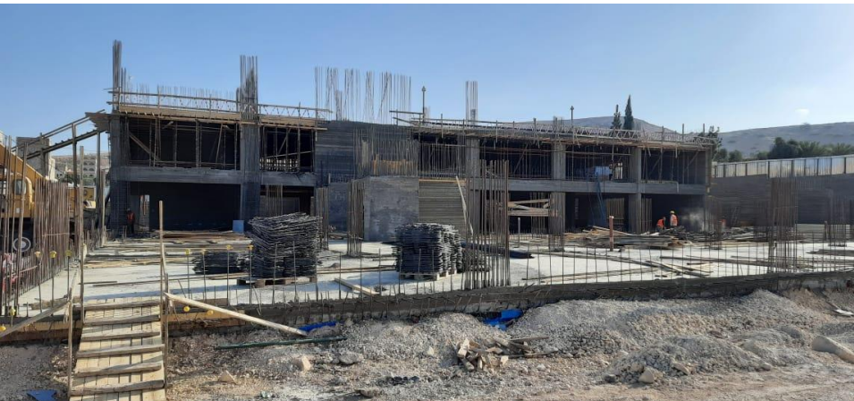
Construction of columns at zones (B) and (C) is starting