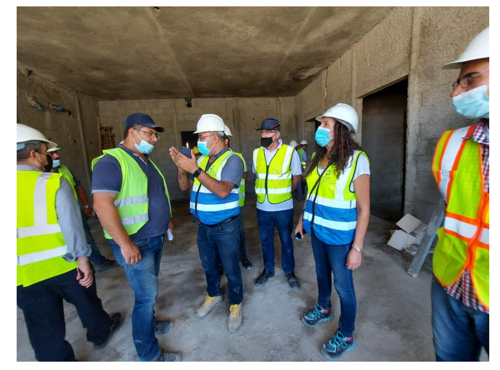
Remarks regarding plastering were given