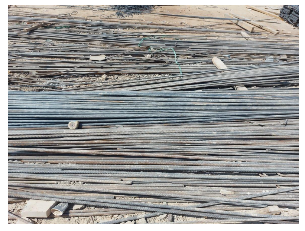
The storage status of steel reinforcement needs improvement