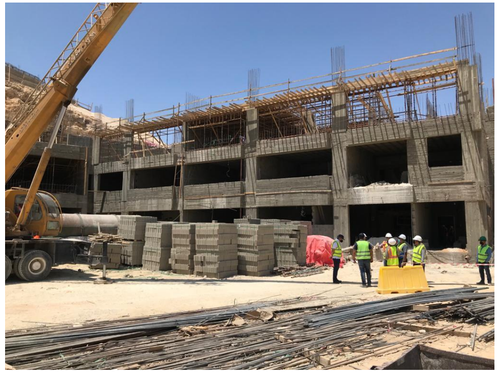
Starting of third floor slab formwork