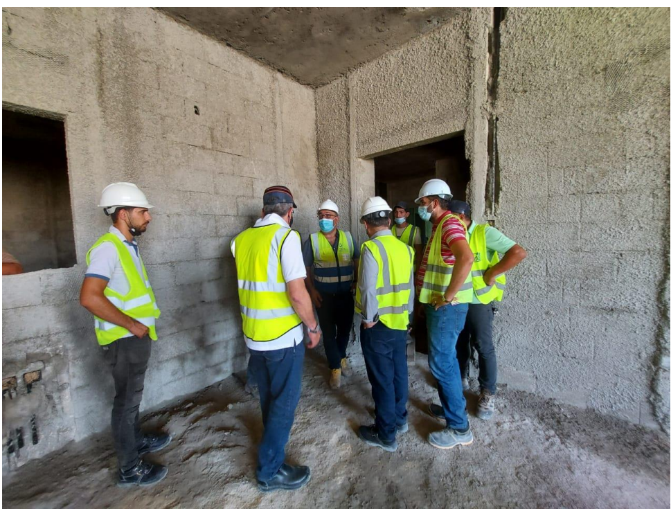
The quality of blockwork is acceptable