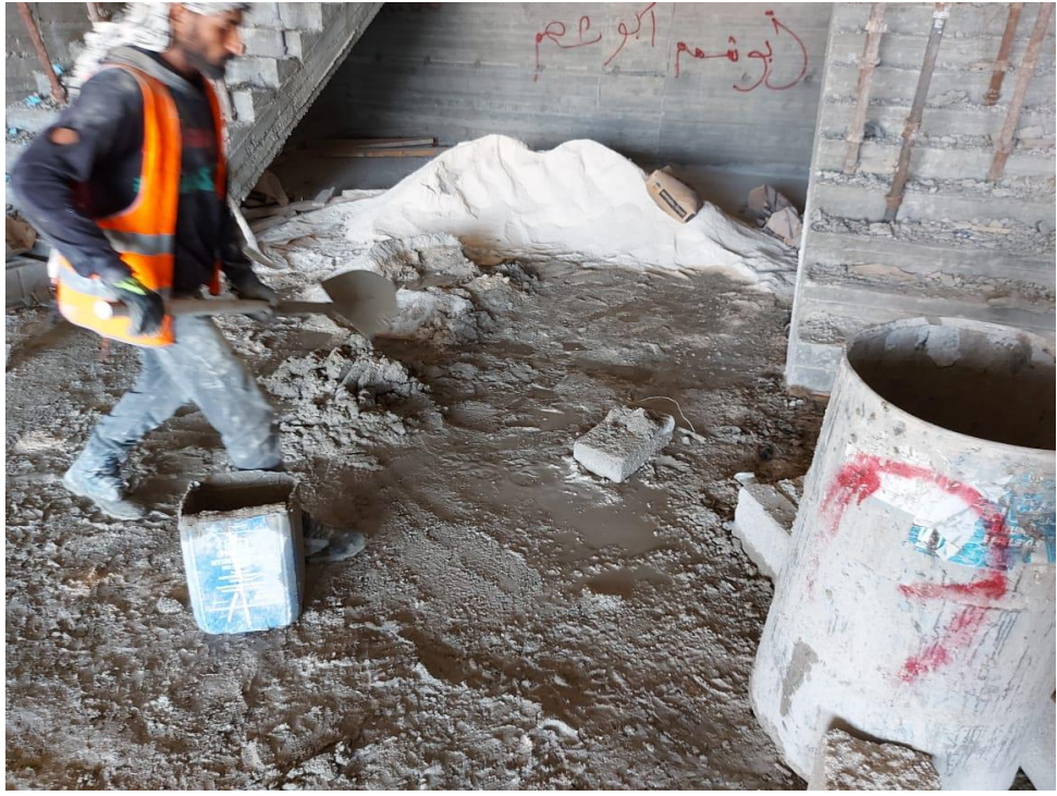
The Contractor was instructed to provide special container for mortar mixing used for plastering.