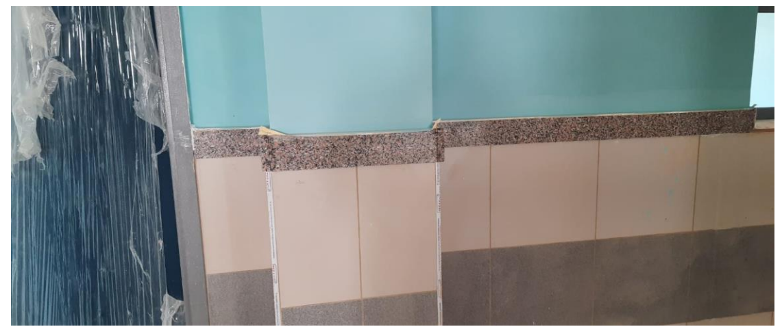
Rectifying the waving in plastering and painting of walls at the corridors