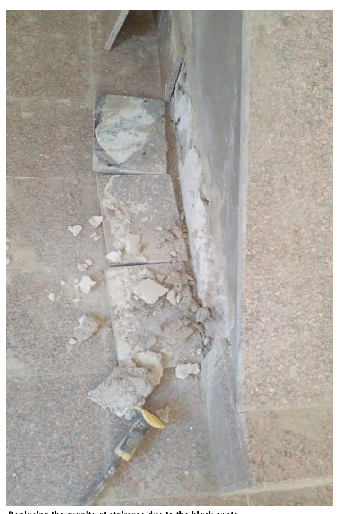
Replacing the granite at staircase due to the black spots