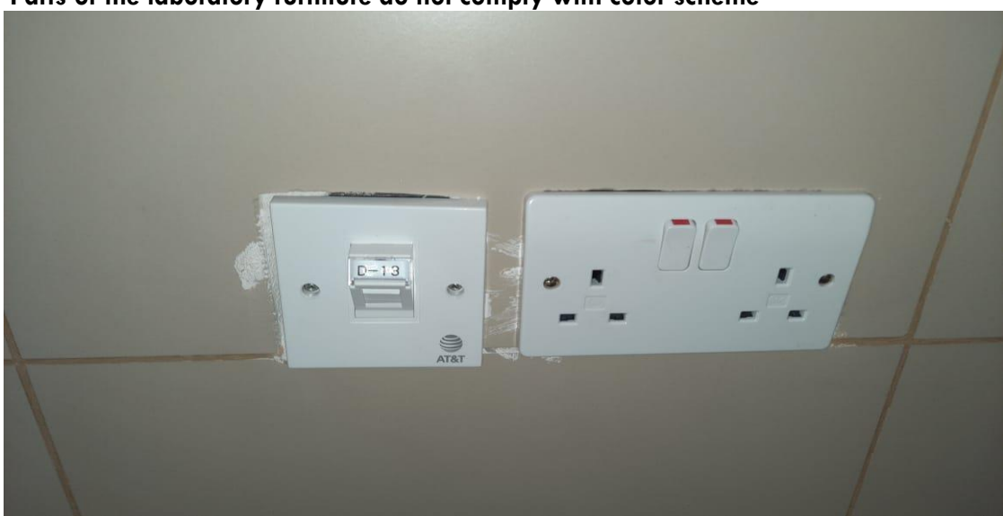
Defects in the finishing around the electrical sockets