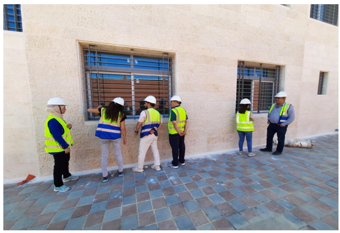
Parts of the steel protection screens are painted with different color