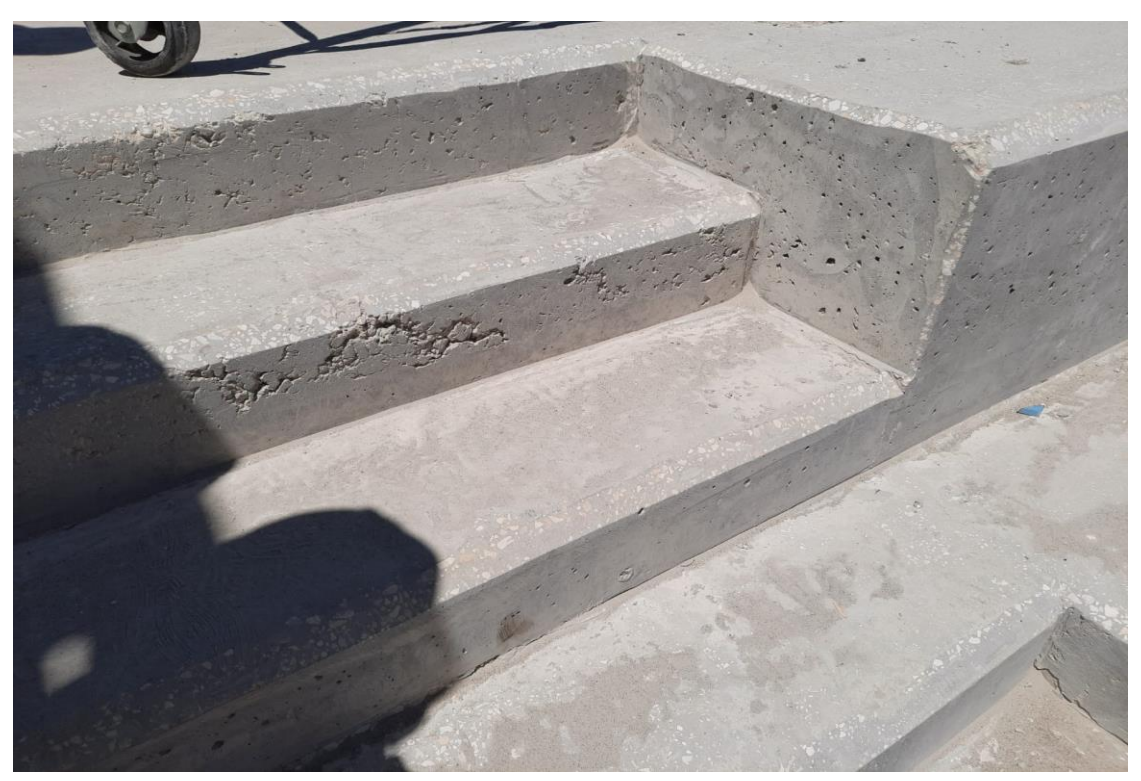
Voids in the casted concrete of the amphitheater