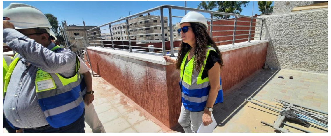
Dirt at the colored plastering