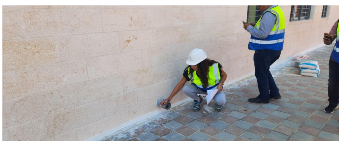
Protrusion of rainwater drainage pipe is more than required