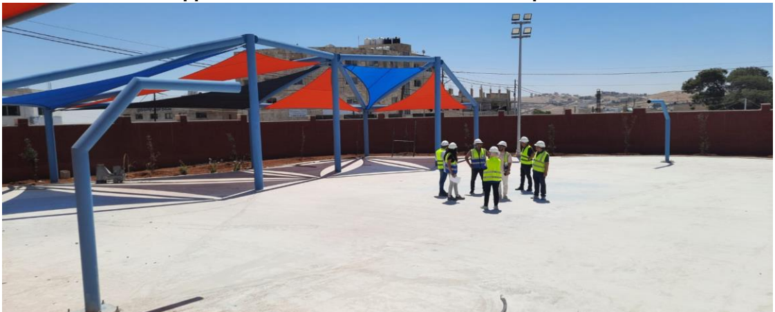
The fabric of the shading does not cover the whole area