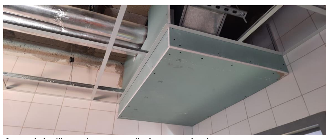
Suspended ceiling at the women toilet has wrong level