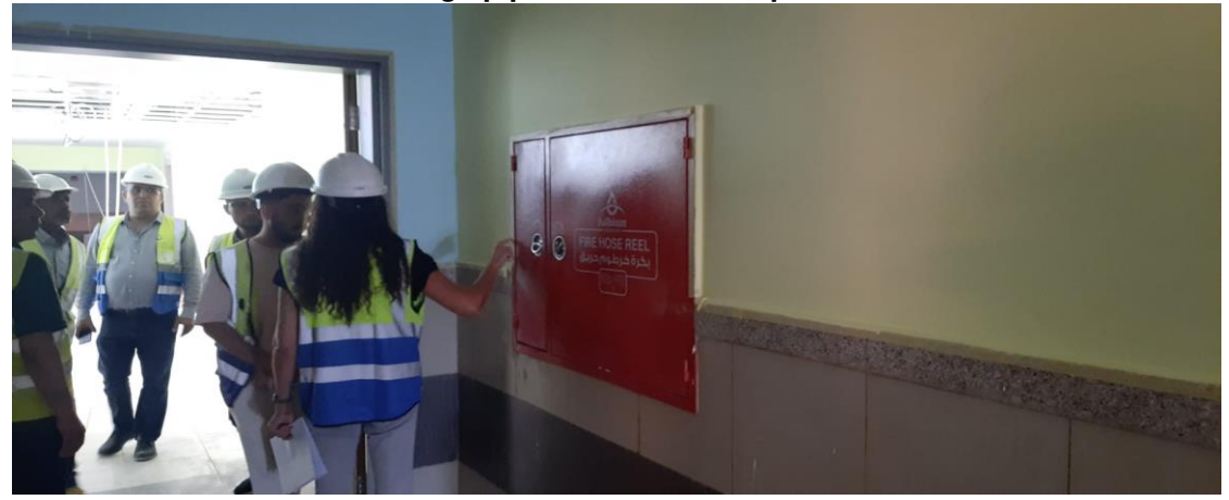
Finishing around fire hose cabinets is not finished as agreed upon previously