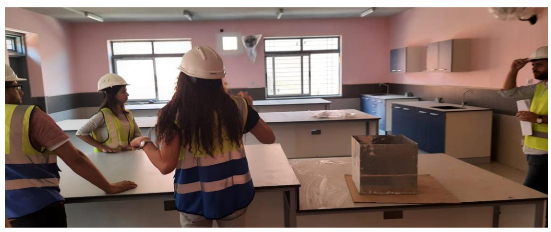
Parts of the laboratory furniture do not comply with color scheme