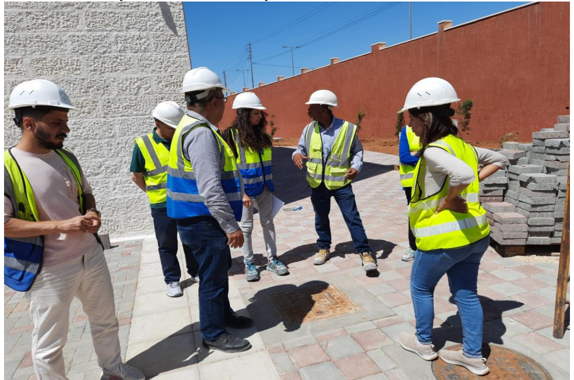
Manholes covers need cleaning from corrosion, and paint