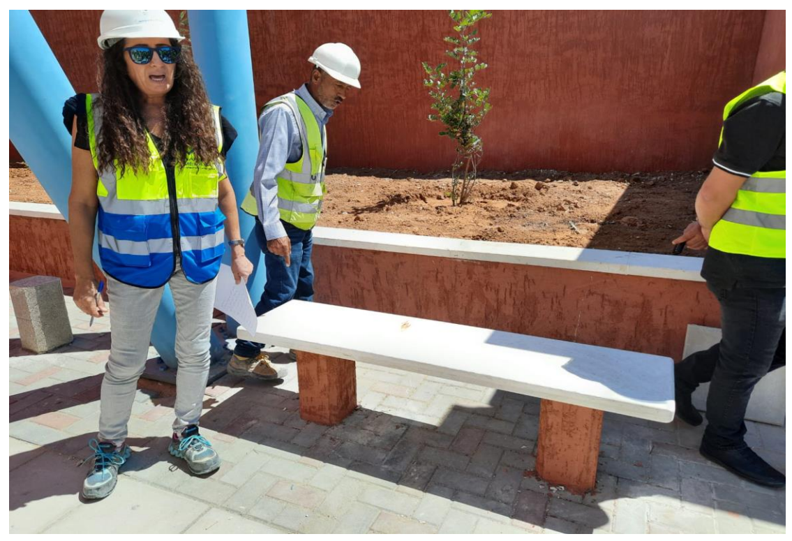
External benches supports not colored and the stone is one piece not two