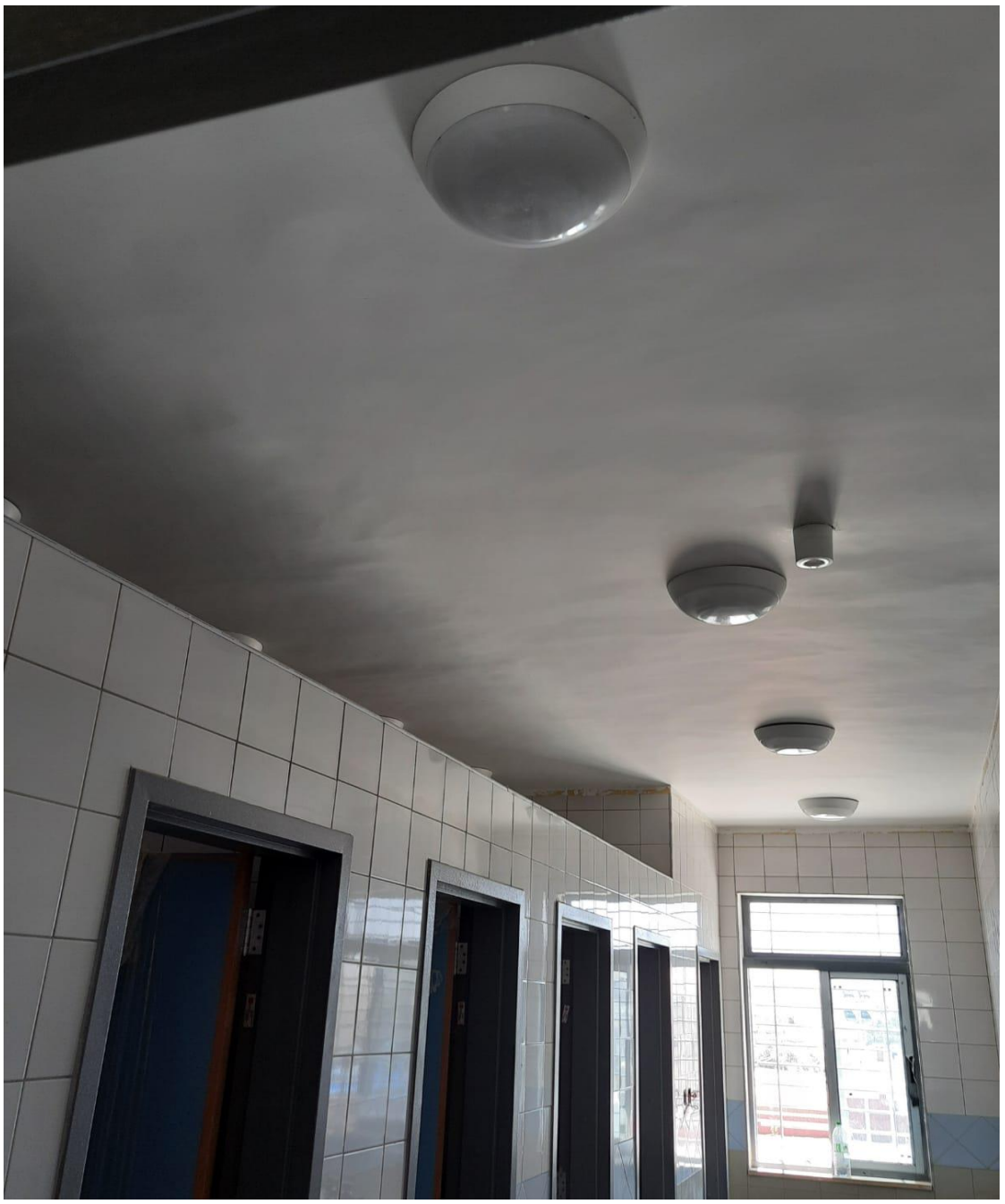
Waving in the plastering/painting of the ceilings of toilets