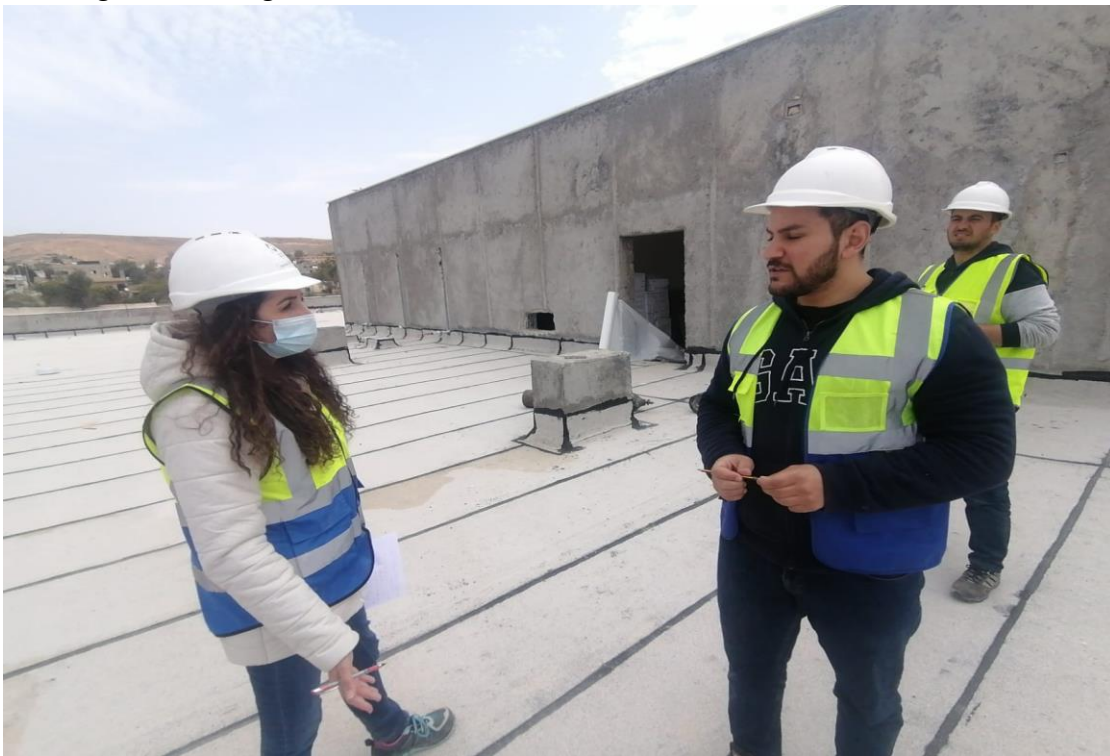
Defects in sheet waterproofing