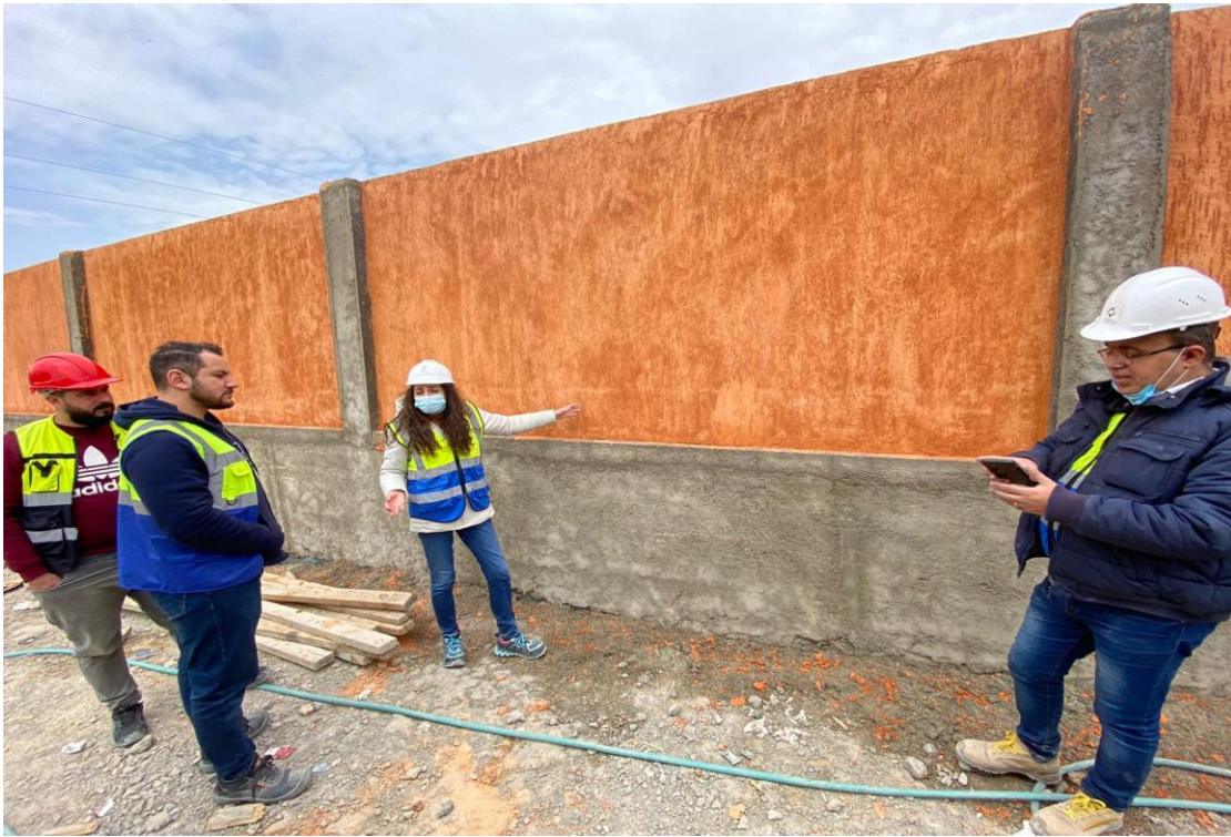
Defects in color plastering for boundary walls