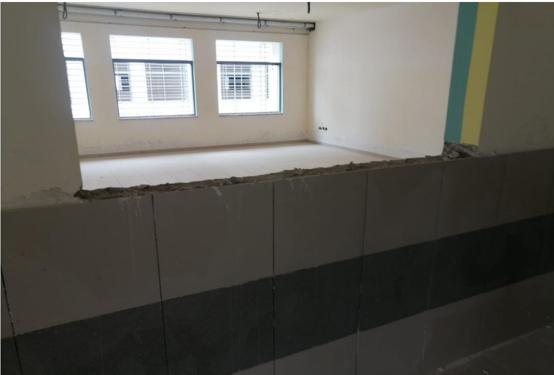
Removal of defected window sill