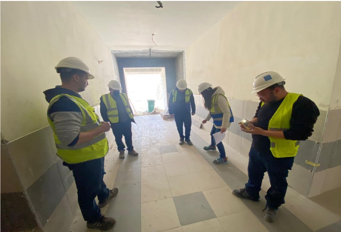
Teething in porcelian floor tiles