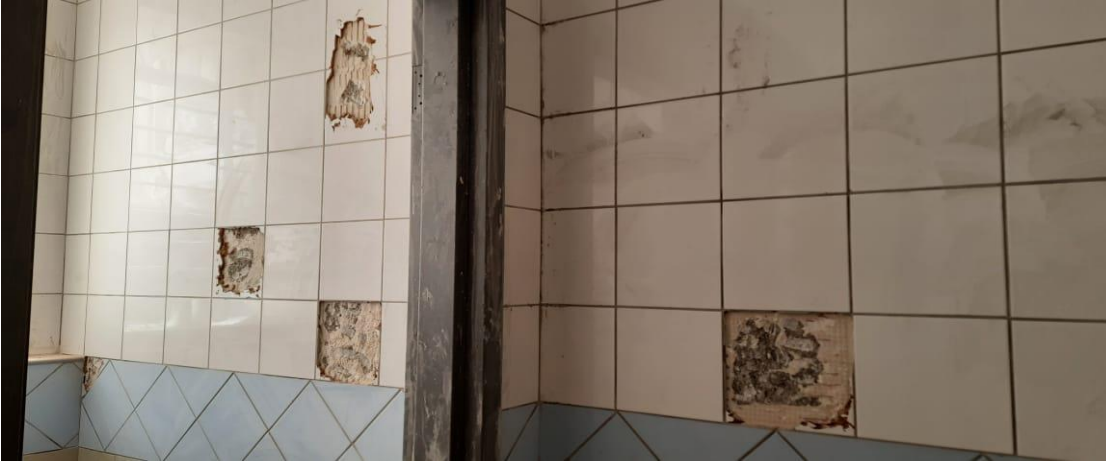
Removal of defected wall tiles