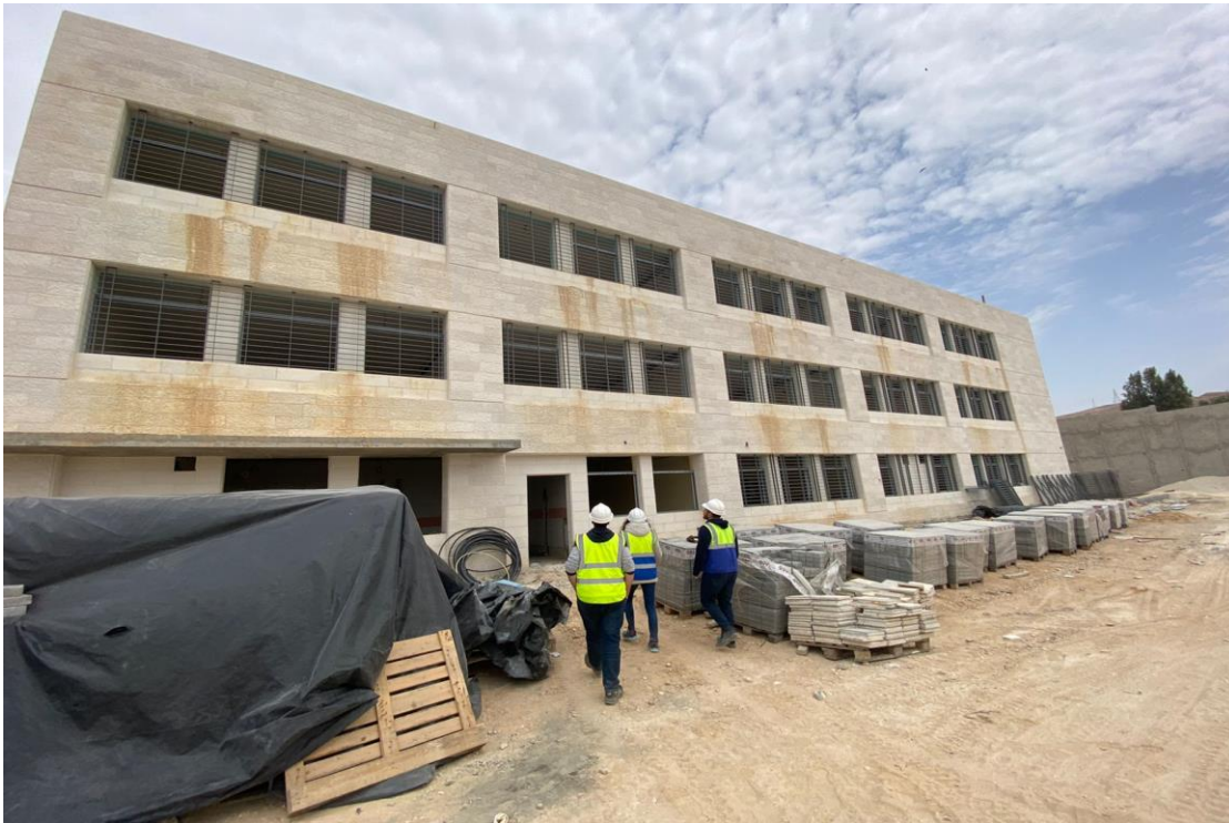
Stone facades need cleaning