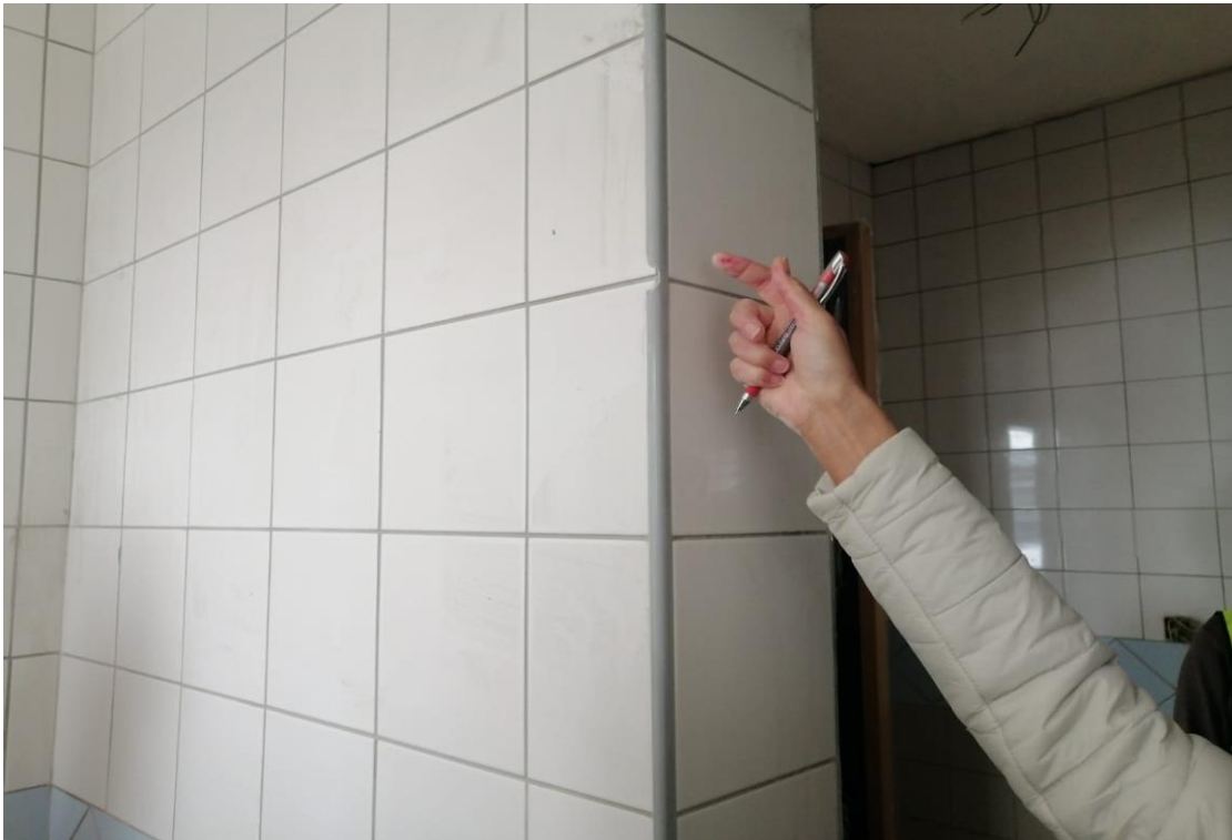
Broken tile beads