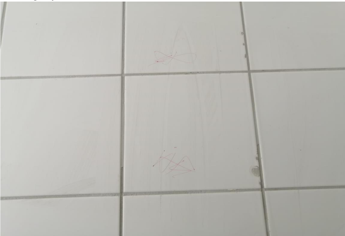
Broken ceramic wall tiles