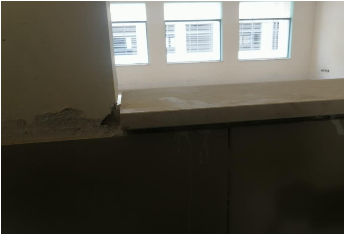
Shortage in the length of window sill