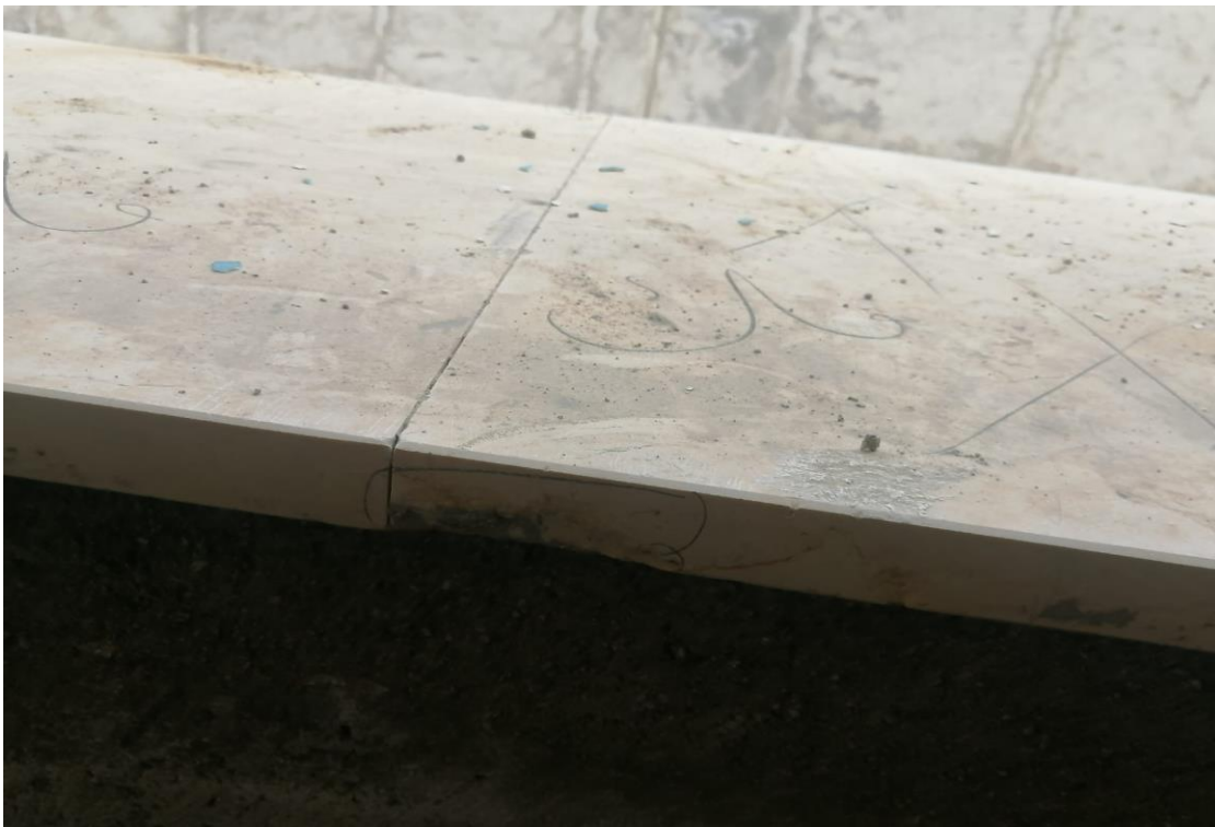
Broken window sill