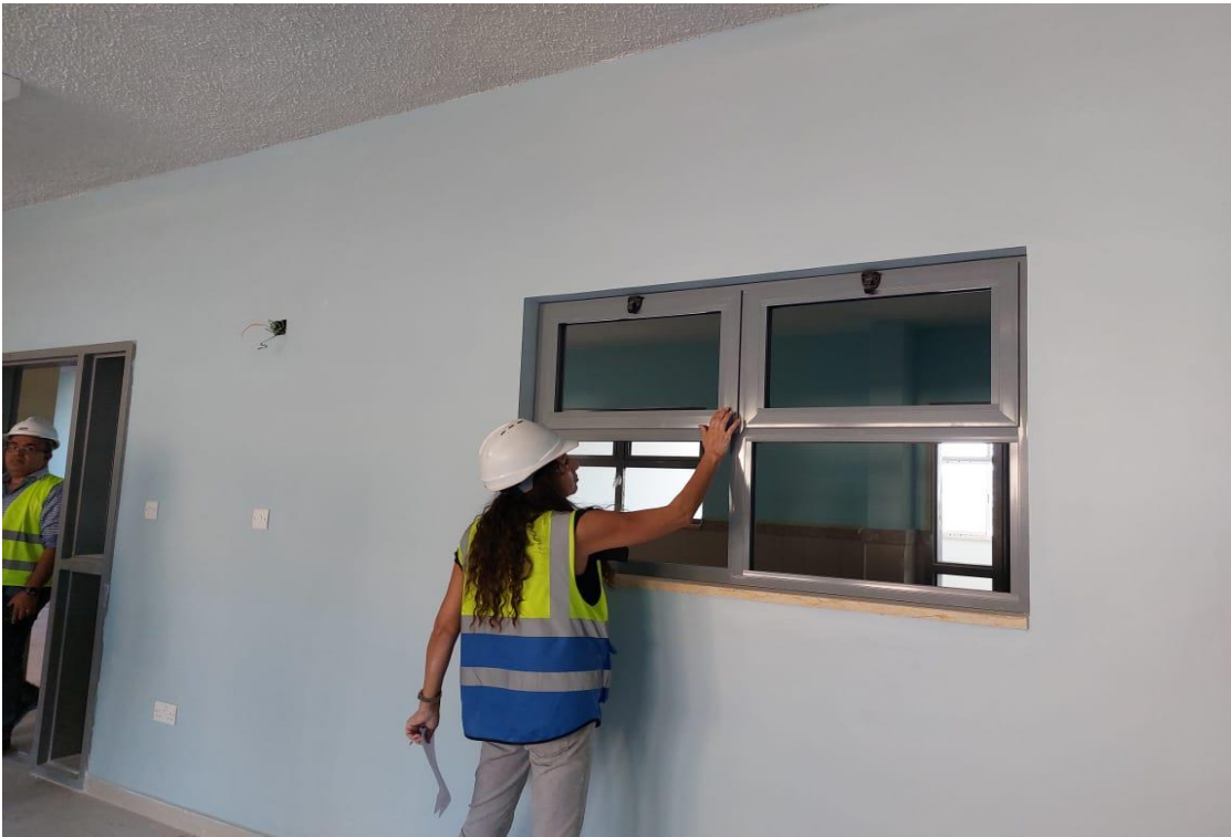
Sharp edges in aluminum window