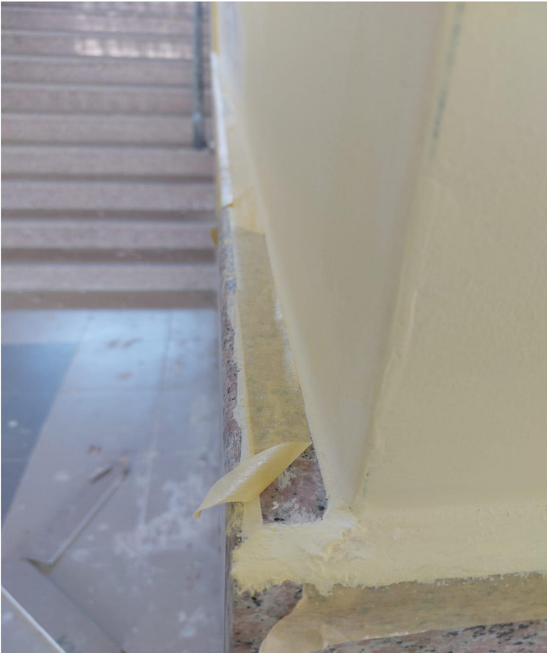
Repair of coping defects