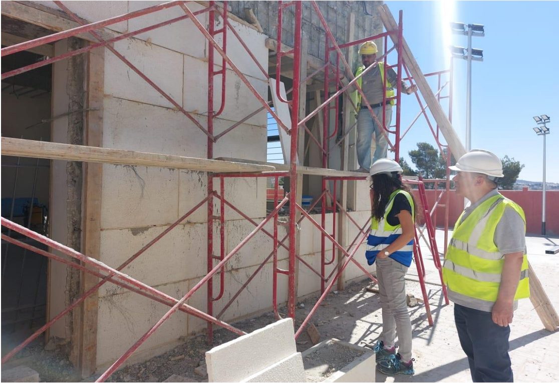
Re-building of stone façade