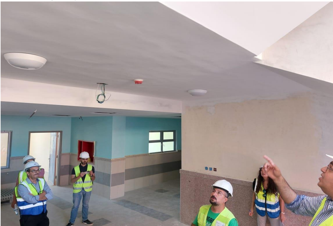
Waving in ceiling