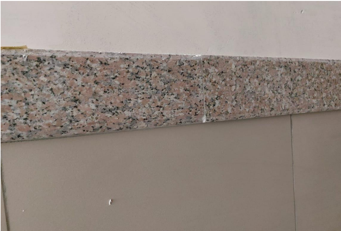
Broken edges of granite coping and defects in installation