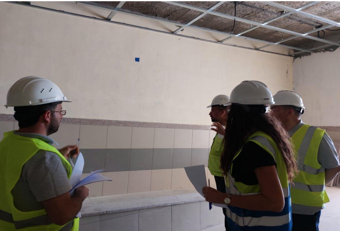
Walls at entrance/tiling not in accordance to drawing