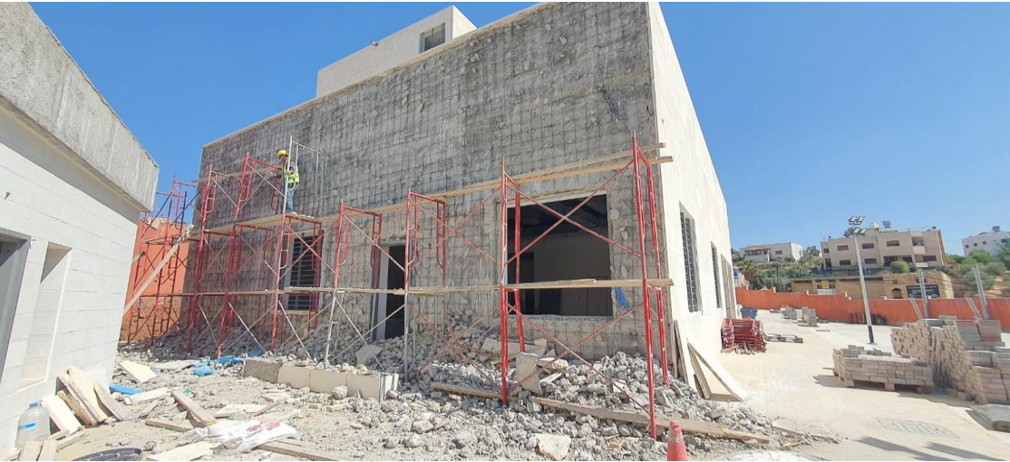
Removal of defected stones