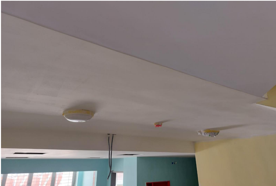
Repair of waving at ceiling