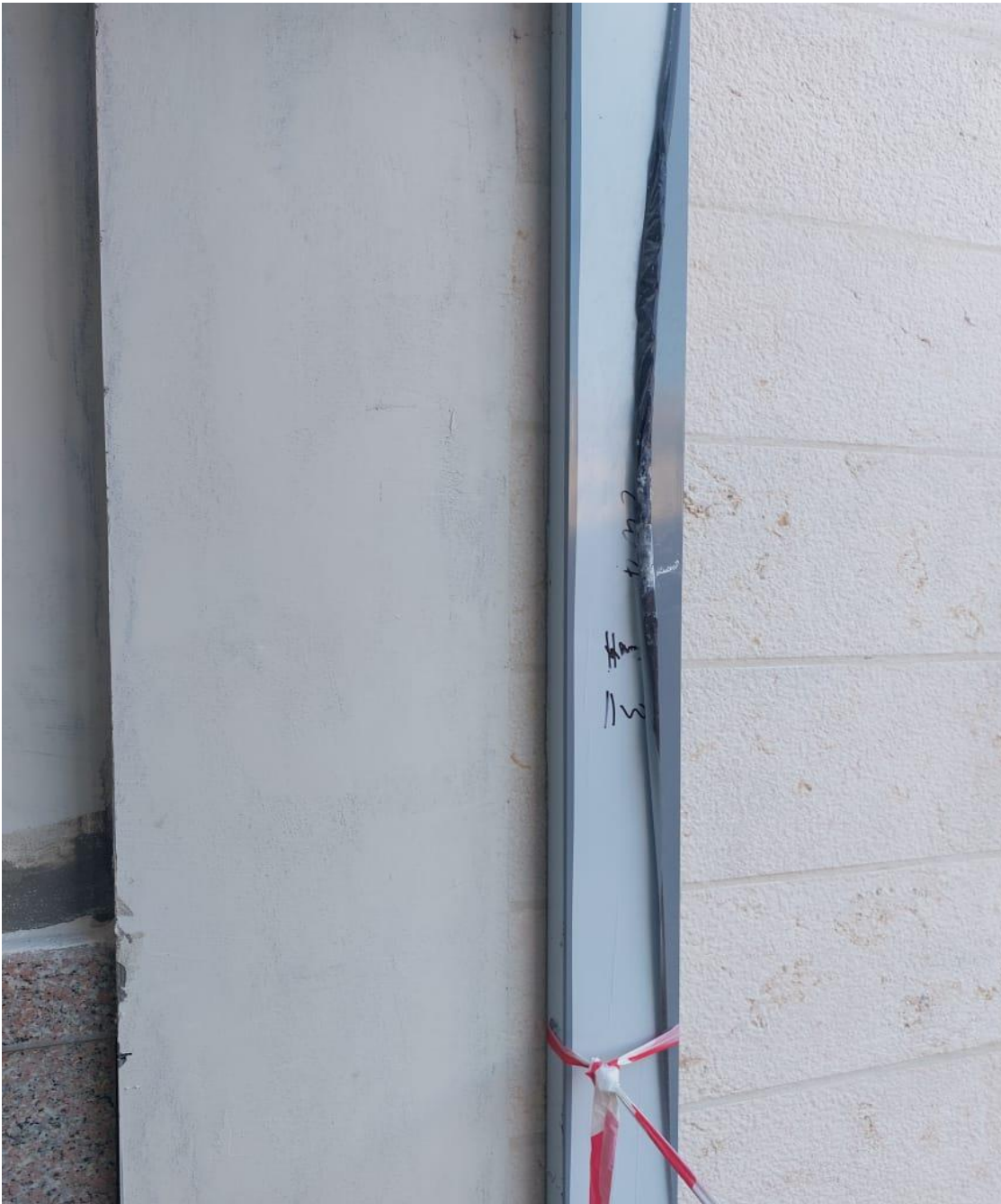
Defects in installation of curtain wall