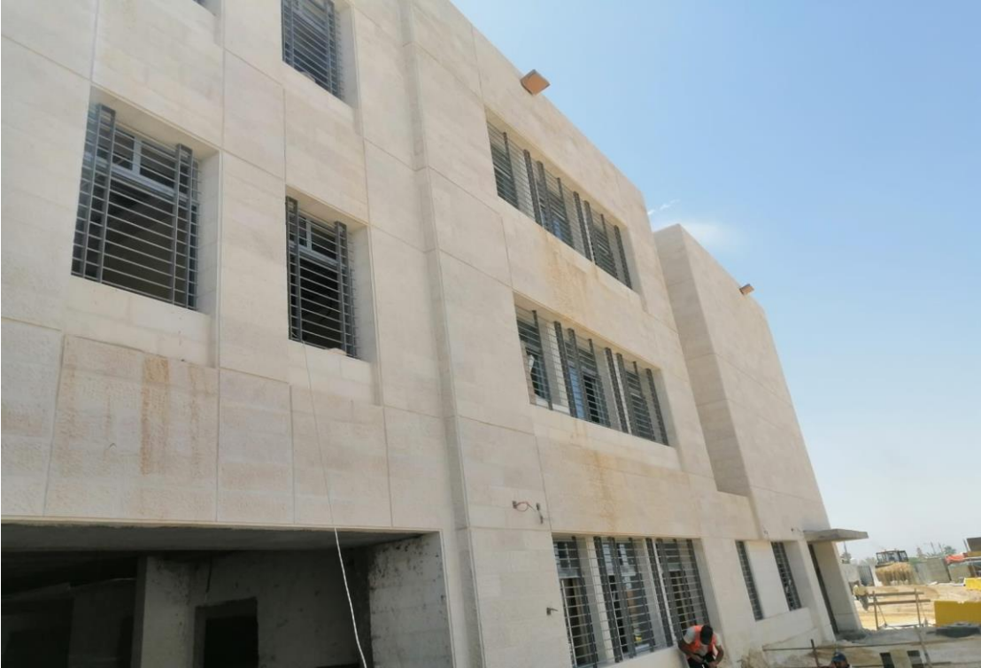
Stone facades need cleaning