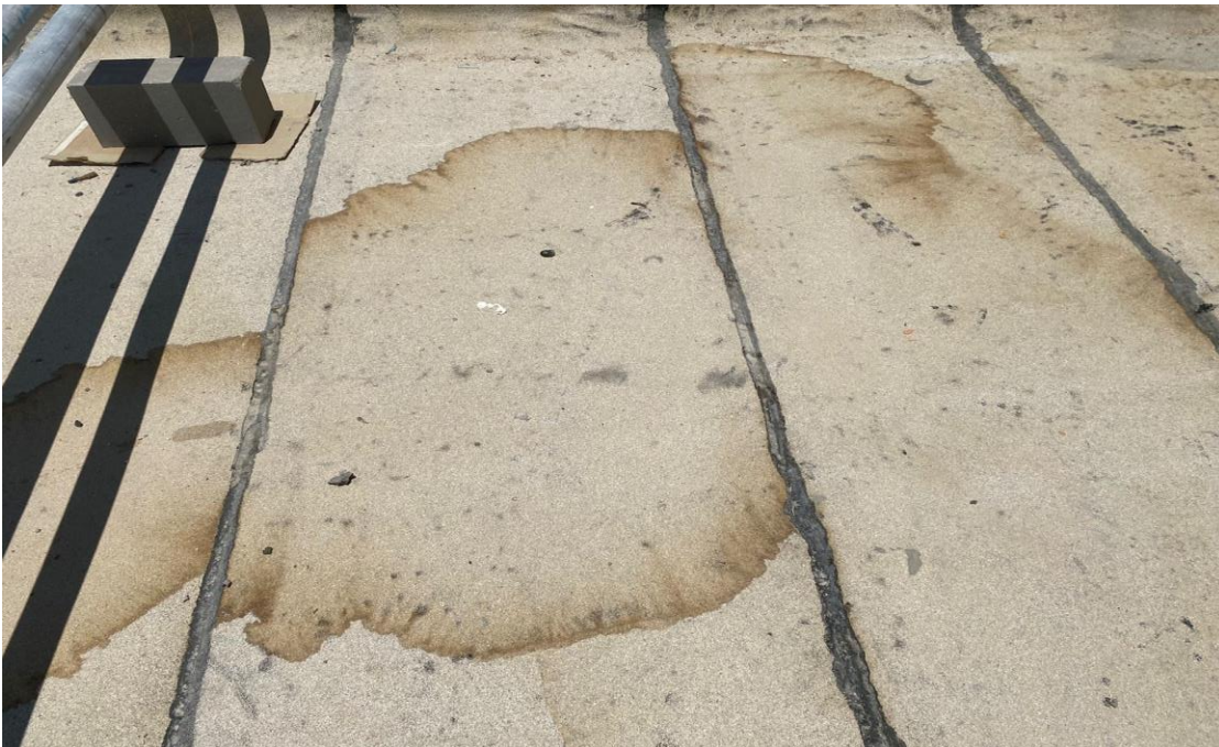
Air voids at the waterproofing membrane