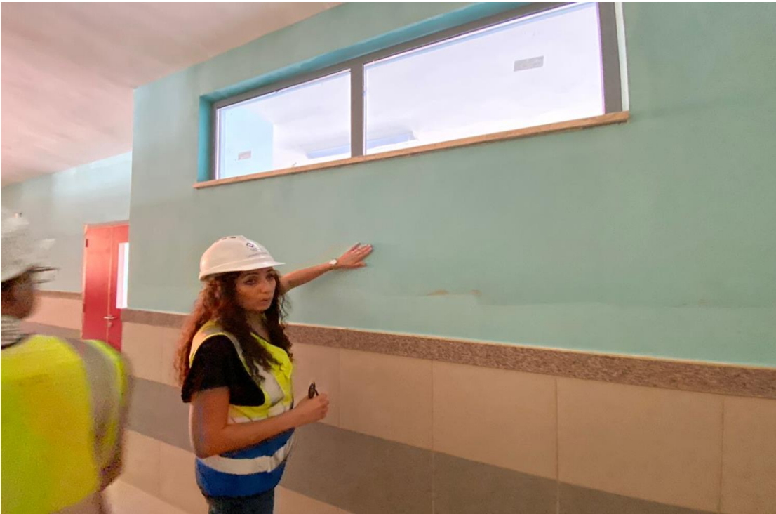
Waving in plastering at walls