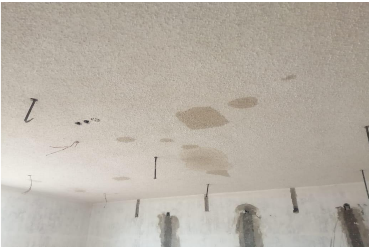
Water penetration due to defects in the waterproofing