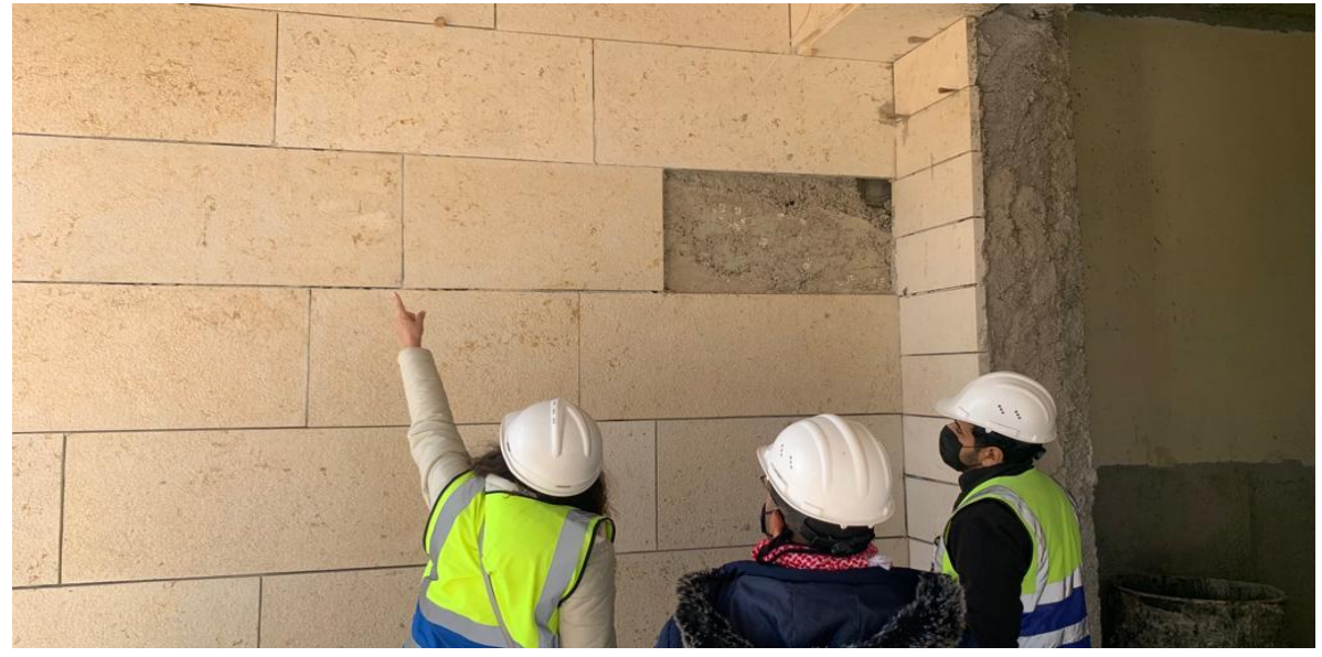
Defected stones at the facades