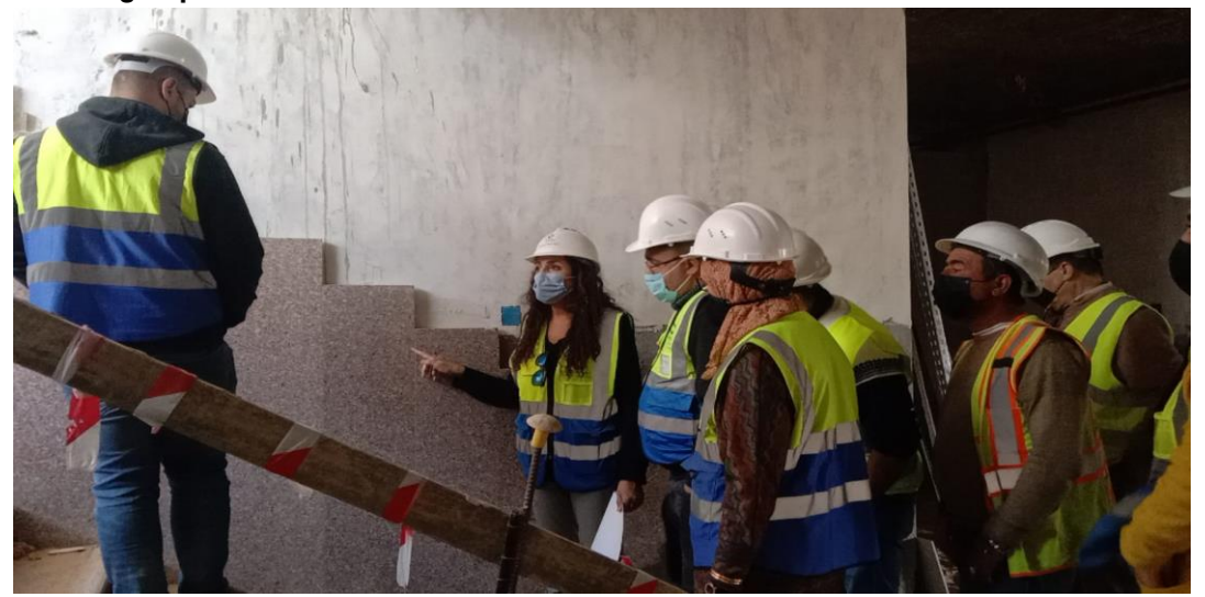
Defects in granite cladding for staircase