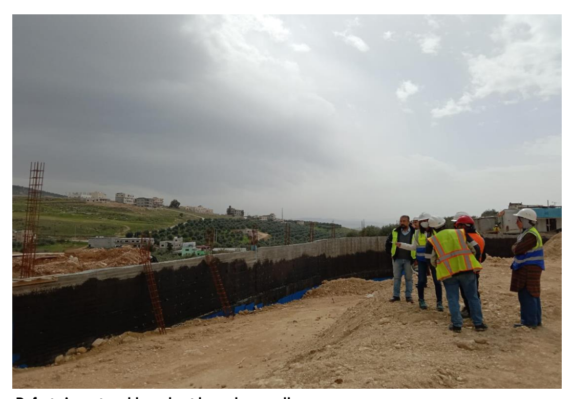
Defects in cartonal boards at boundary walls