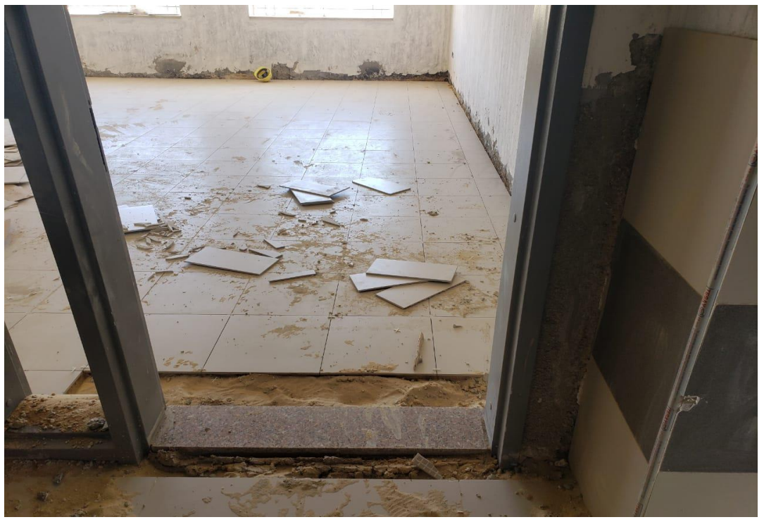
Replacing of defected threshold