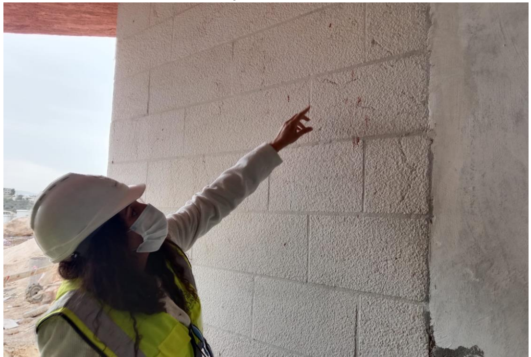
Defects in built stones at the entrance