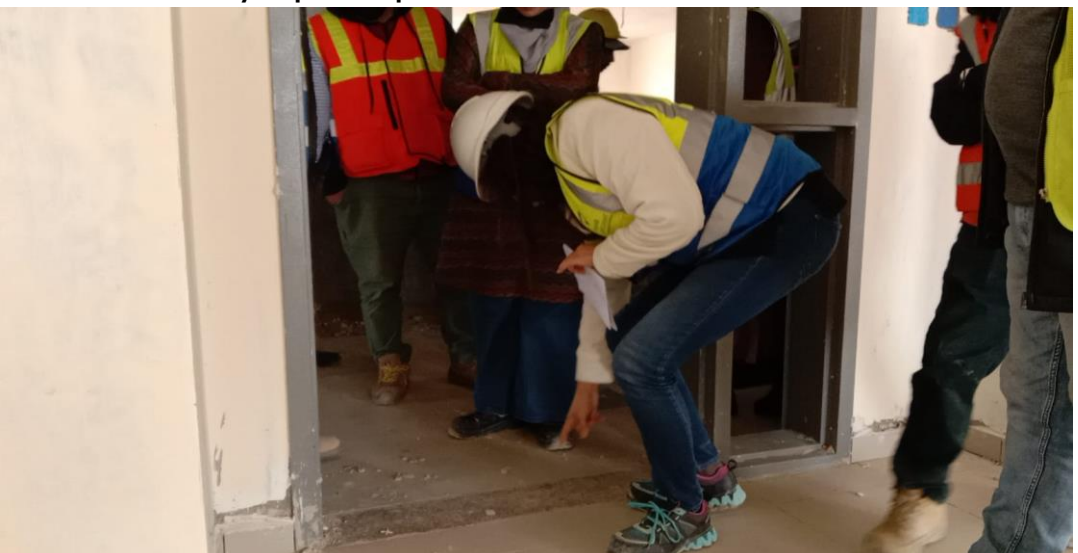
Broken and unlevelled threshold