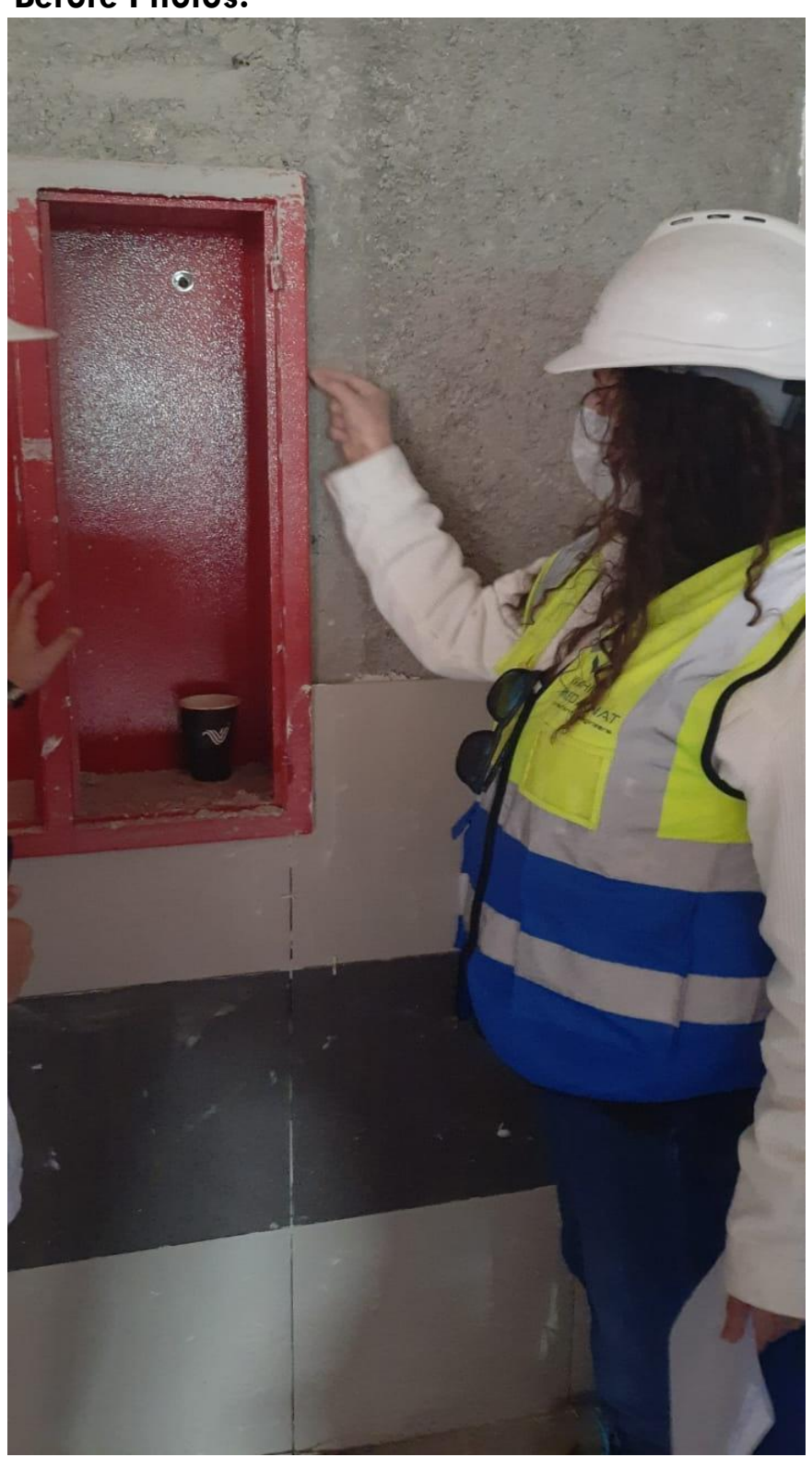
Defects in fire hose cabinet