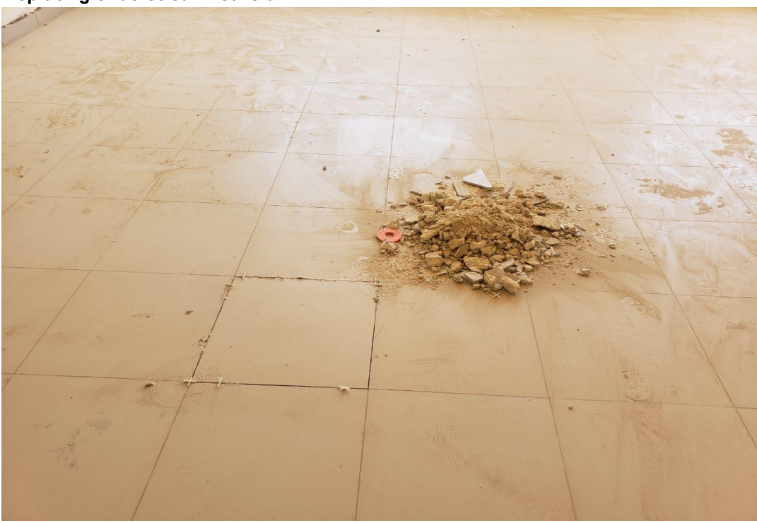
Replacing of defected floor tiles