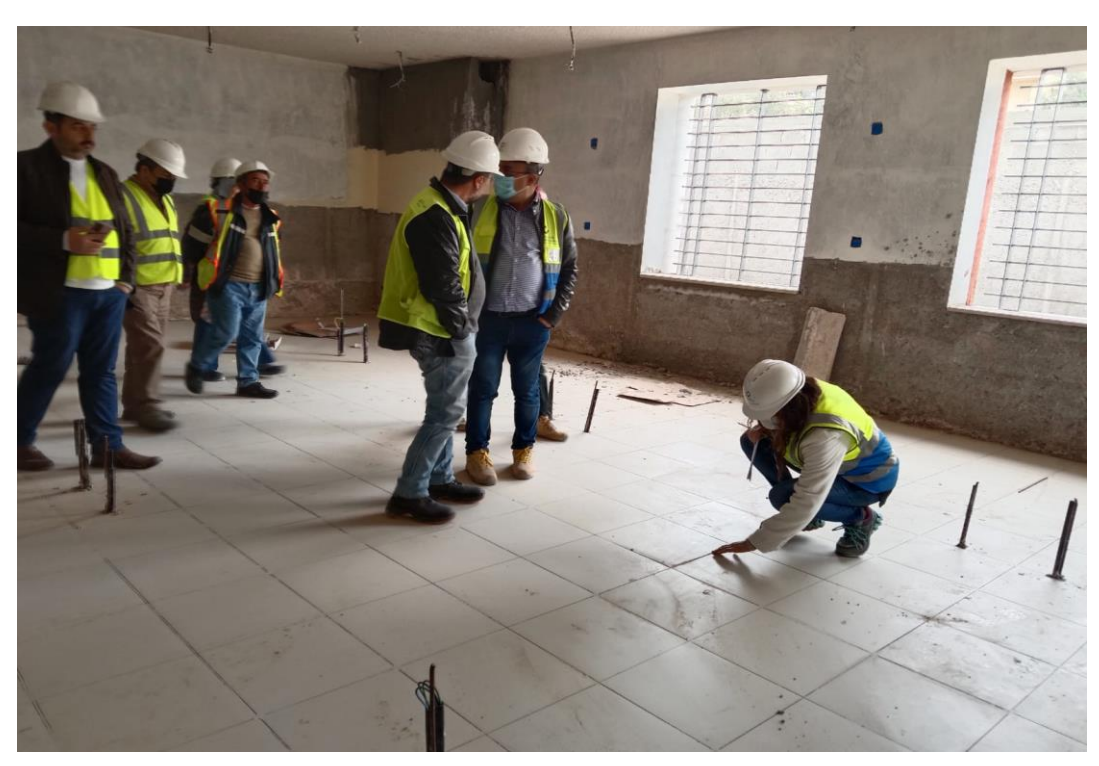
Teething in porcelain floor tiles