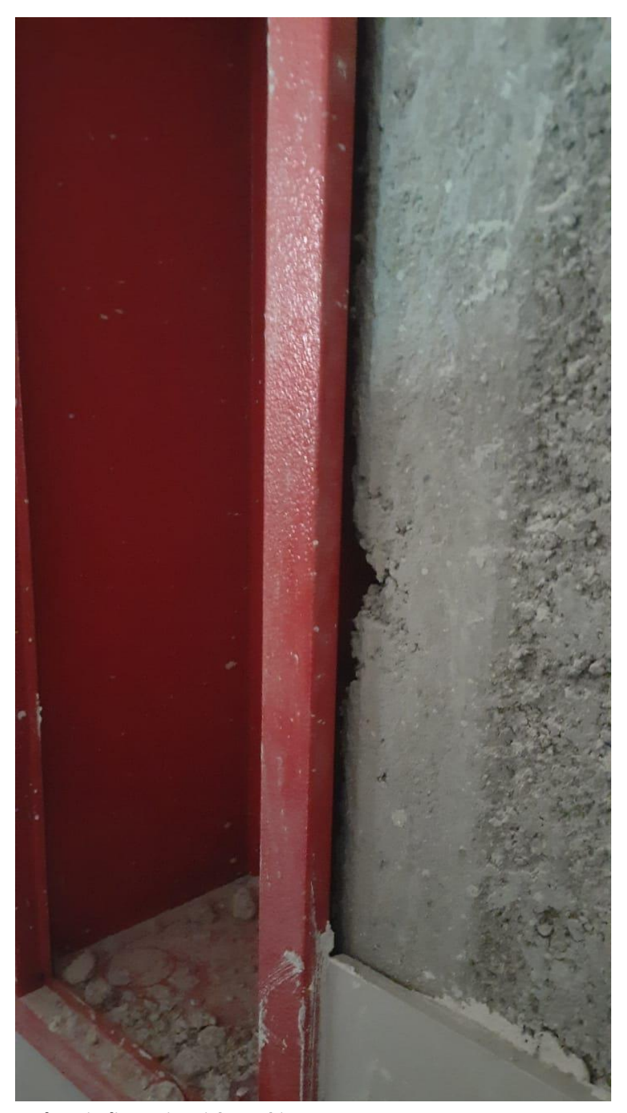
Defects in fire extinguisher cabinet