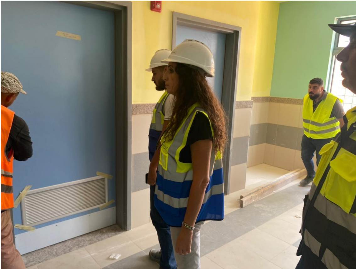
Marking fixing wooden doors accessories