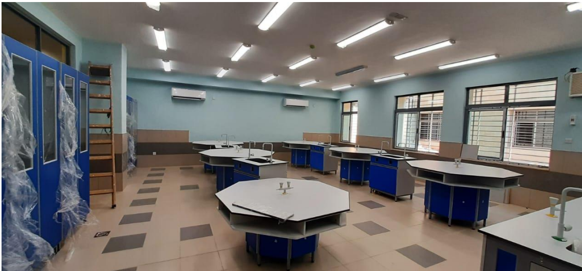
(Figure: 13 & 14)

The team observed the installation of furniture at the laboratories, teacher center and the classrooms