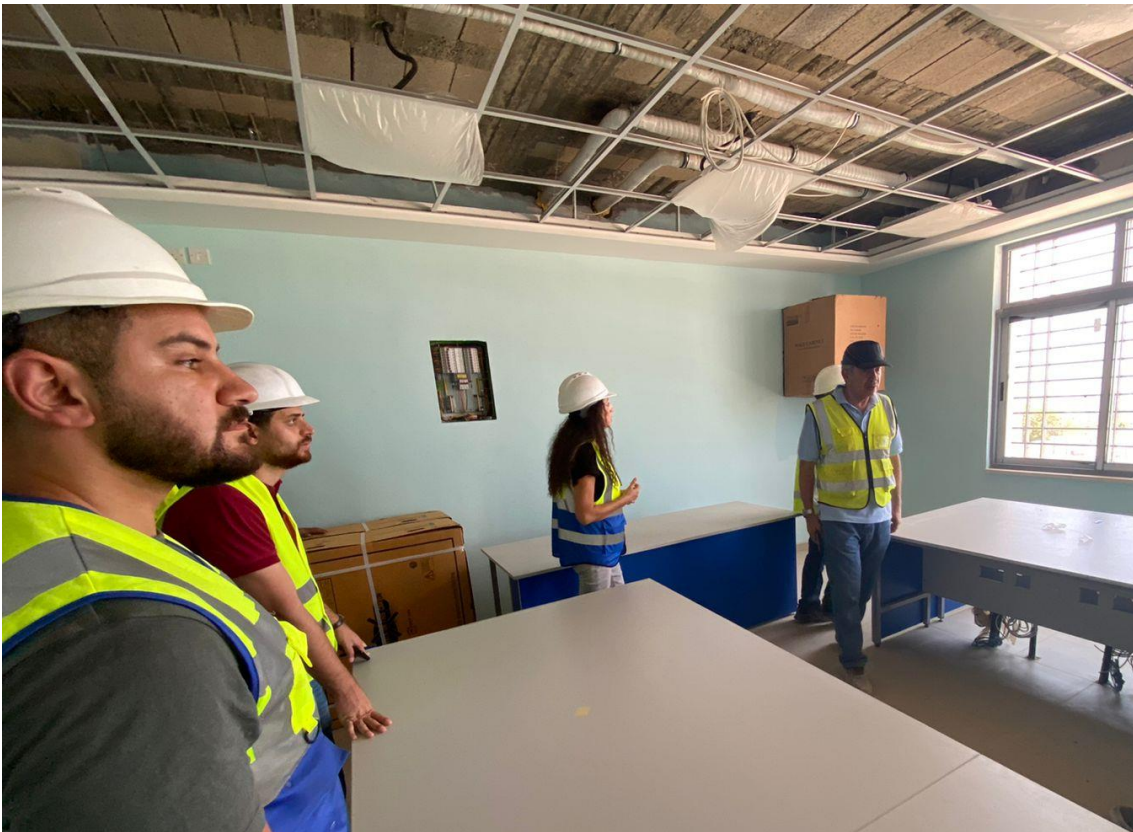
Viewing the progress in the suspended ceiling works