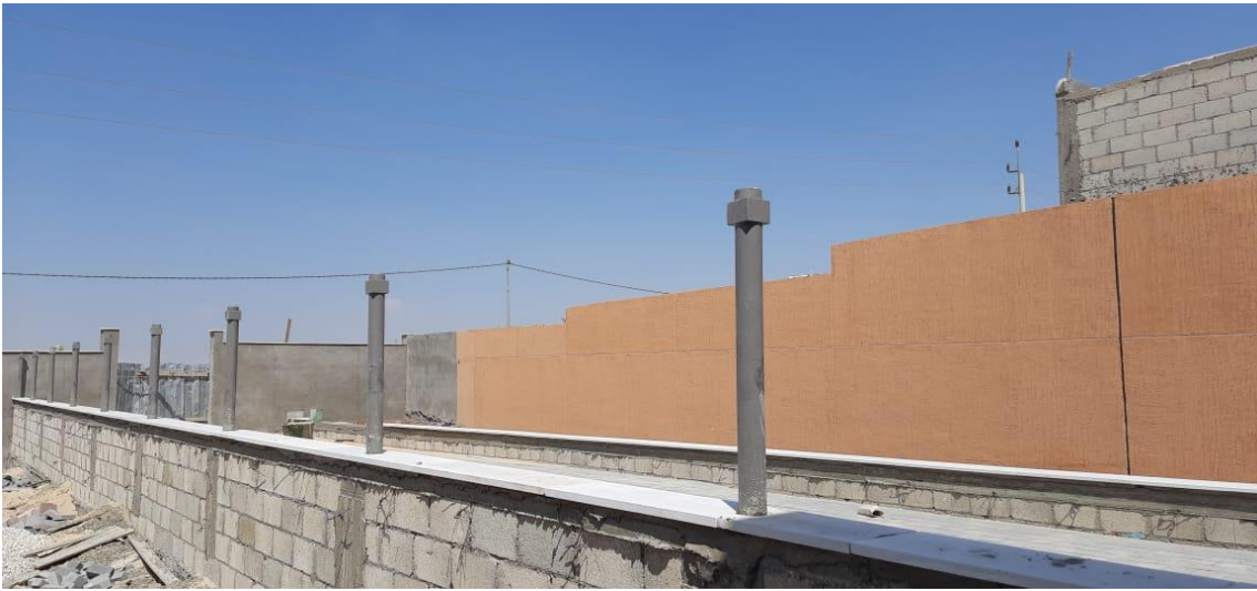
(Figure: 08 & 09)

The team discussed the stone coping at the external yards