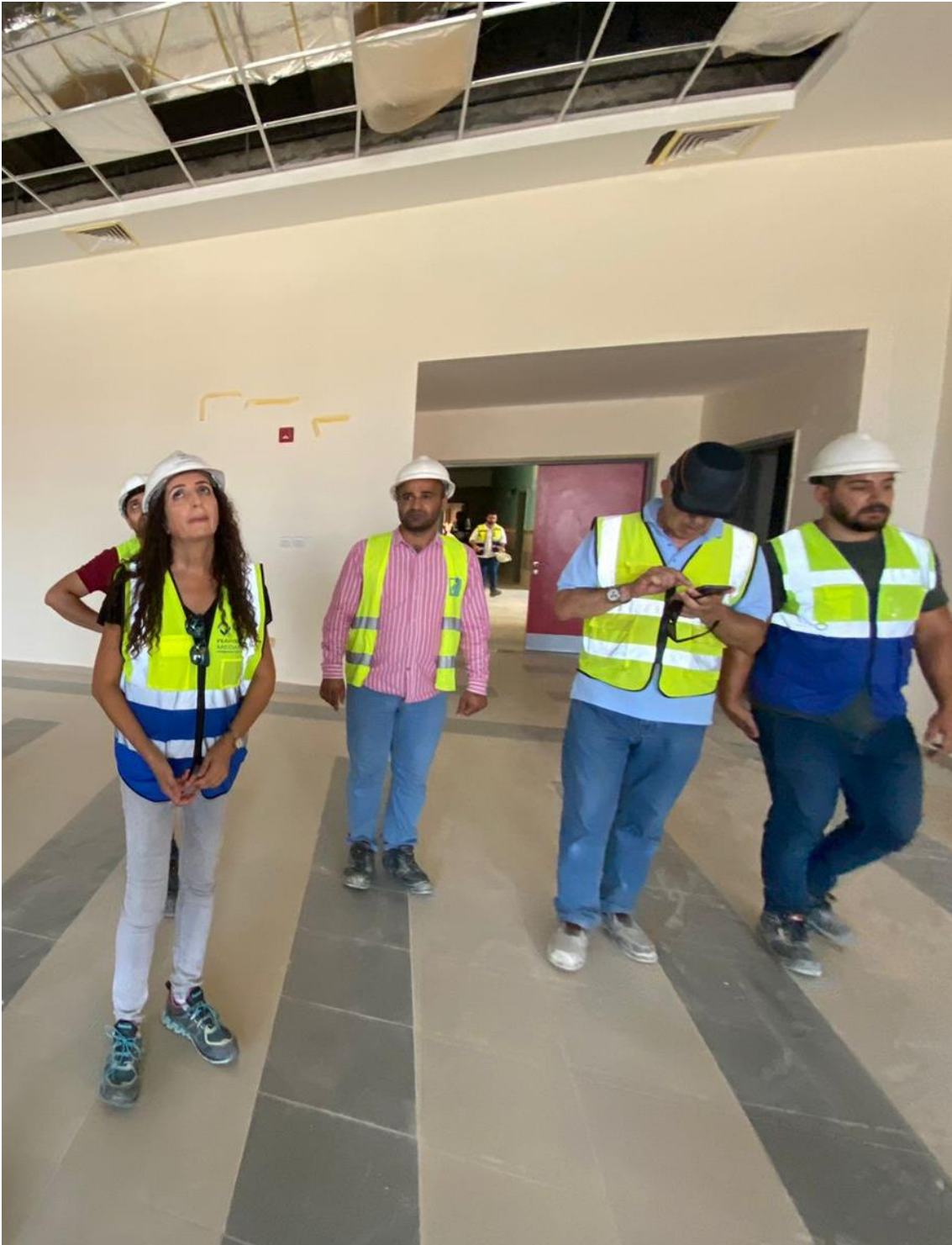
Duct work and floor tiling at the multi-purpose hall