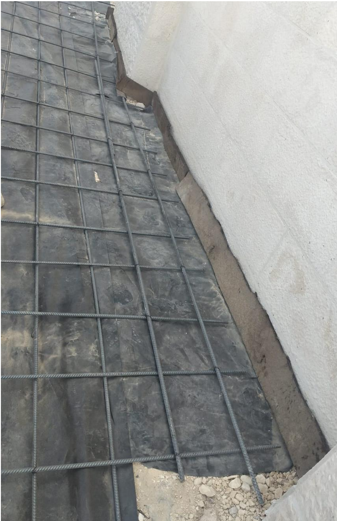
Steel reinforcement for the ramp