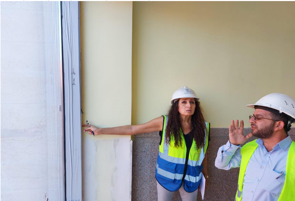
Curtain wall is installed completely at the stone