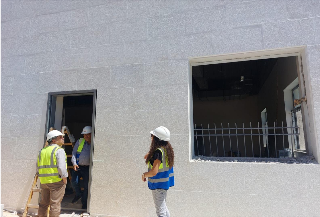
Teething in the built stone at the front façade