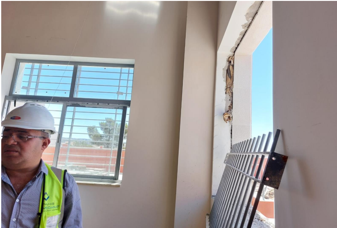
Using empty cement bags in the window jamb of the multi-purpose hall