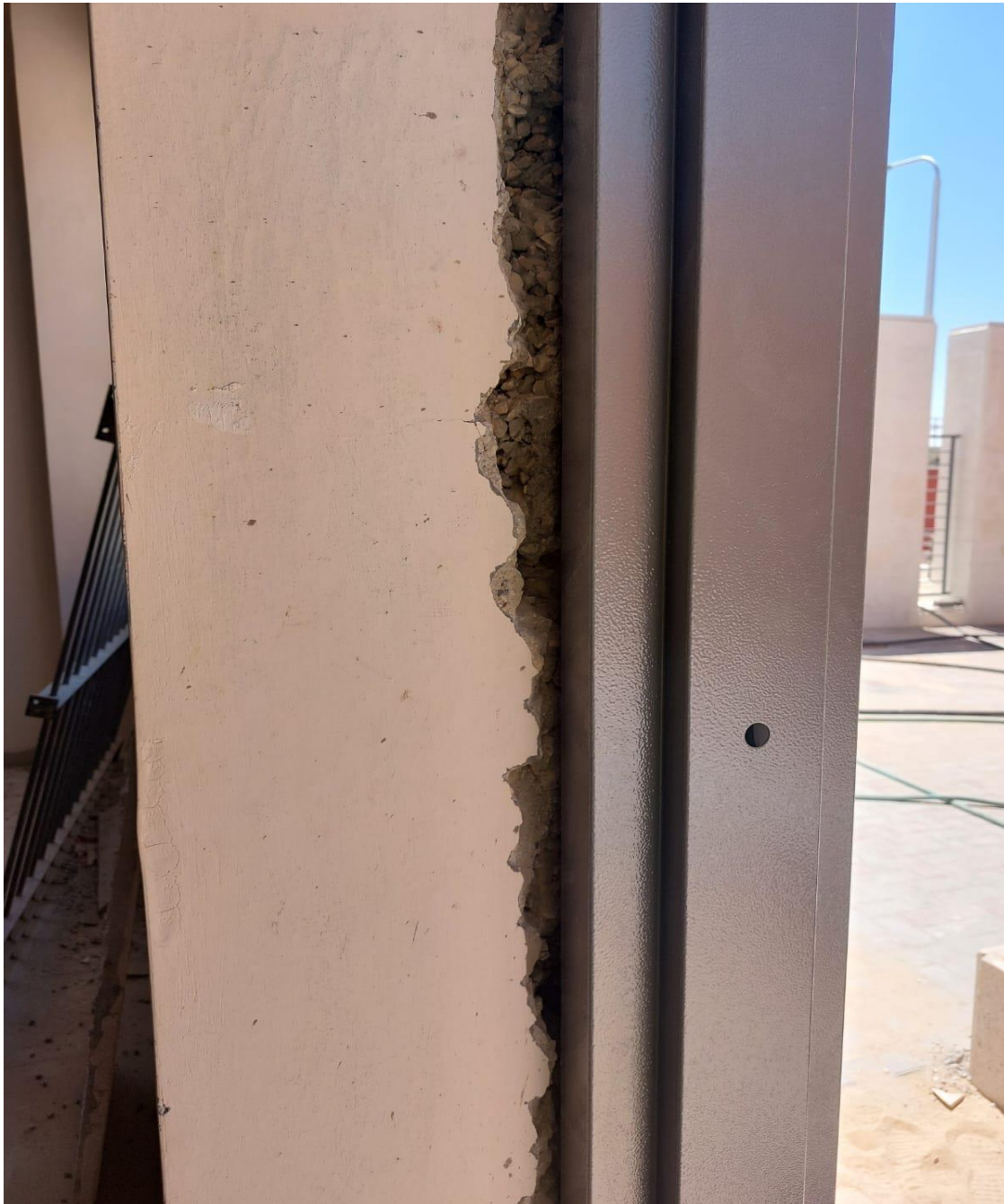
Incorrect finish for the door jamb of the multi-purpose hall