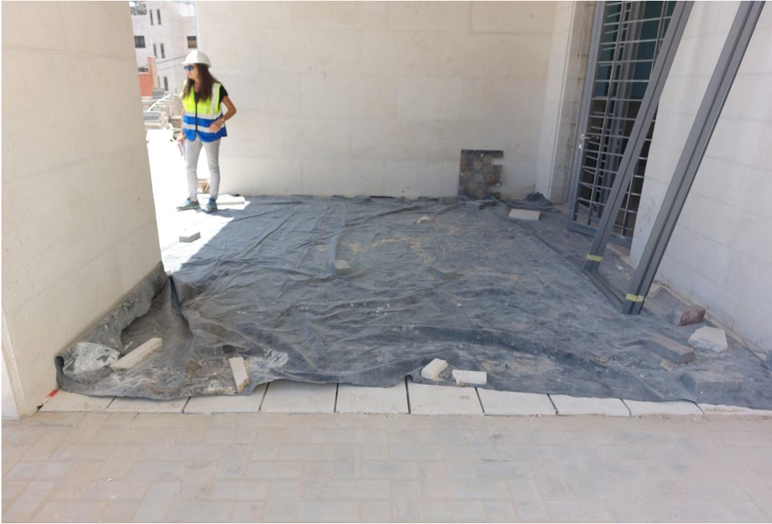
Defects in the level of the stone tiling at the entrance