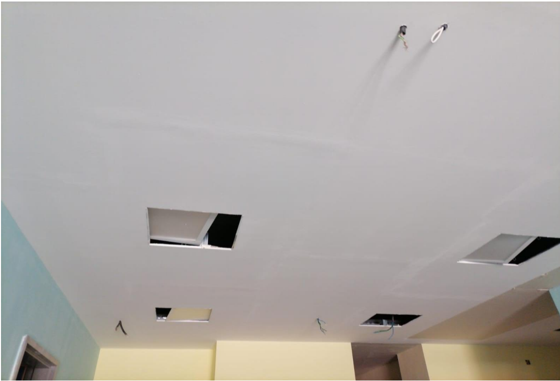
Waving in the painting of the suspended ceilings