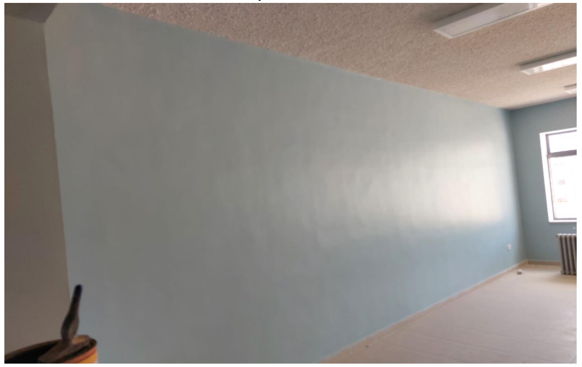
Waving in plastering