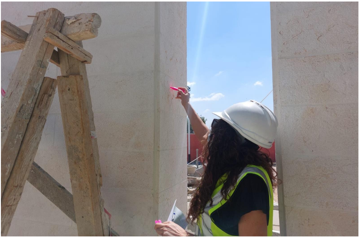
Defects in the built stones