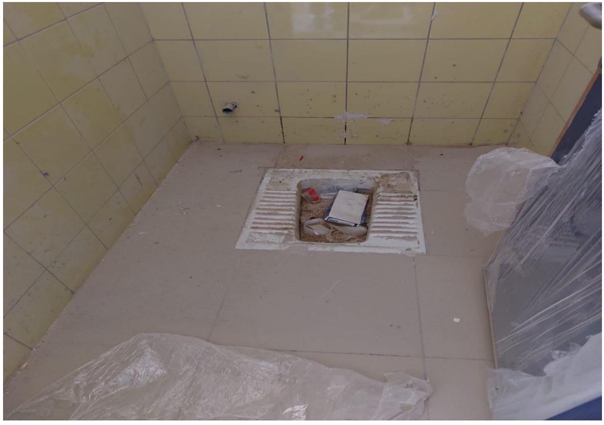
Accumulated debris and dirt at the sanitary fixtures