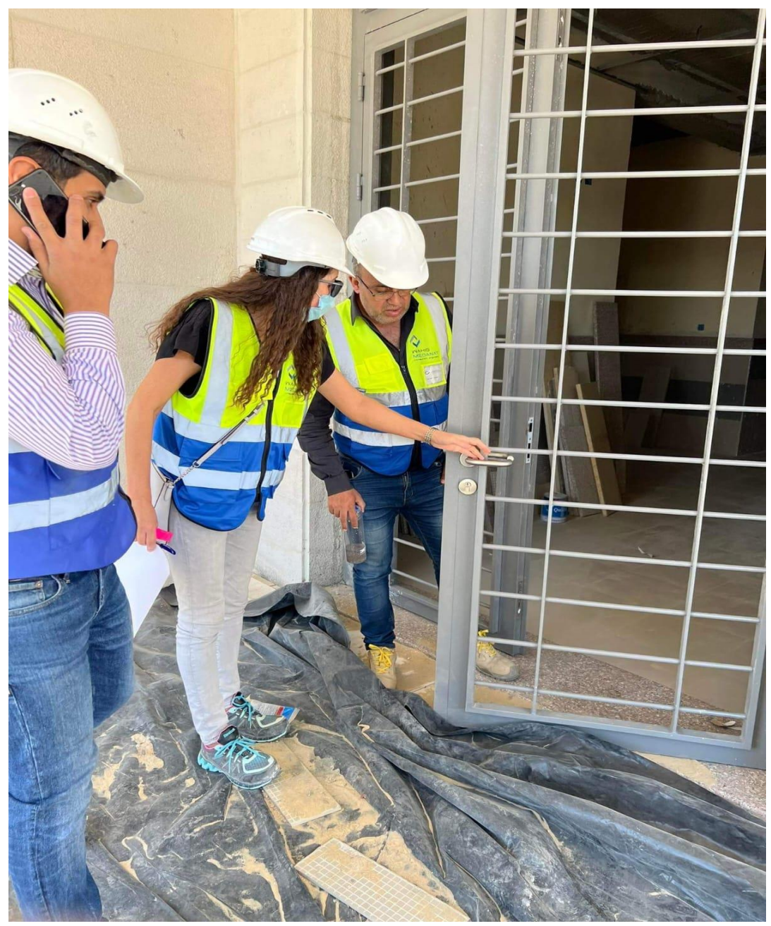
Defects in the main steel doors