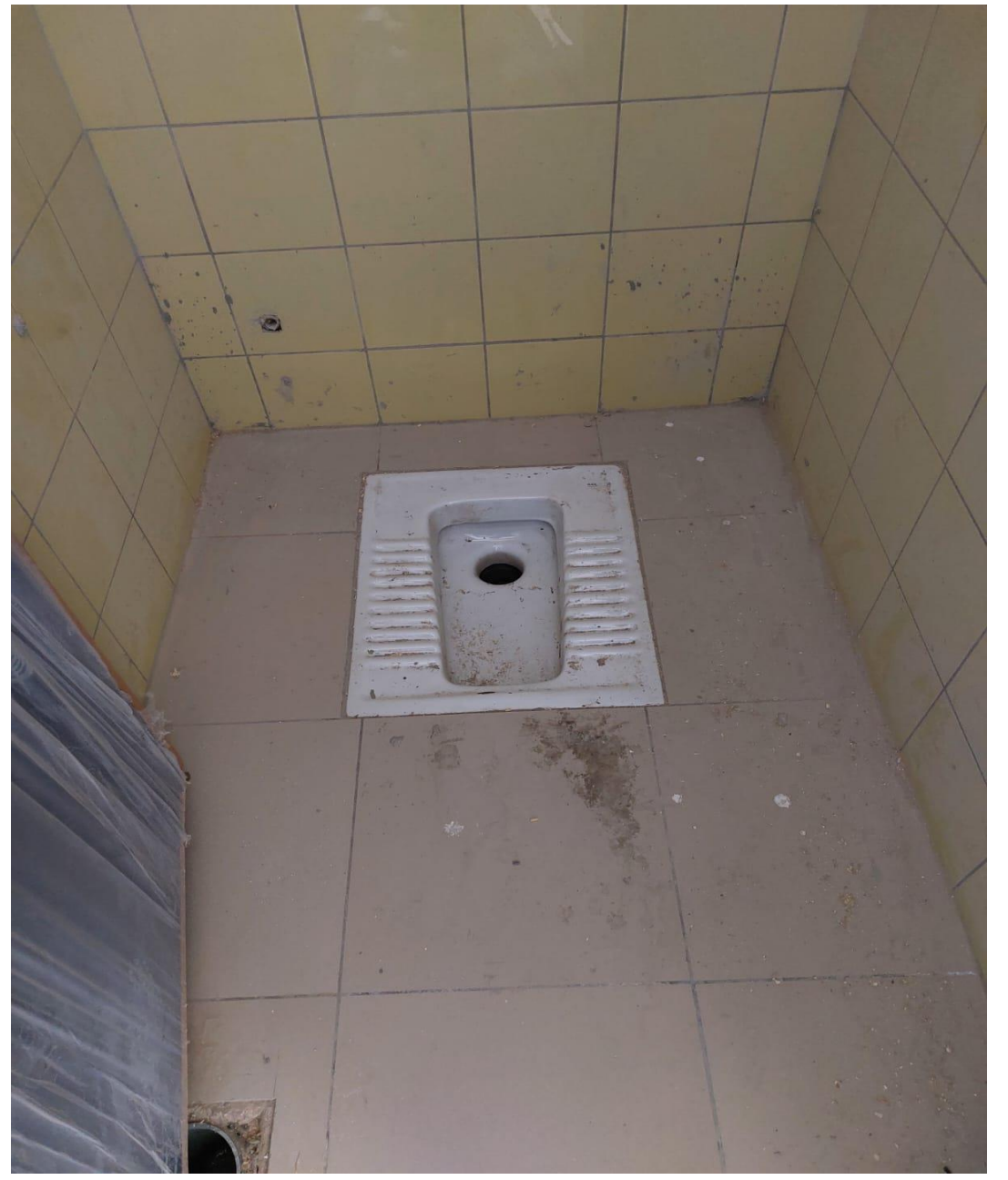
Removal of debris and dirt from sanitary fixtures