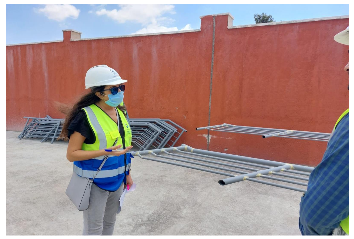
Defects in the handrails and dirt at the boundary walls