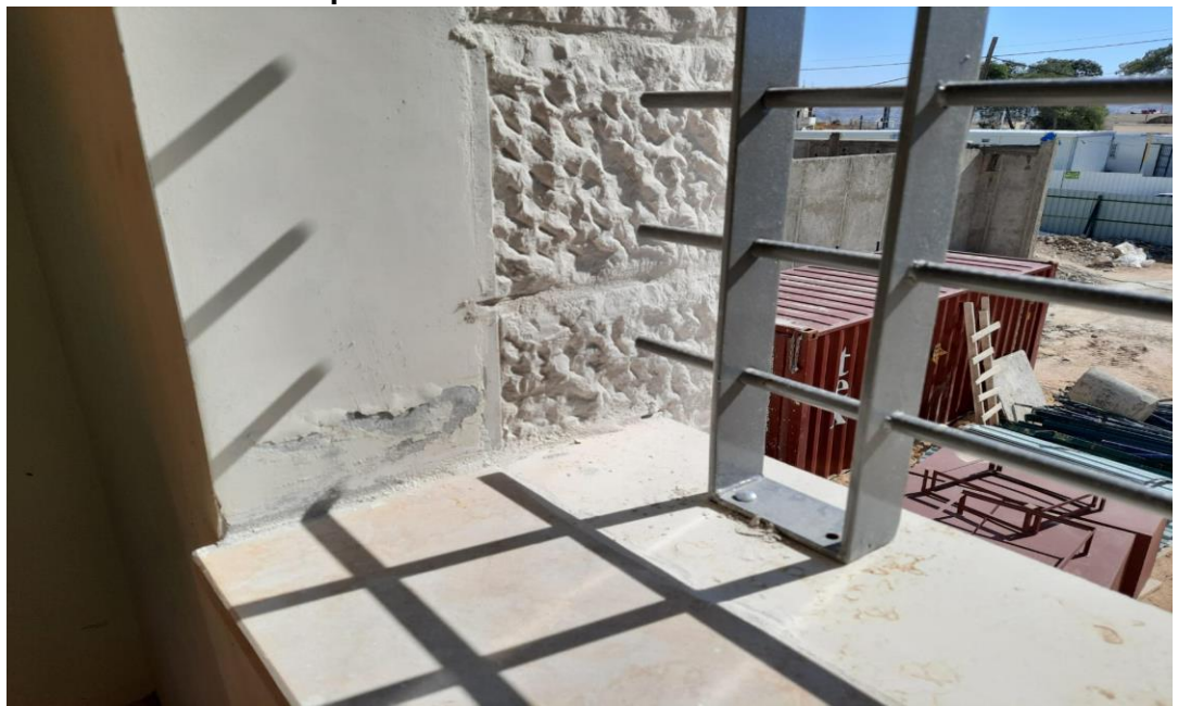
Defect at the window jamb