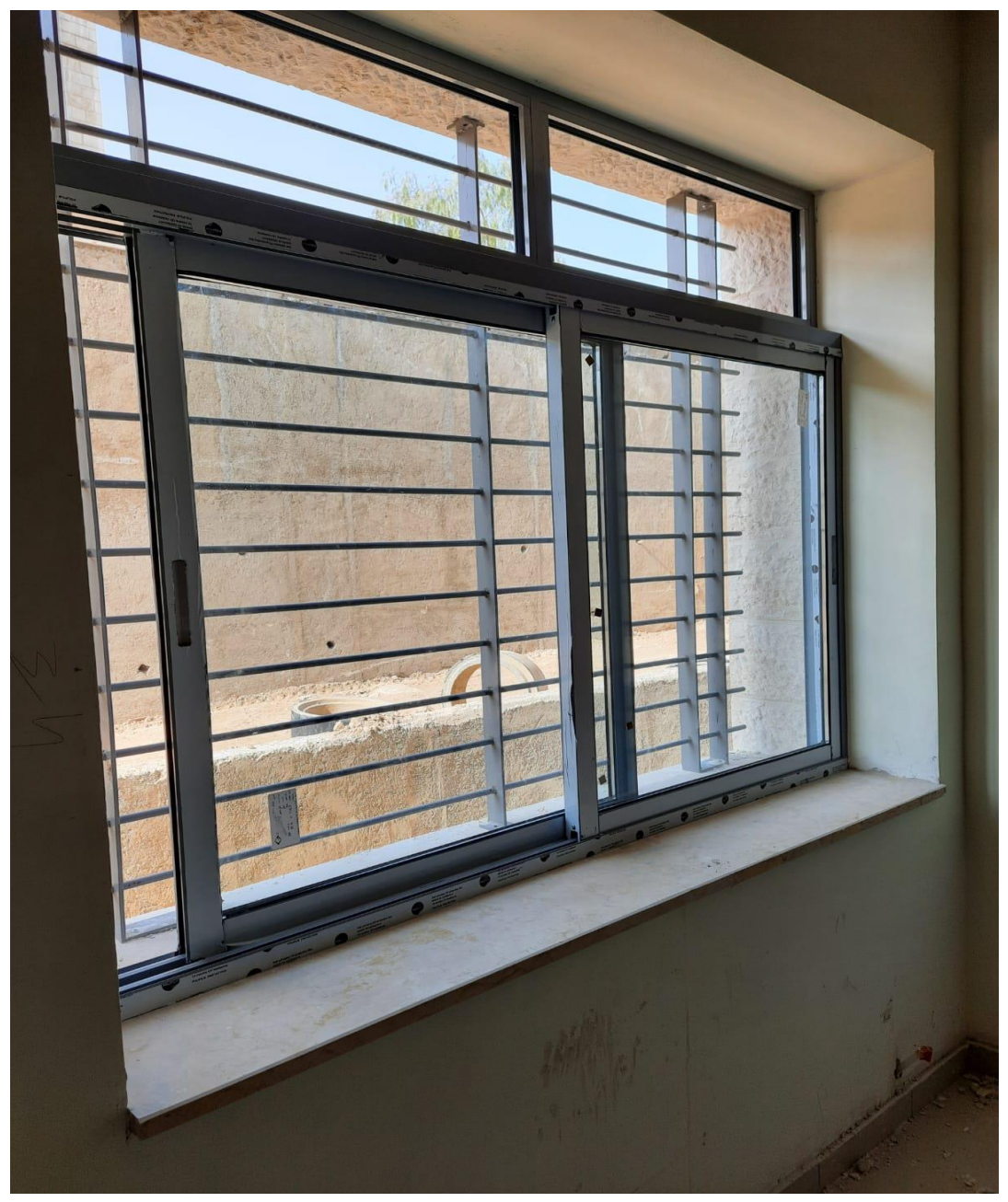
Defects in installed aluminum window