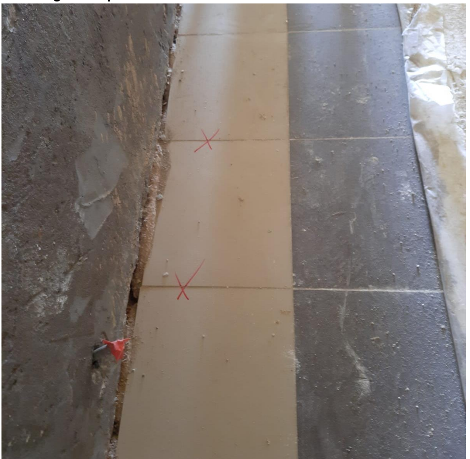
Teething at the porcelain floor tiles at the corridor