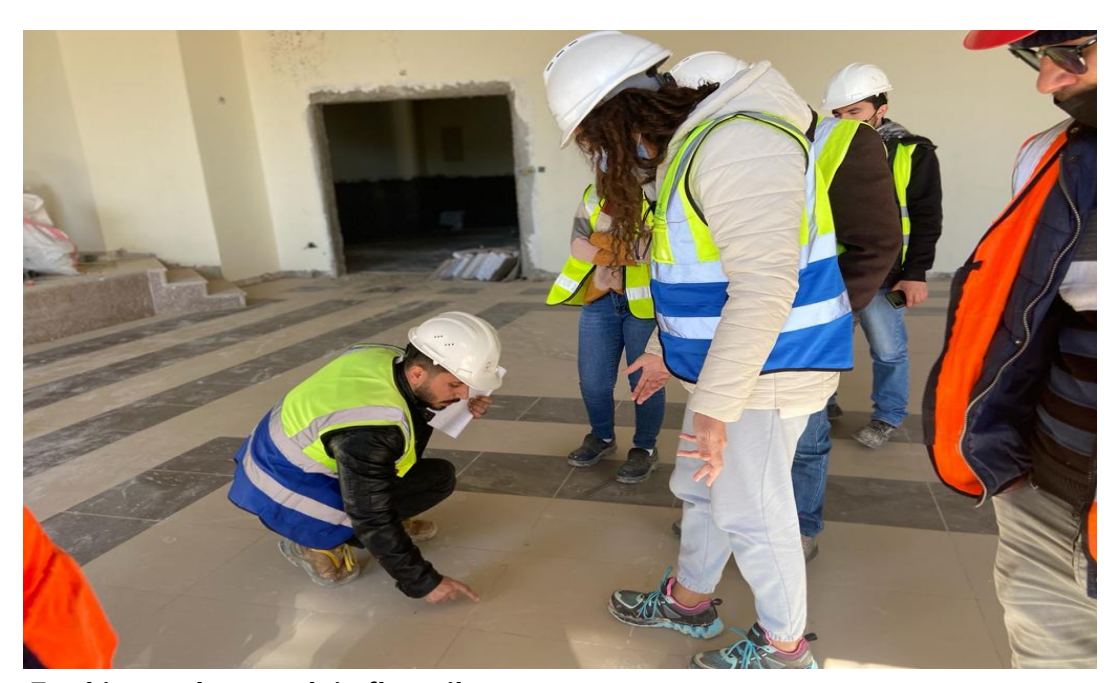
Teething at the porcelain floor tiles