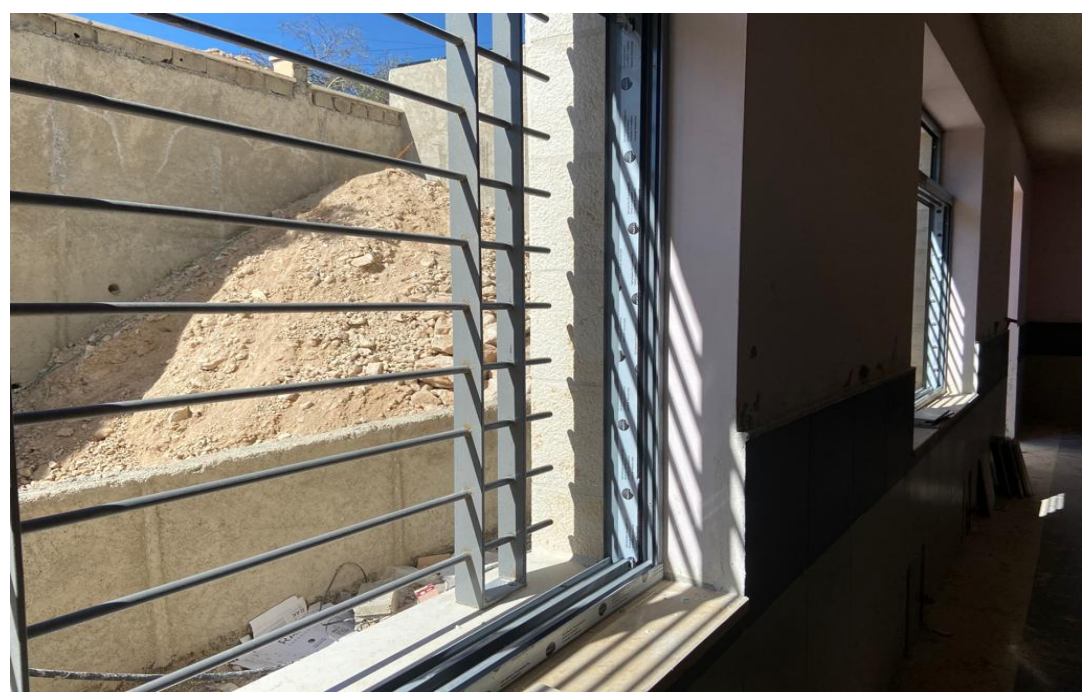
Corrosion at the steel protection screen