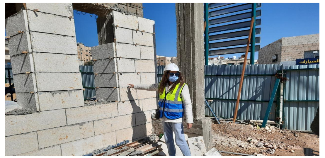
Defected stones at the guard room