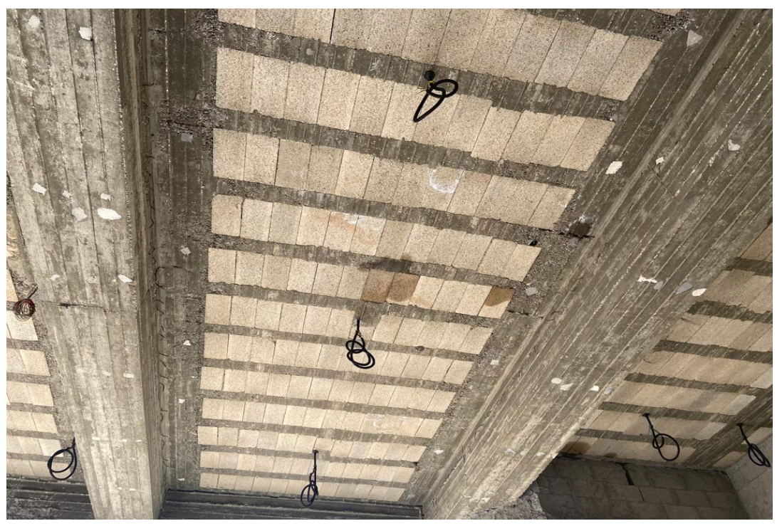
Leakage at the ceiling of the multi-purpose hall