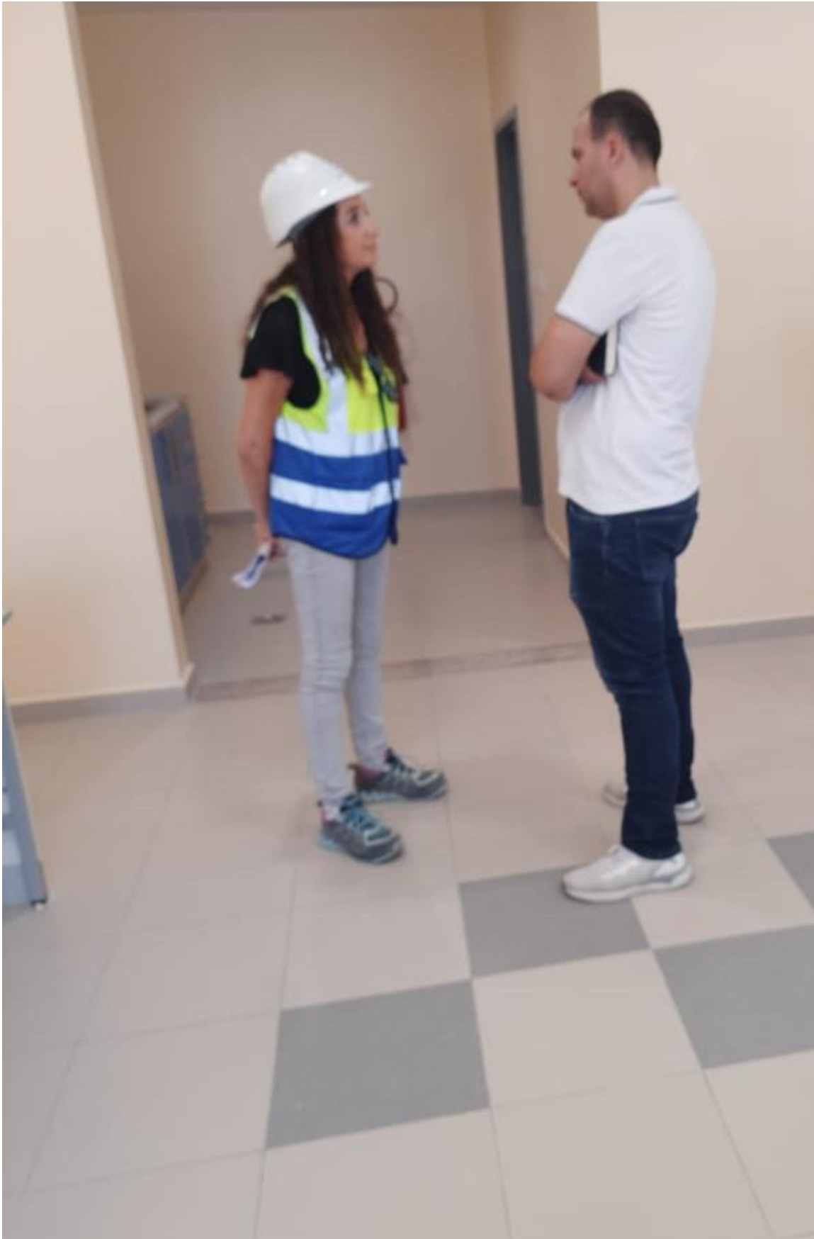
The team inspected floor tiling and painting work