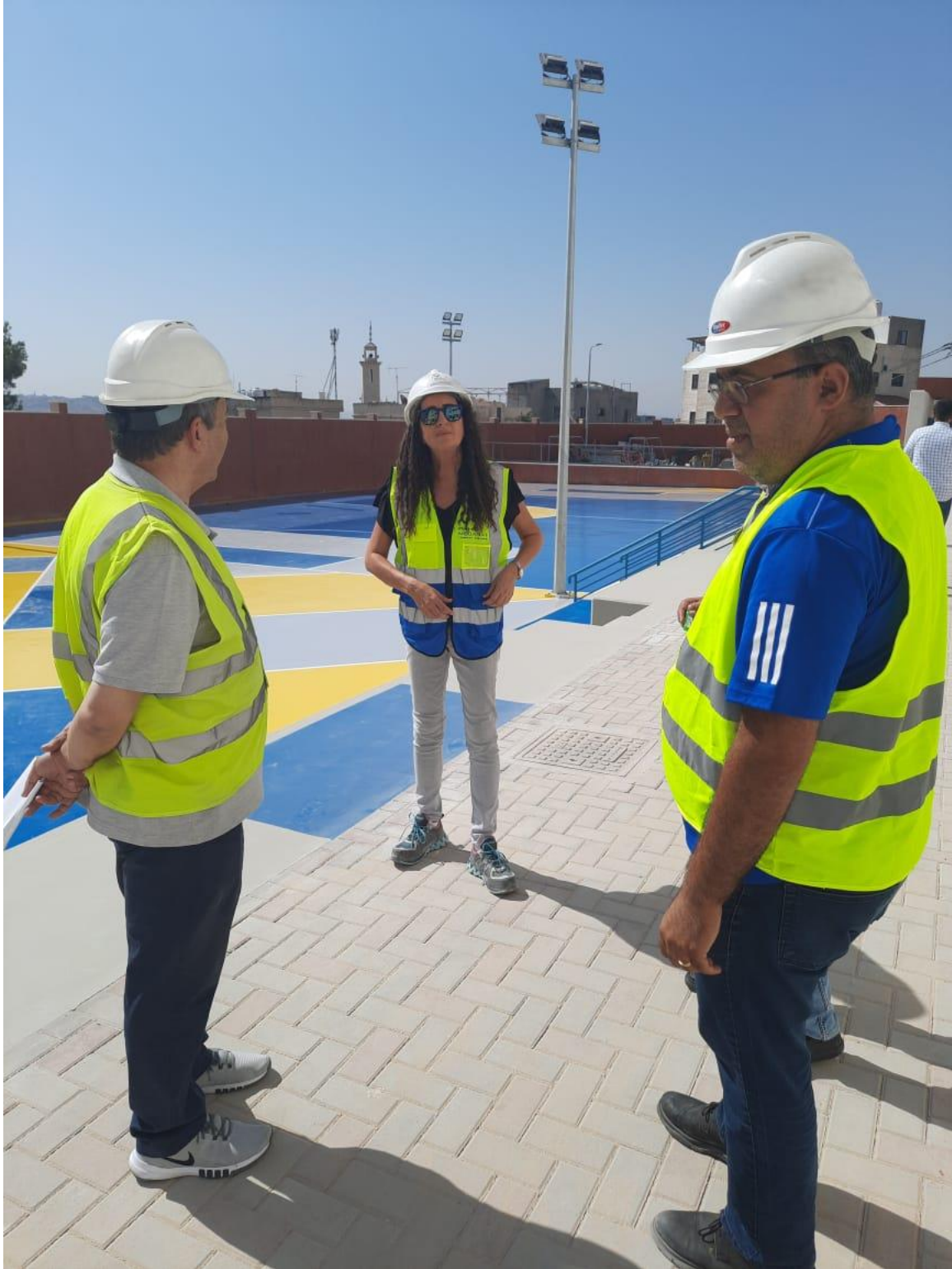
The Supervision team inspecting the execution of external works