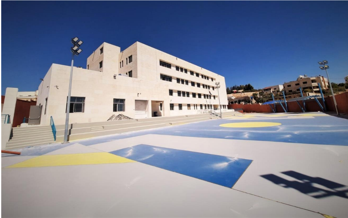
General view of the project site