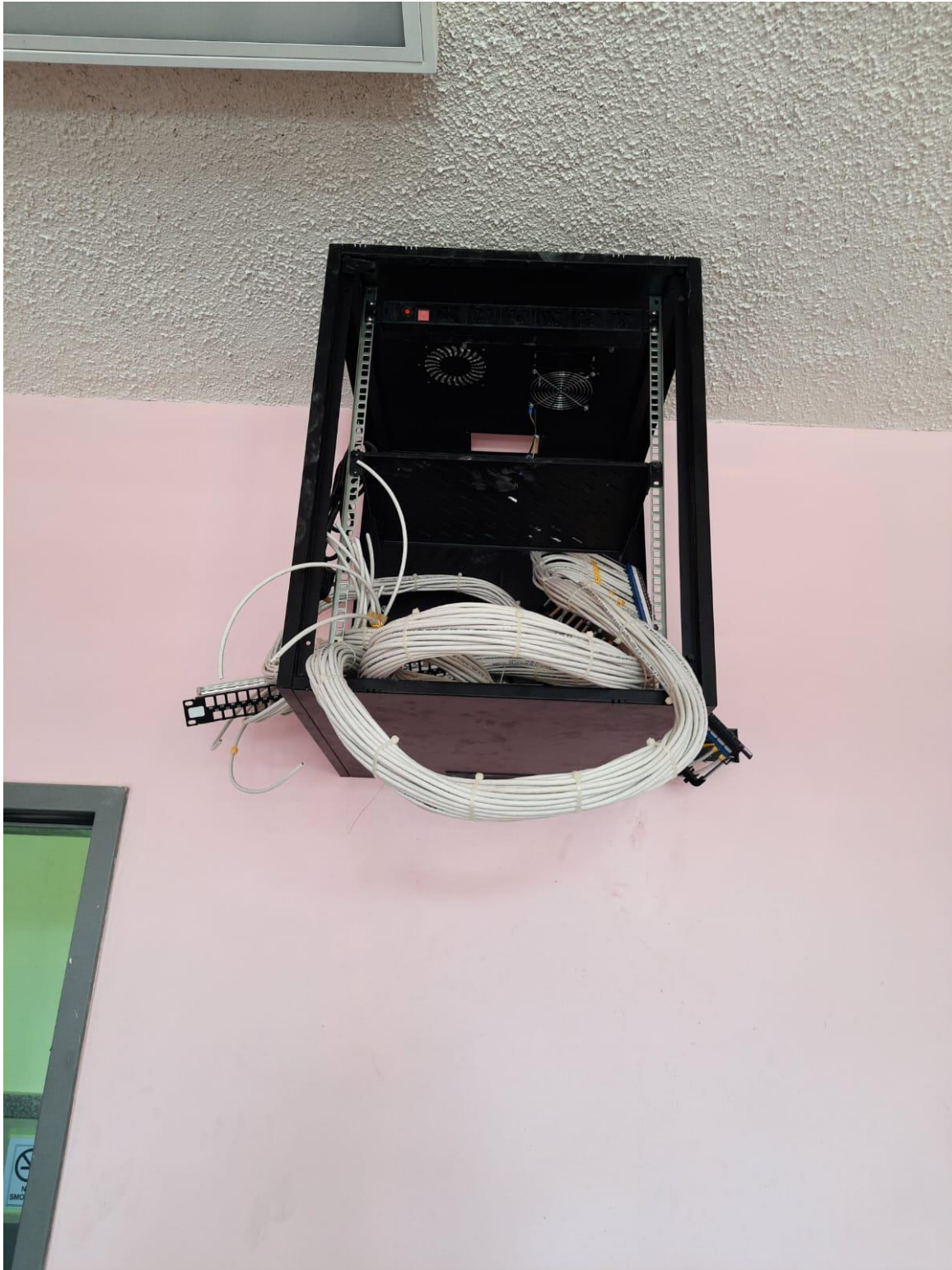
Installation of data systems