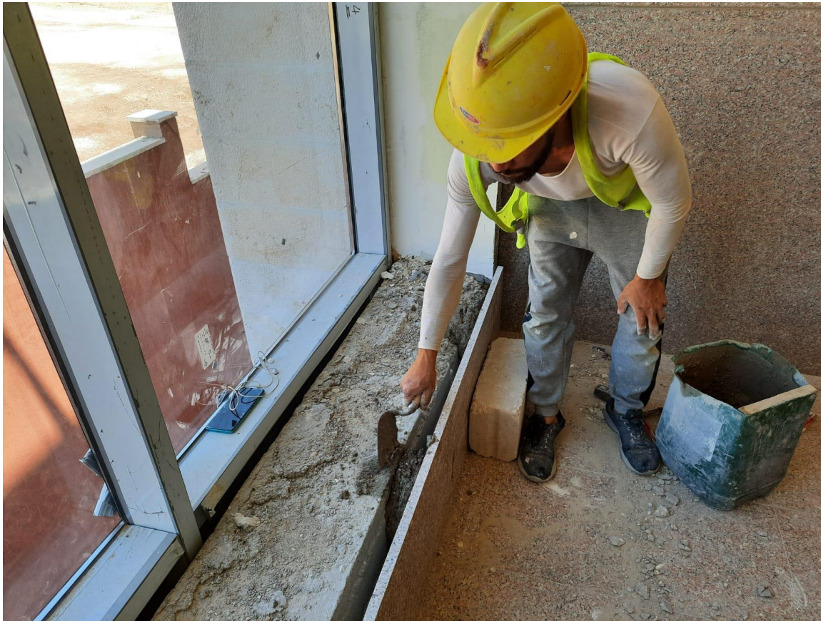
executed works for the curtain wall