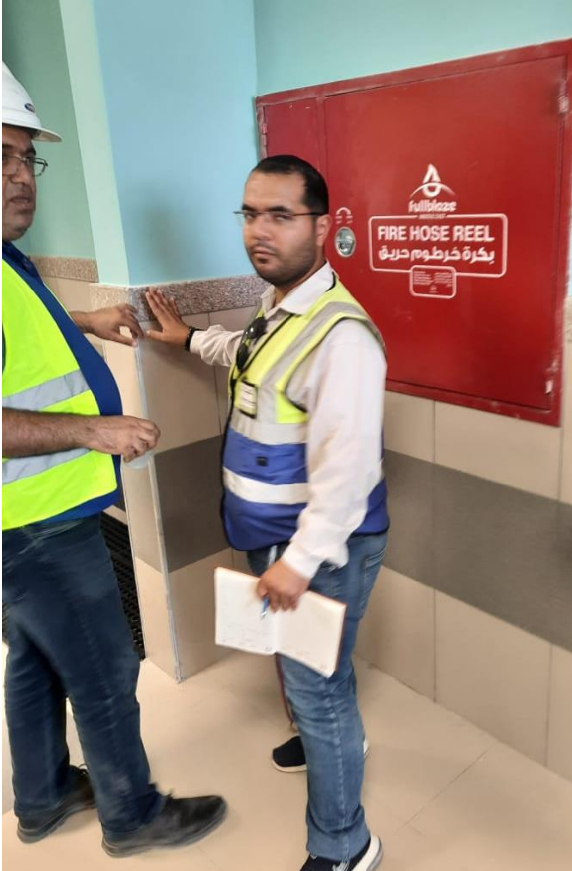
The team inspecting granite coping and of fire hose cabinets installation at the corridors