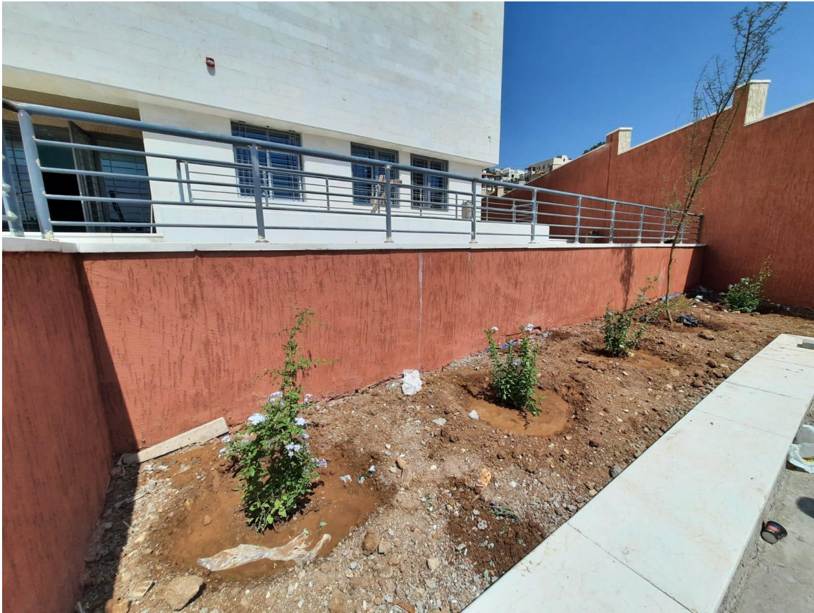
Observing planting planters with trees