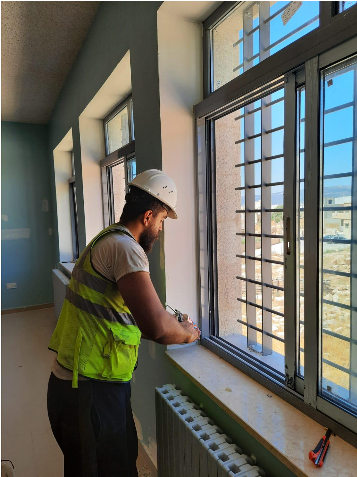
Observing aluminum windows fixation