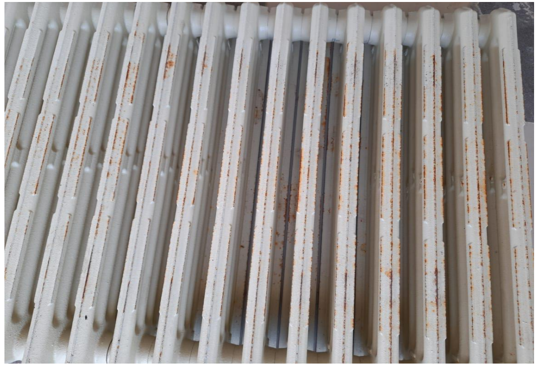
Corrosion observed on the radiators