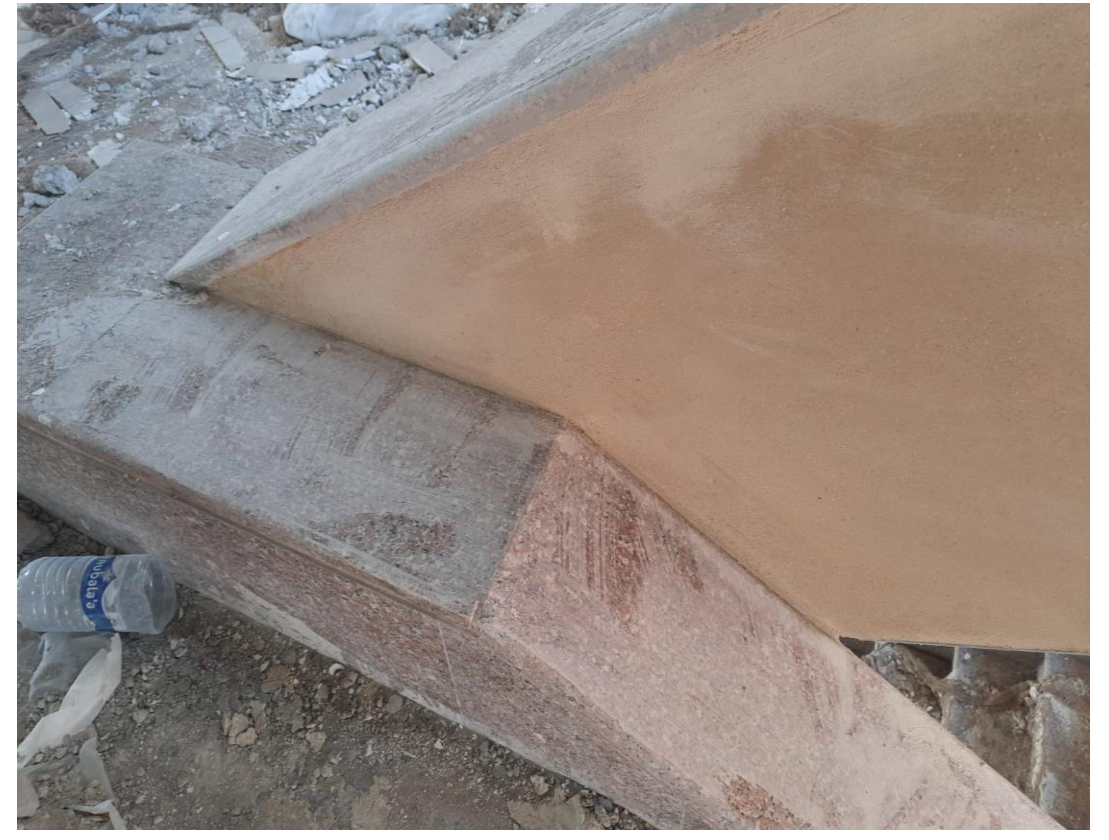
Rectified granite tiling

Replacing defected stones at the guard house