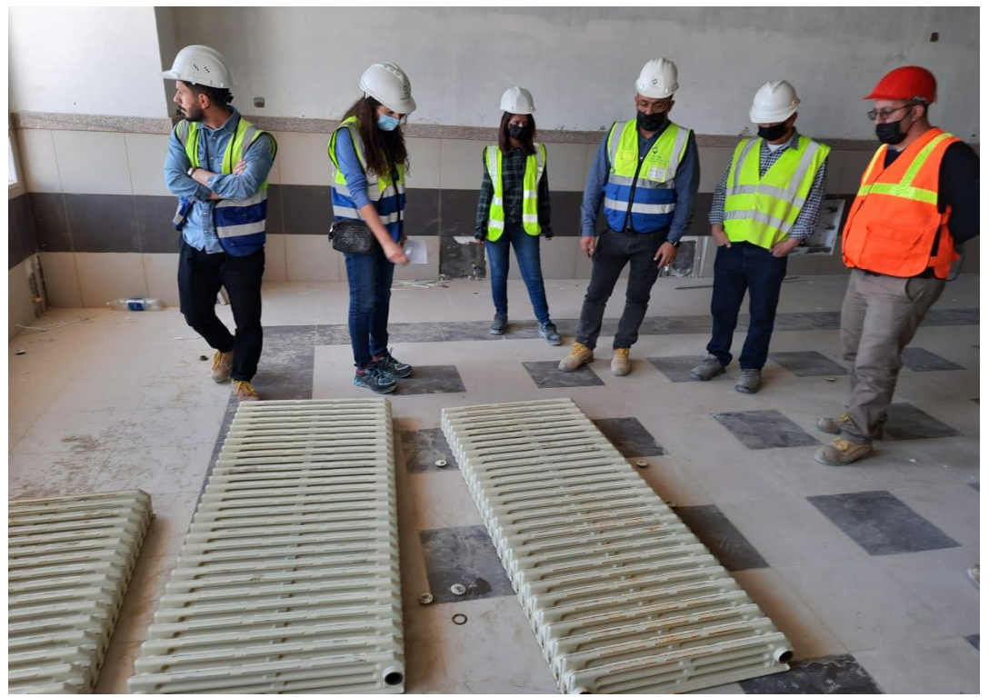
Scattered radiators on the floor tiles