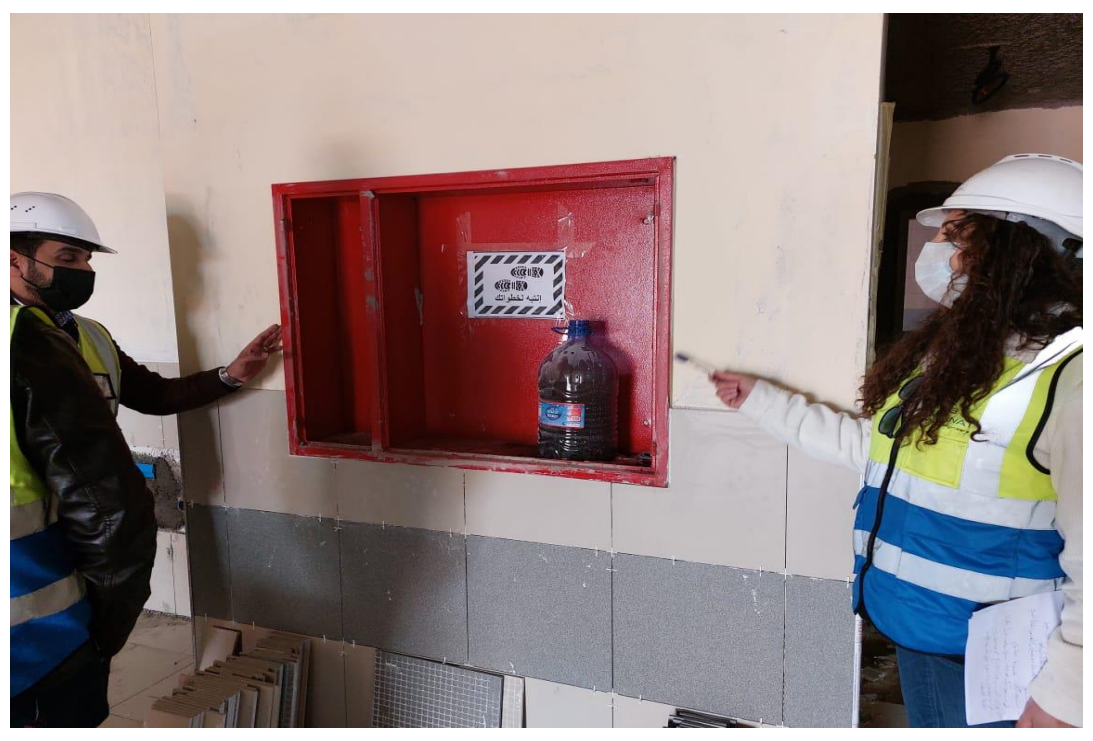
Defects in installing of fire hose cabinet