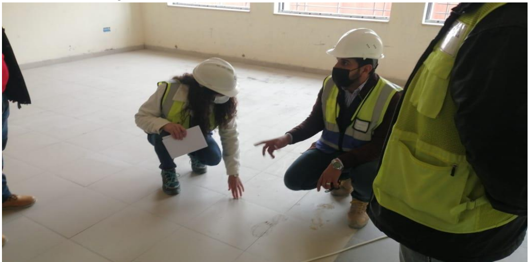
Teething in porcelain floor tiles