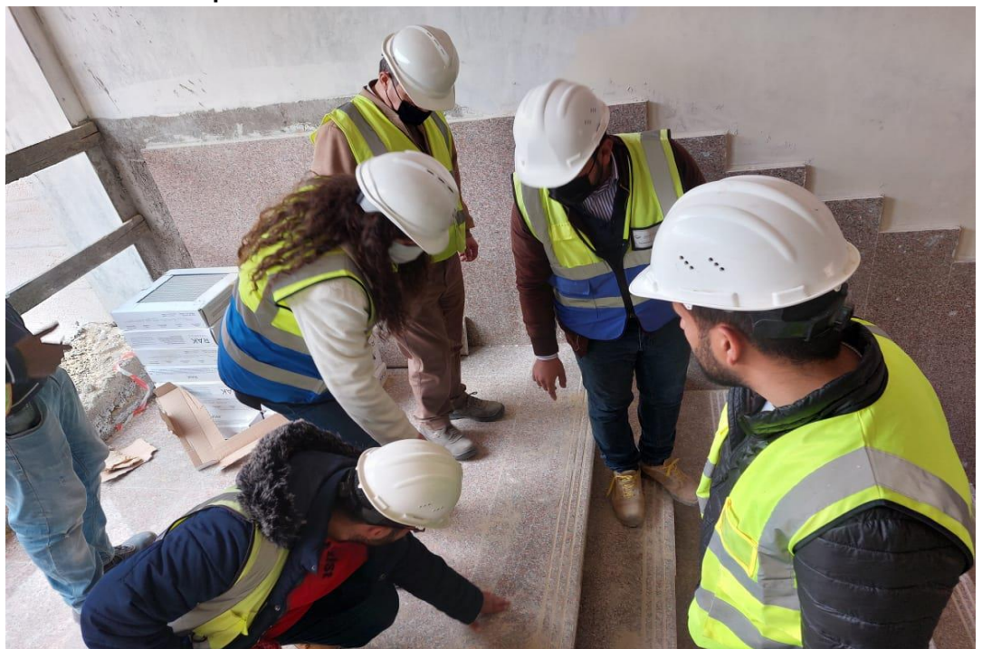
Broken staircase tread