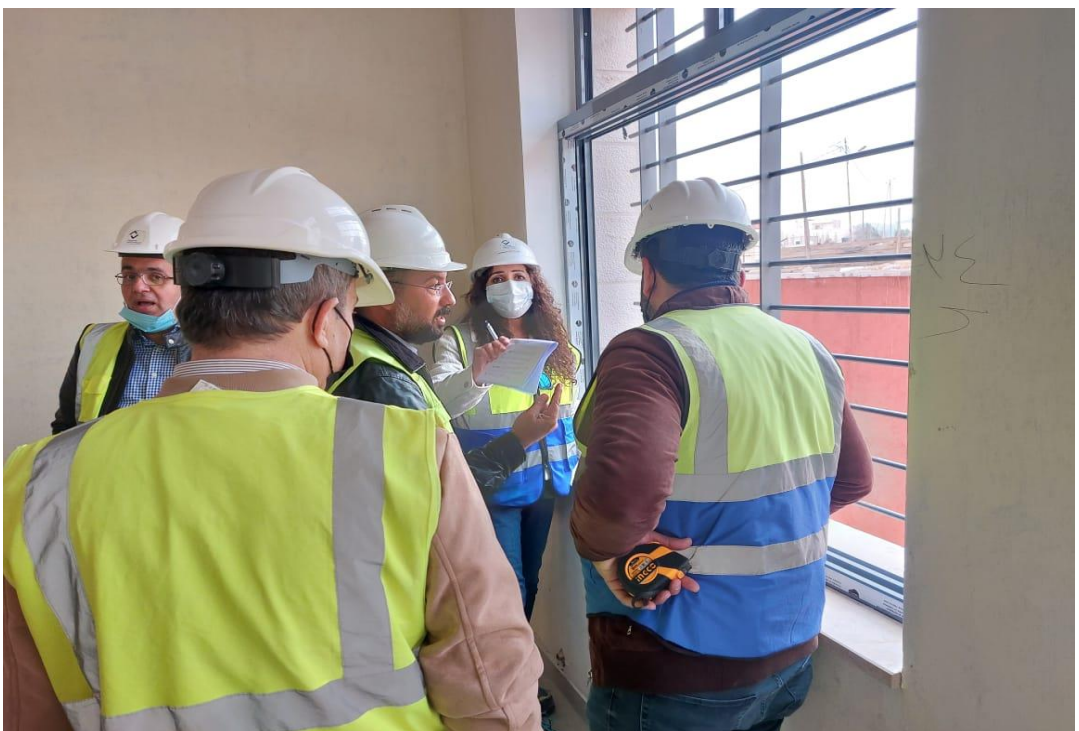
Corrosion in steel protection screens