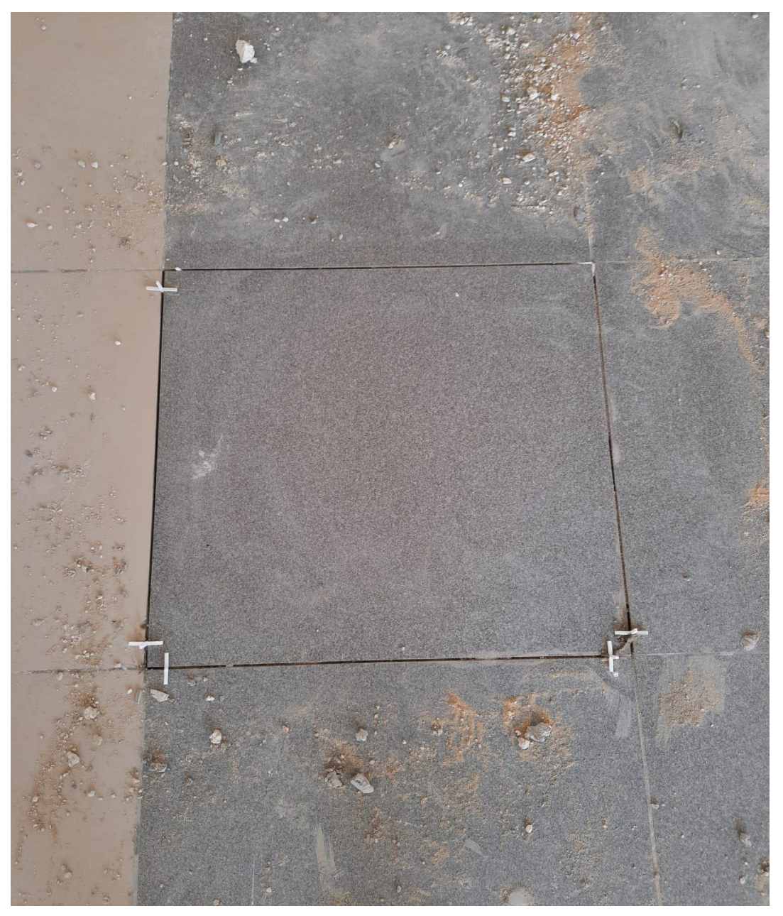
Replacement of defected tiles