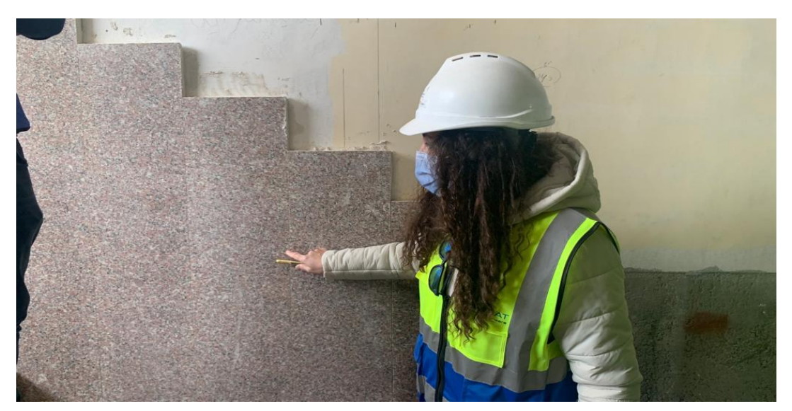
Defects in granite cladding for staircase