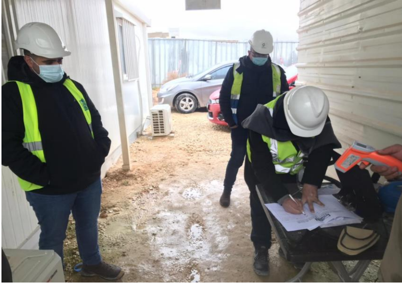
Sterilization and signing visitors' attendance sheet at the entrance of the site, complying with Covid-19 Protocol