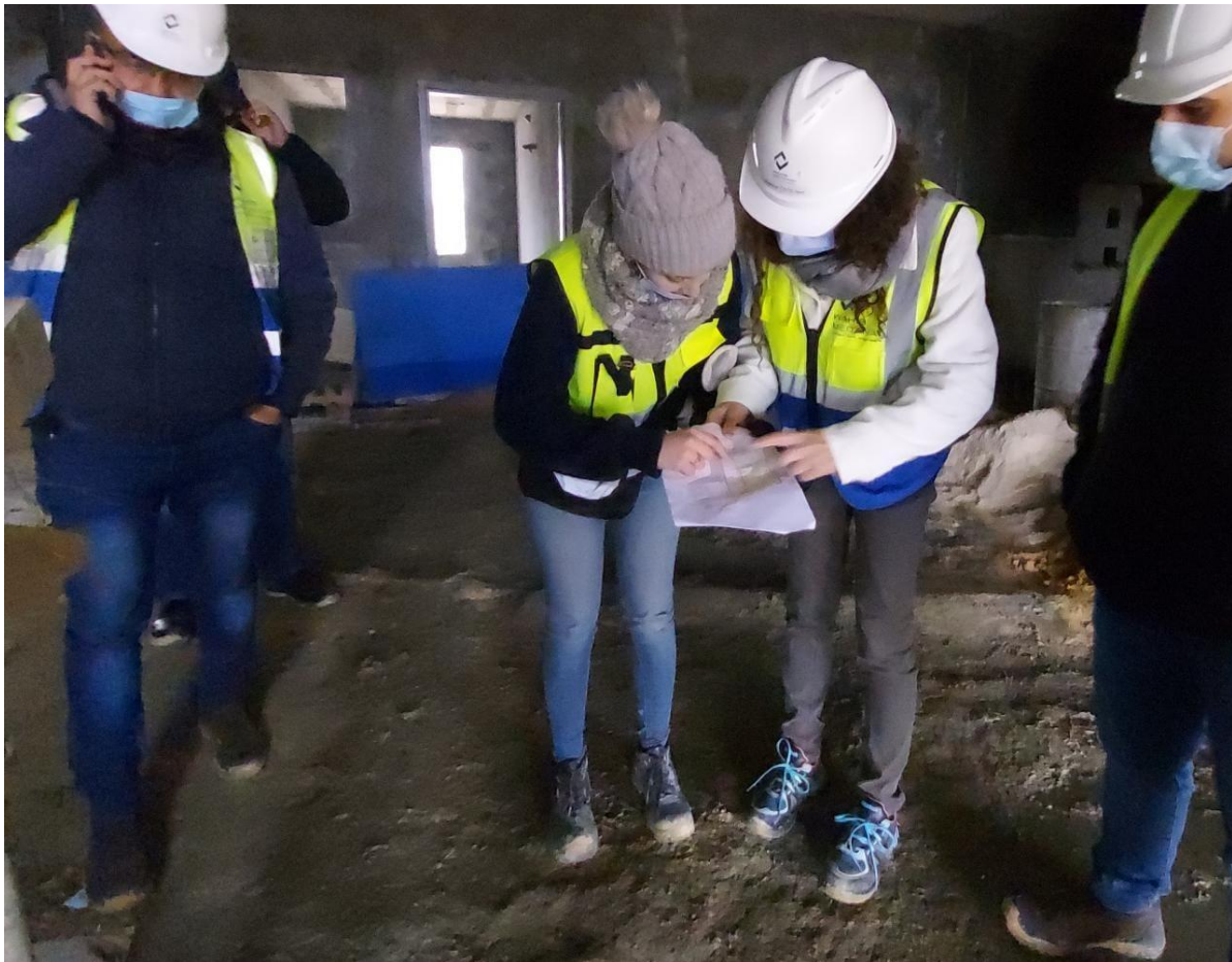
(figure:05 & 06)

The supervision team discussed with the Contractor the pattern of tiling in corridors where two colors of tiles are required. It was agreed that the Contractor will prepare revised sketches showing the distribution of the two colors in the corridors and number of rooms