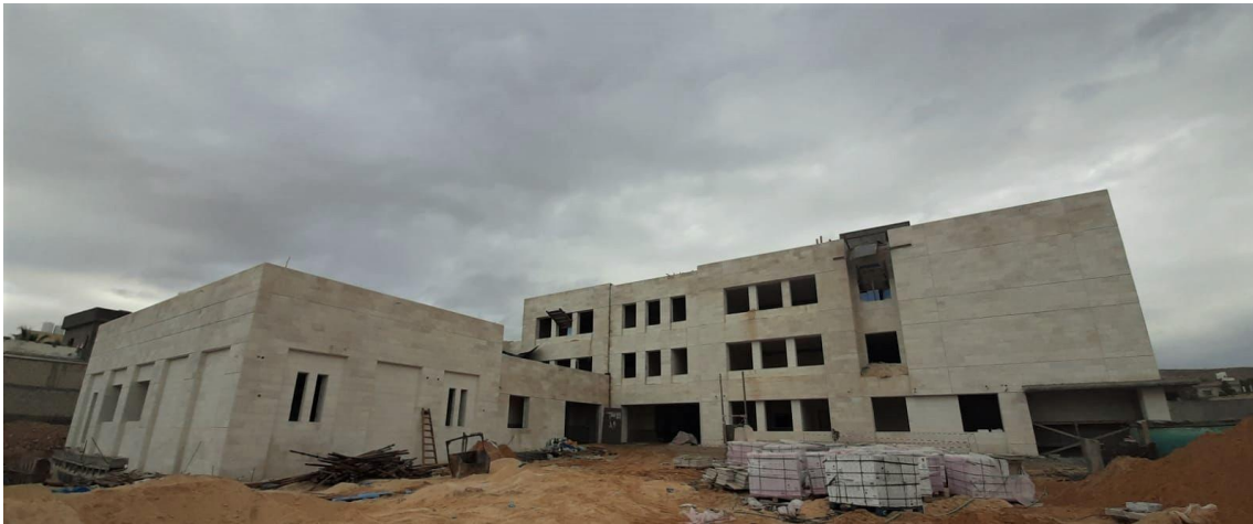
General view of the project