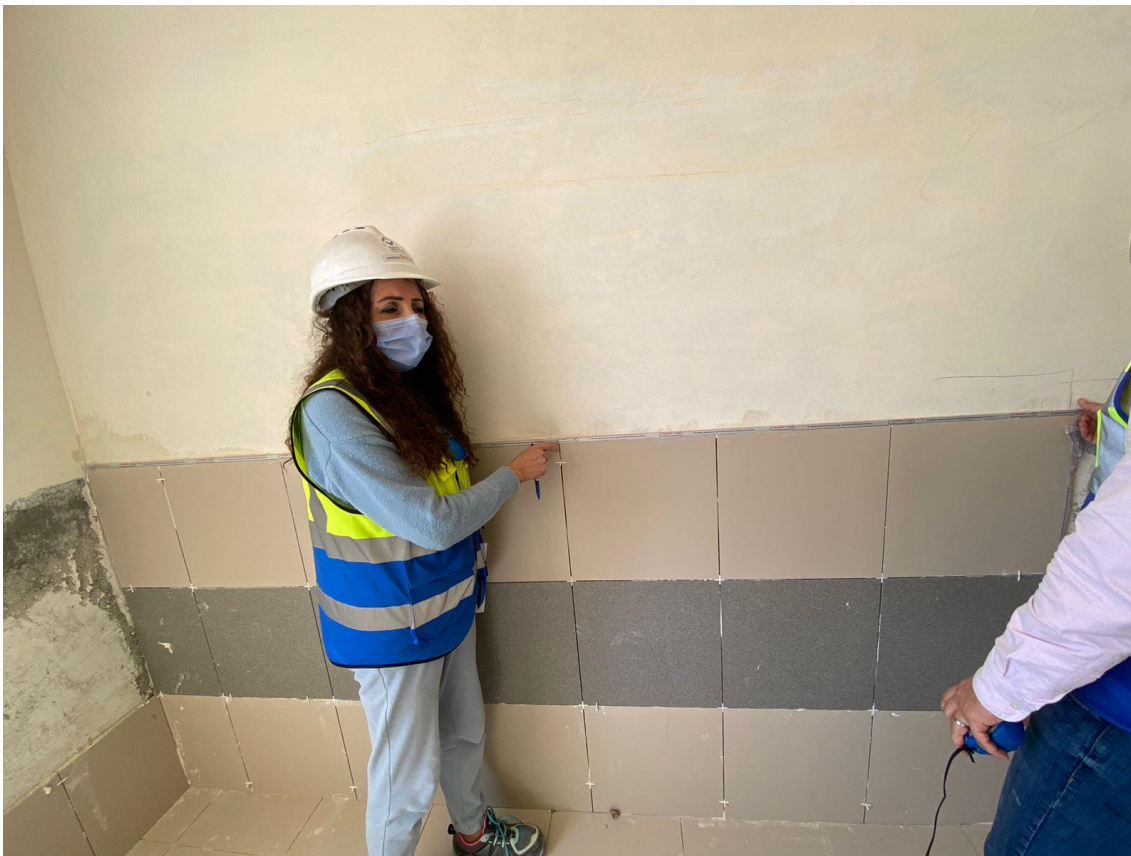
Inspecting the execution of wall tiles