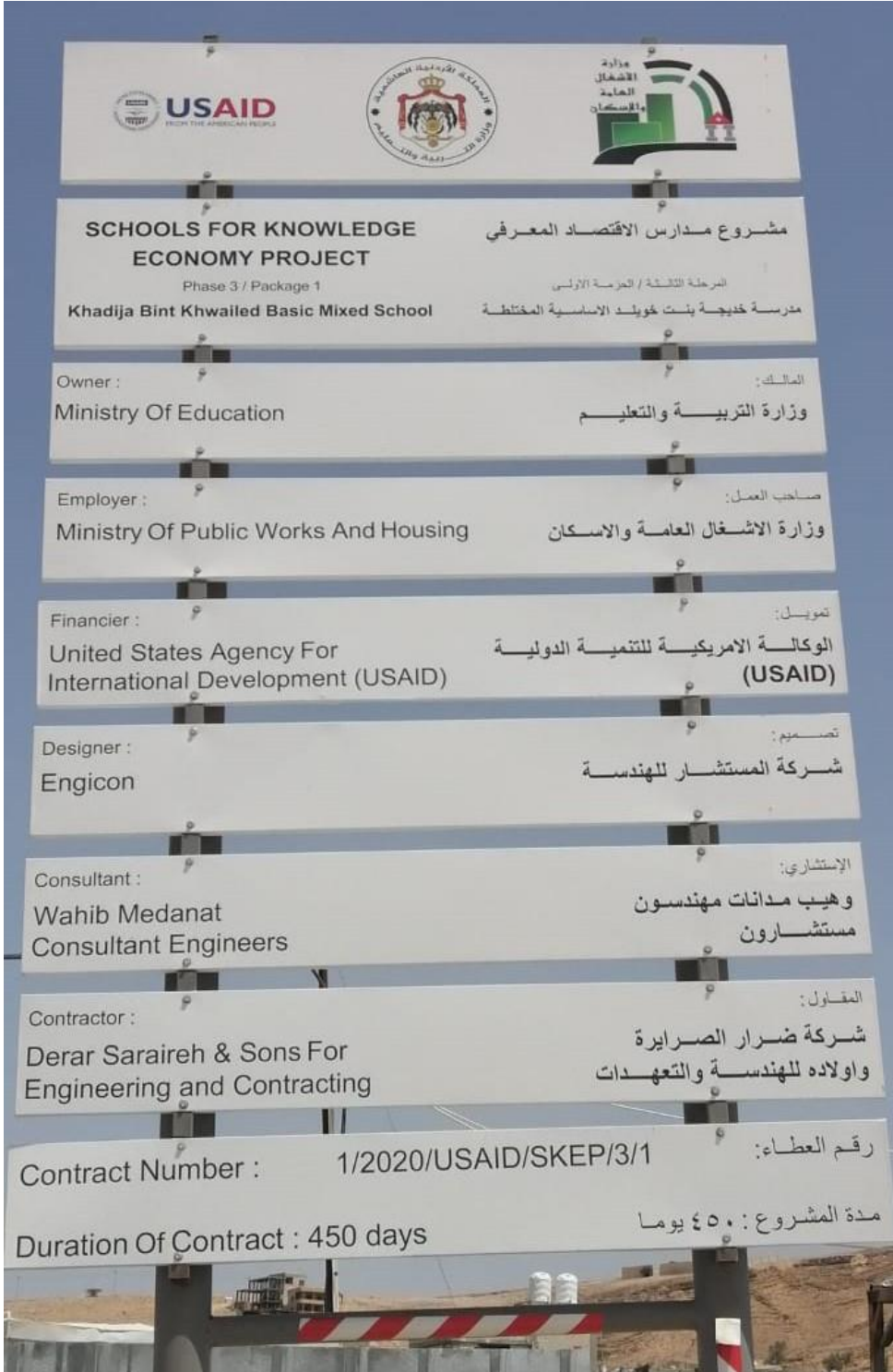
Project ID Sign on Site