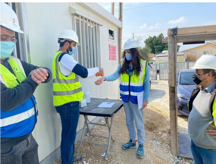
Temperature check, sterilization and signing visitors' attendance sheet at the entrance of the site, complying with Covid-19 Protocol