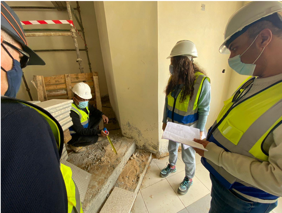
(Figure: 06 & 07)

The supervision team discussed with Contractor the executed stairs at the multi-purpose hall and requested the Contractor to submit as built sketch to resolve the issue of the prominence of the stairs into the dark color porcelain floor line