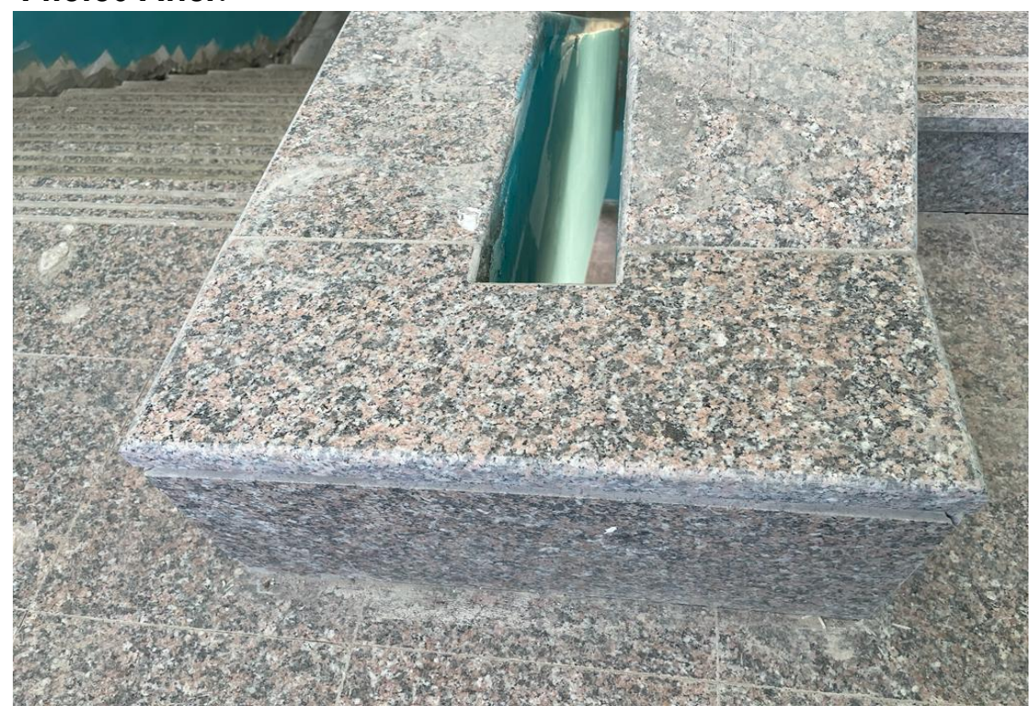
Replacing the small pieces of granite parapet cover of the staircase by larger suitable pieces