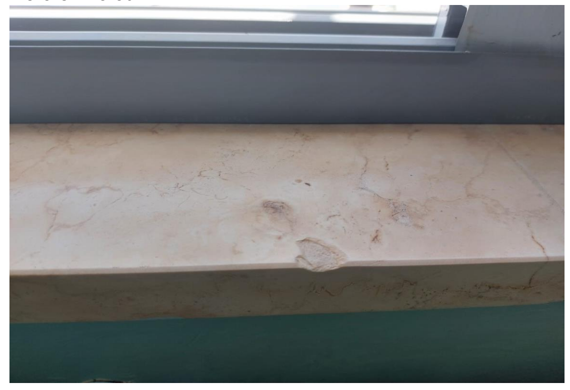
Broken edges of the window sills