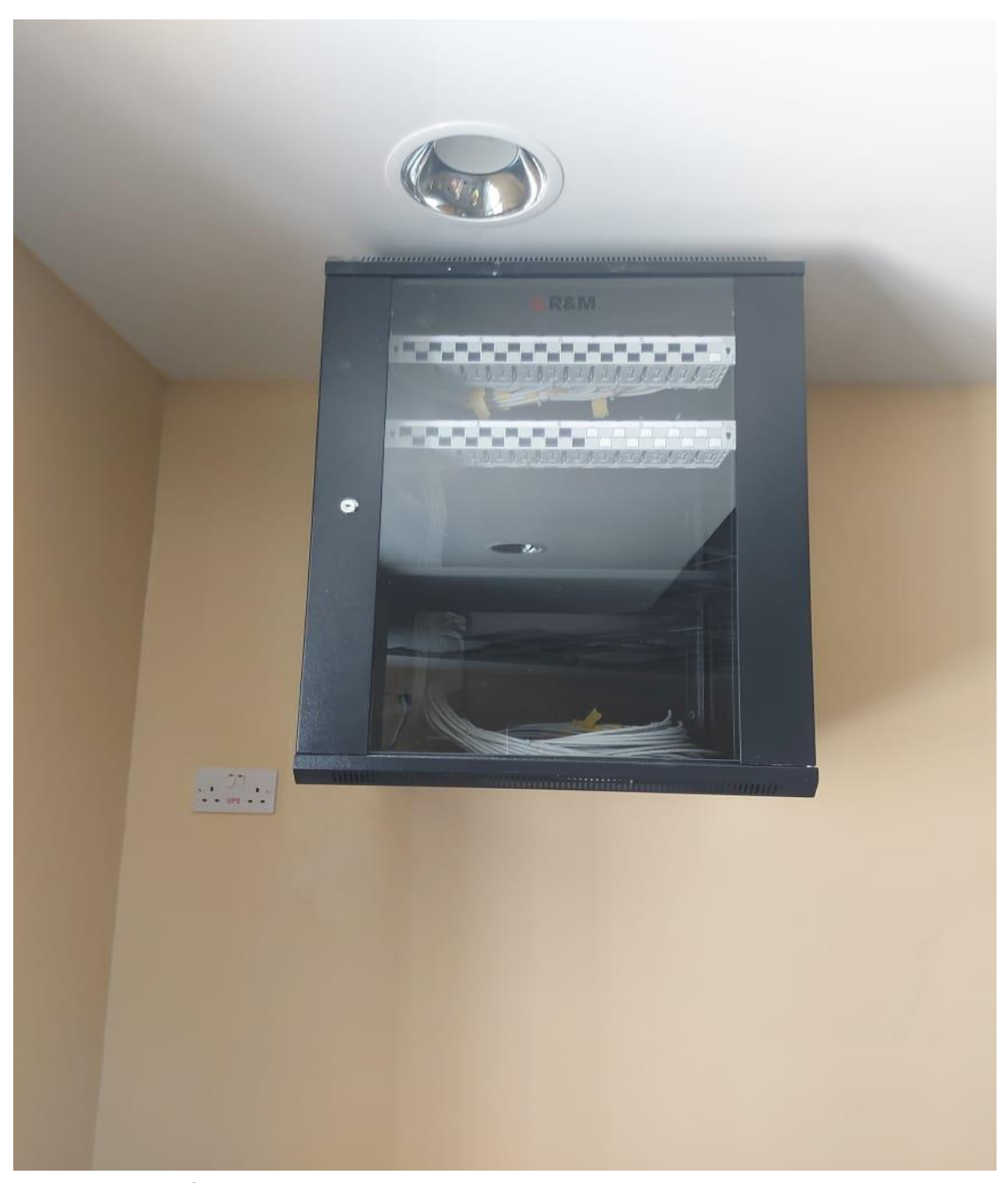
Re-installing of Data System cabinet without causing damages