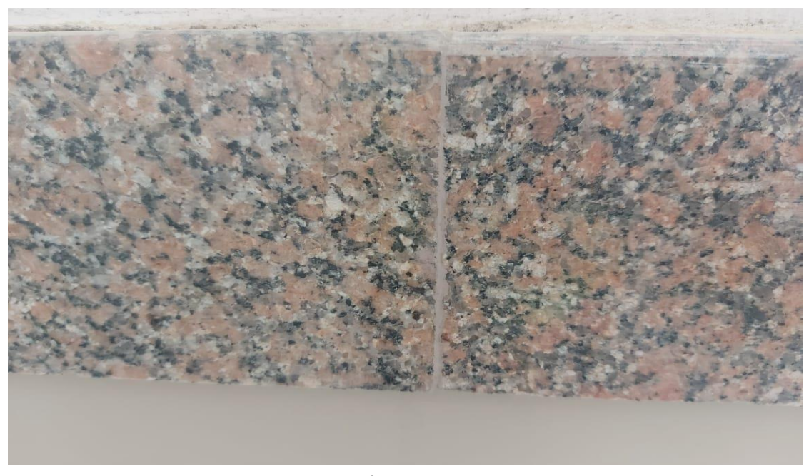
Replacing the unacceptable red grout for granite coping with the approved grout