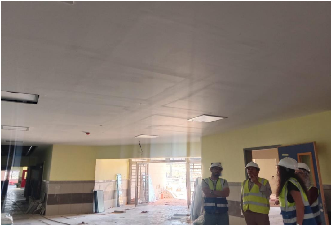
Waviness in the painting of the suspended ceilings