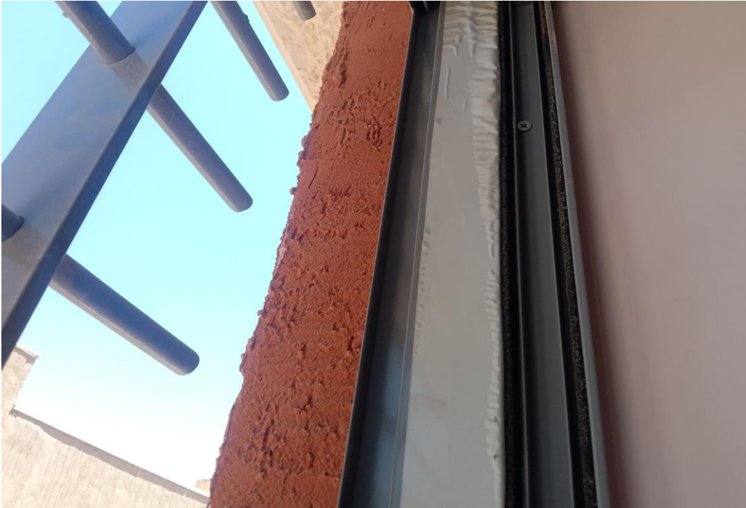
Defects in the plastering and painting for a number of window jambs