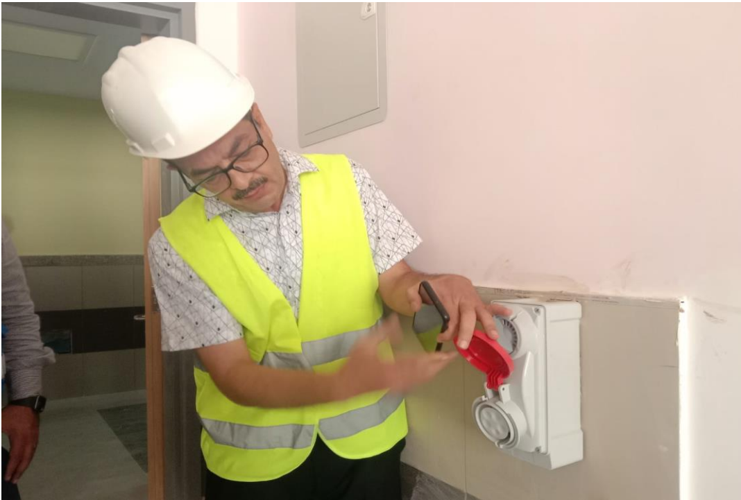
Incorrect installation of the electrical outlets at the laboratories