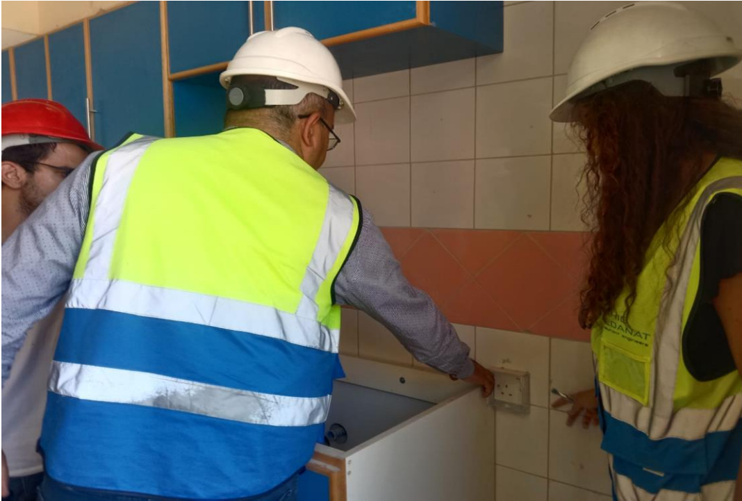
Contradiction between the granite counter top with the location of electrical outlet