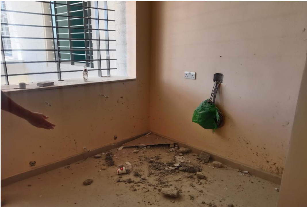
Accumulation of debris inside the building and defects in tiles as a result of that