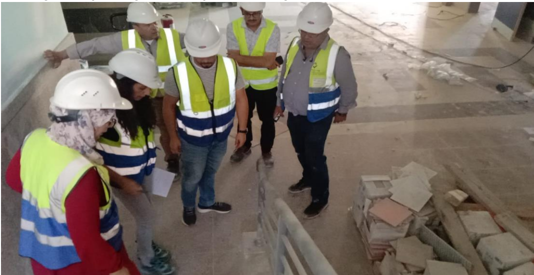
Fixation of the handrails of the staircase is insufficient