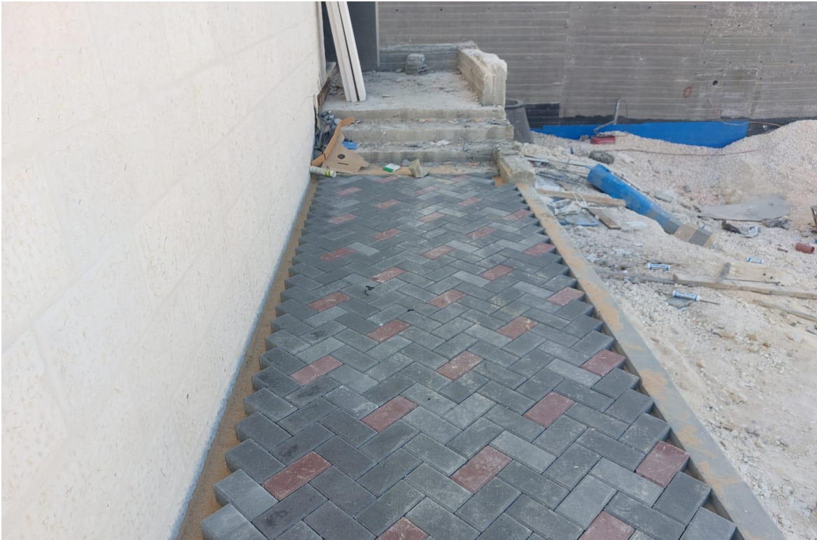
The team inspected the execution of interlock tiles