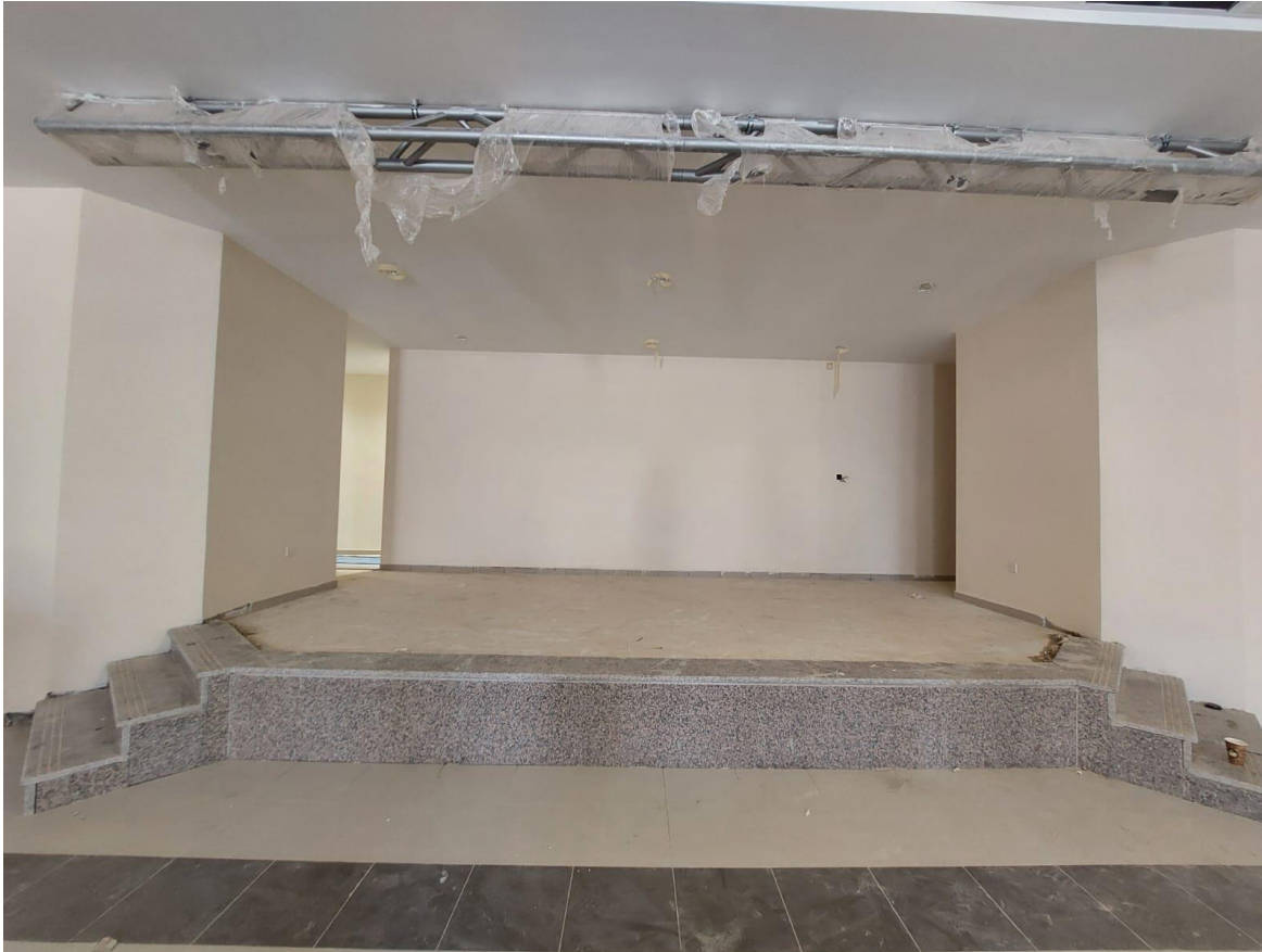
Checking the progress of works at the multi-purpose hall