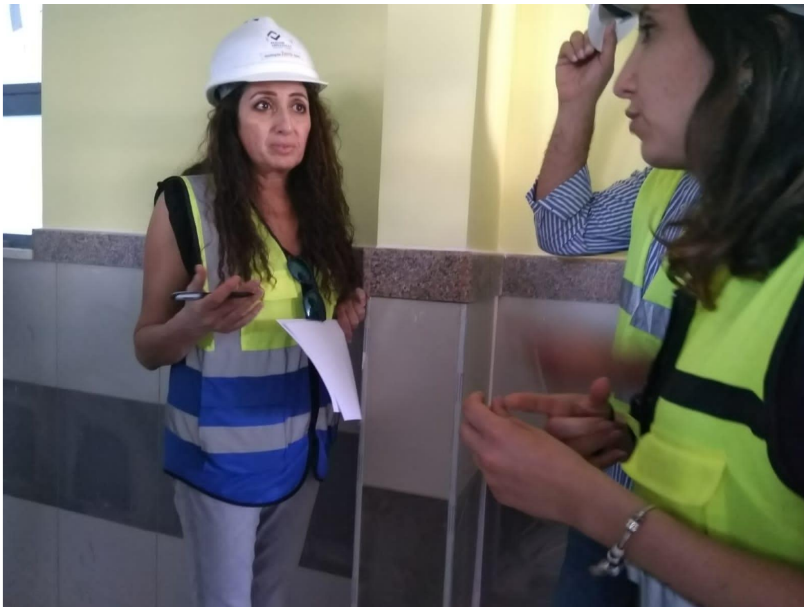
Inspecting granite coping at the corridors