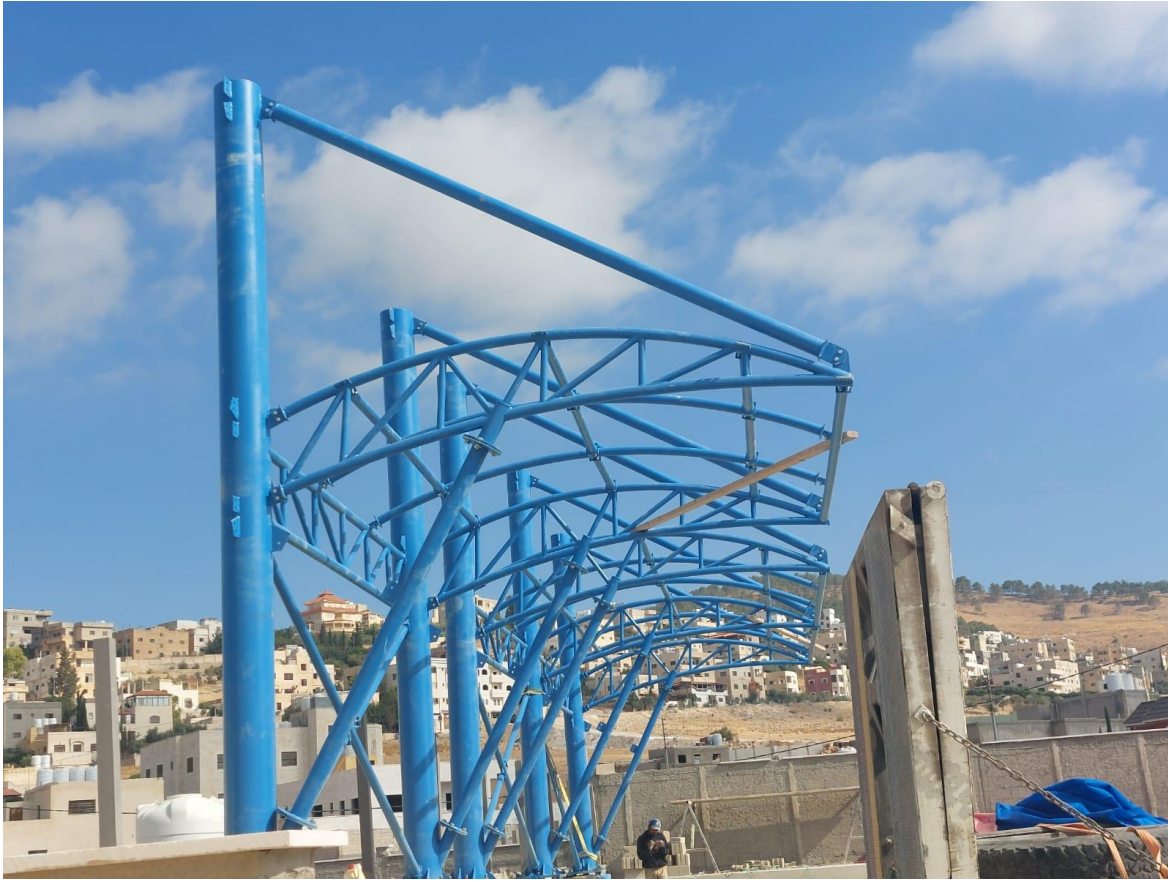
The team inspected the execution of shadings