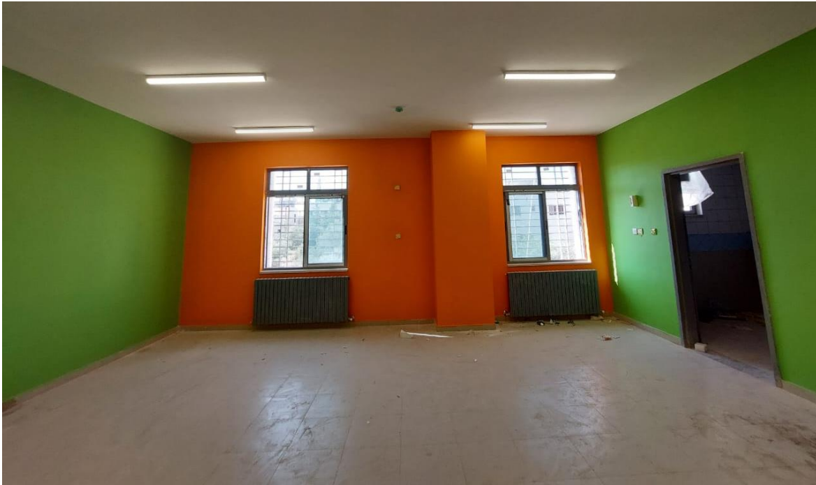
Observing painting works