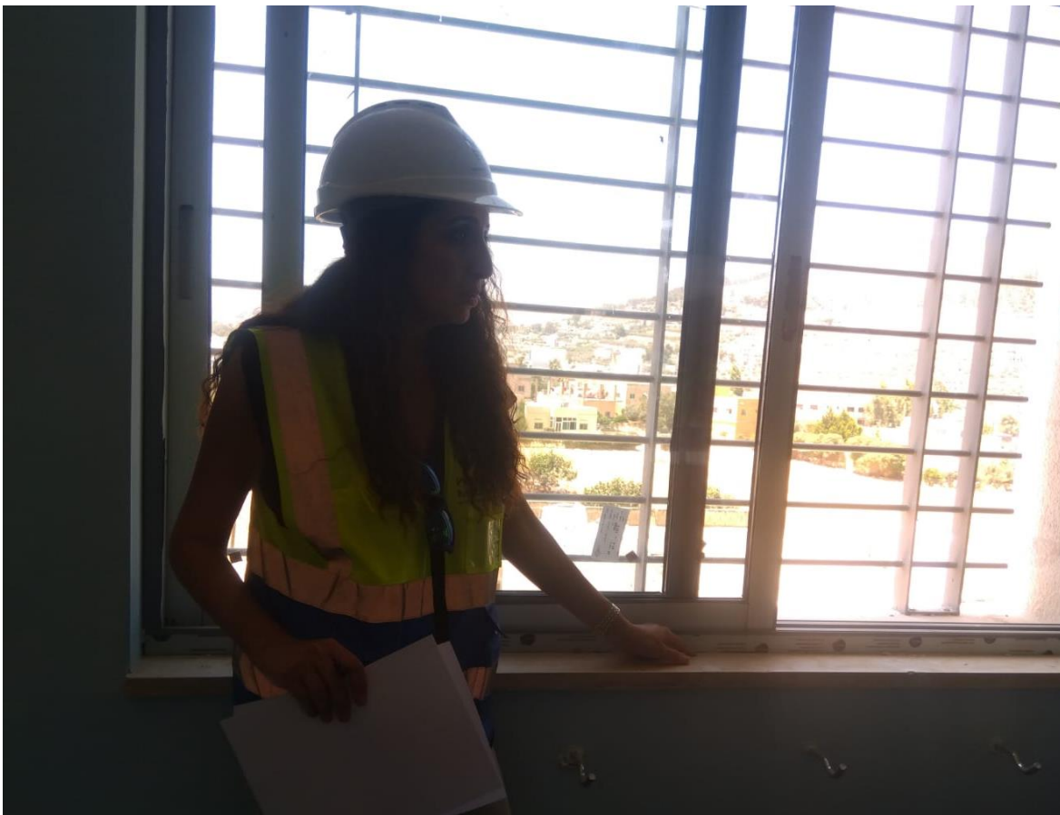
Inspecting aluminum windows and windows protection screens