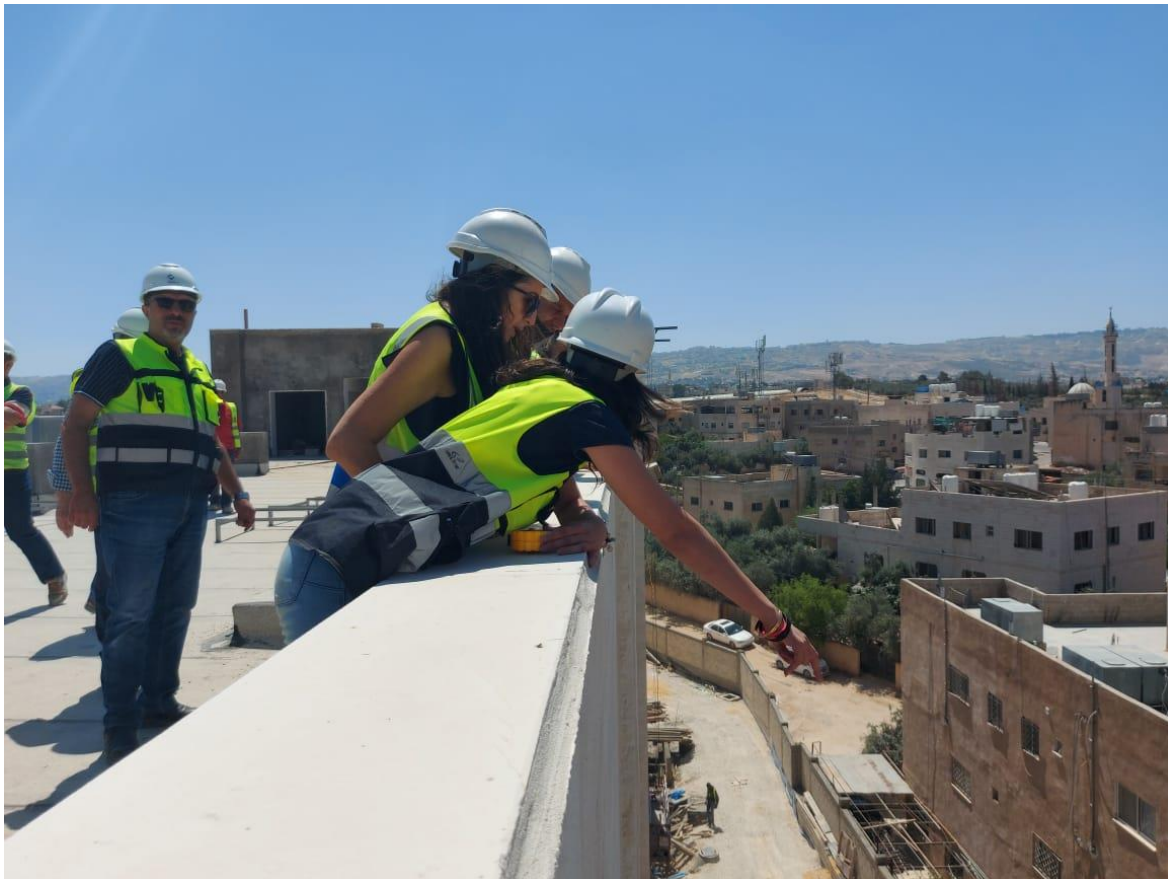
Discussing the status of boundary wall works