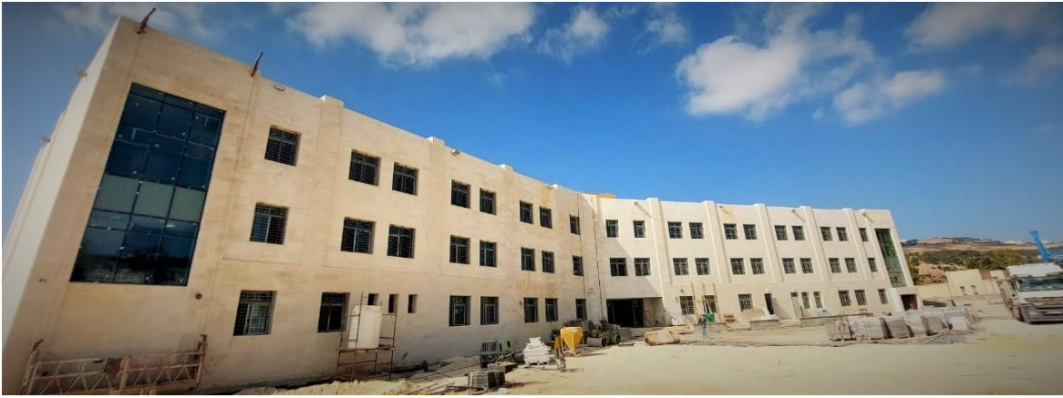
General view of the project site