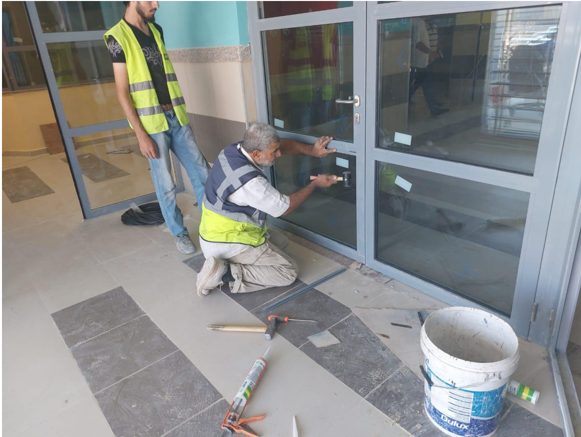
The team observed fixing aluminum doors accessories