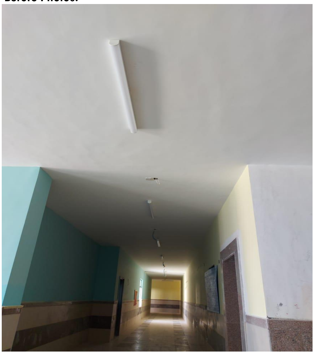
Waving in plastering of ceiling