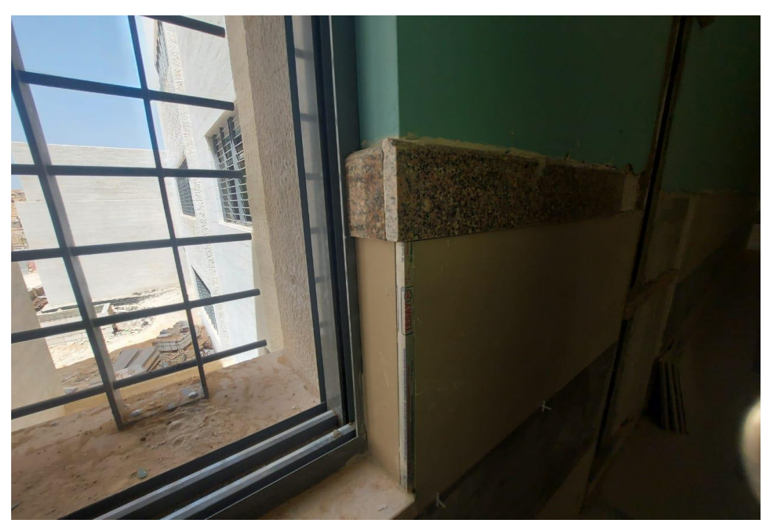
Wrong installation of granite coping