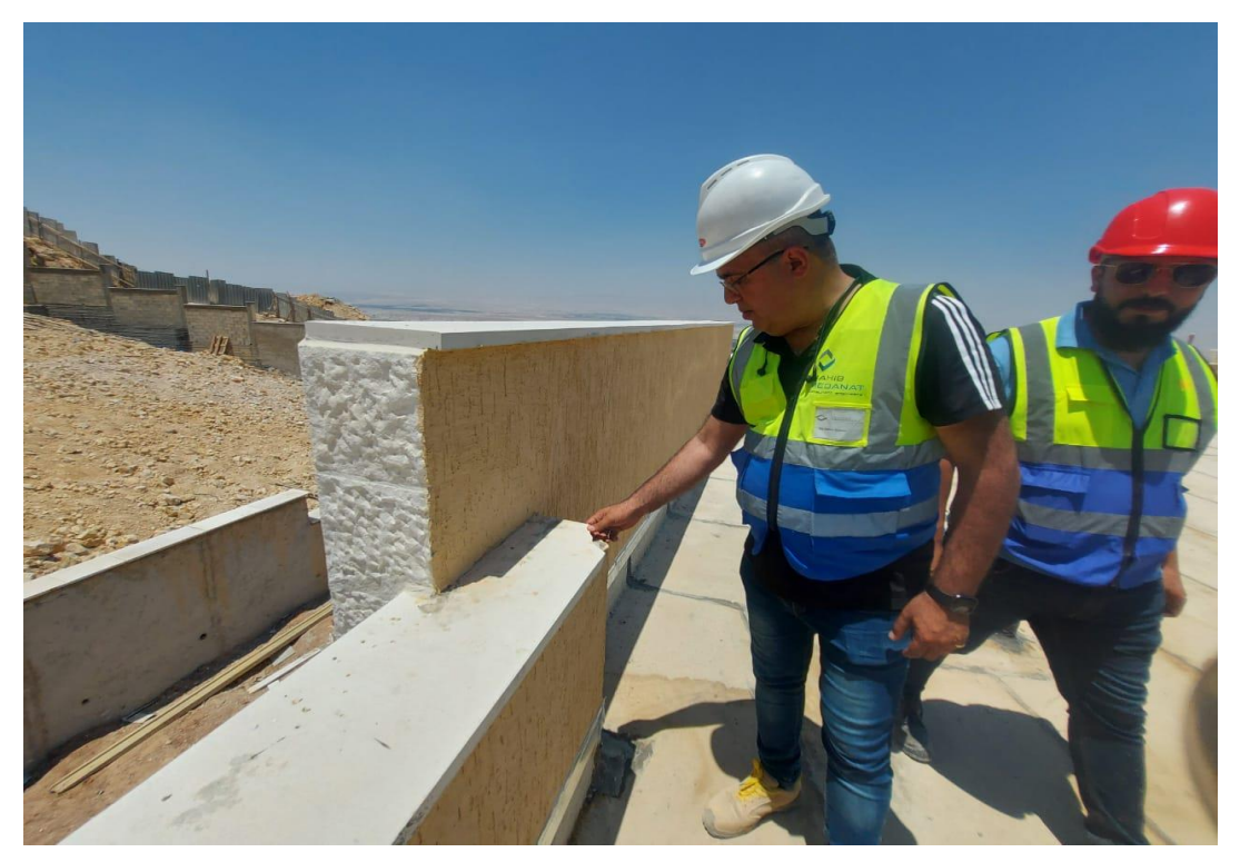
Broken stone coping

C:\Users\o.naddaf\Desktop\QCs-June 2022\