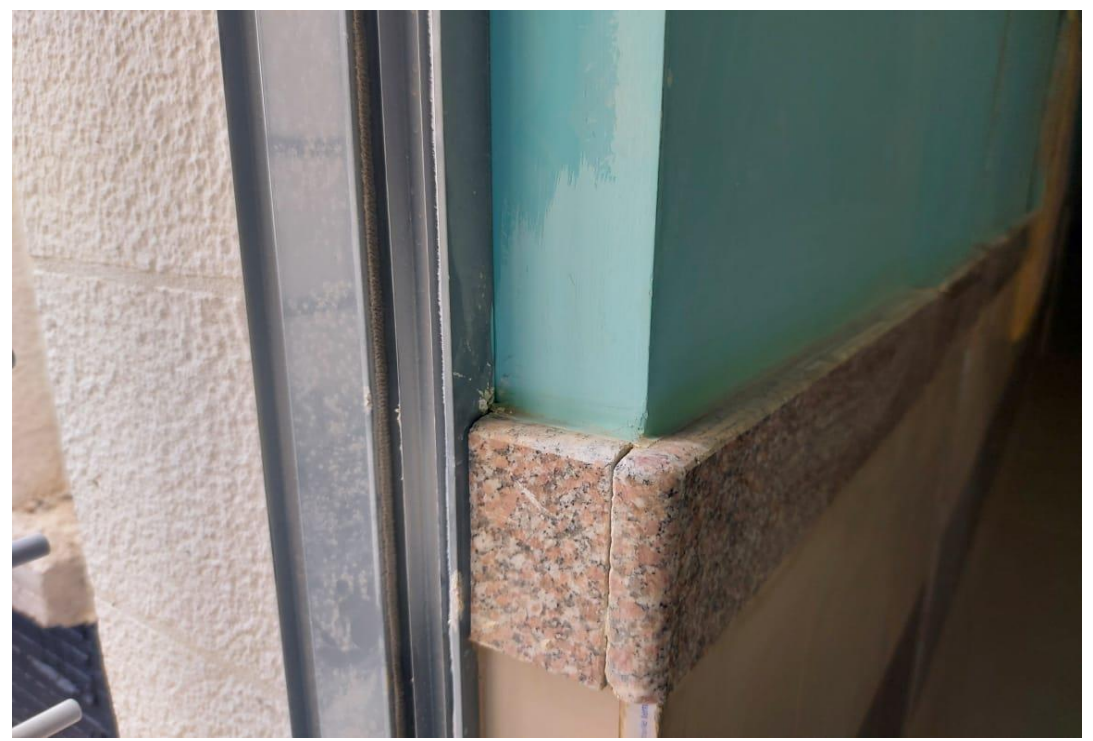
Rectified granite coping