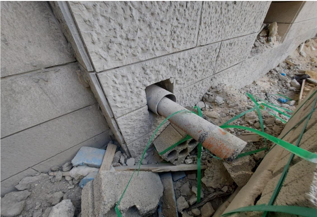
Broken stone around the outlet pipe