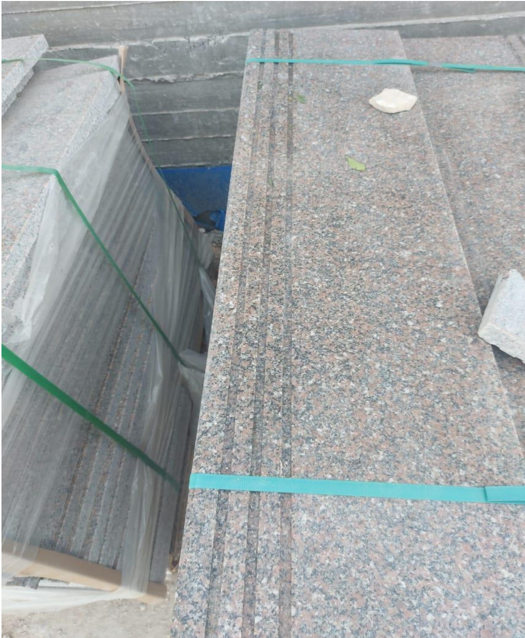
Stairs treads with grooves