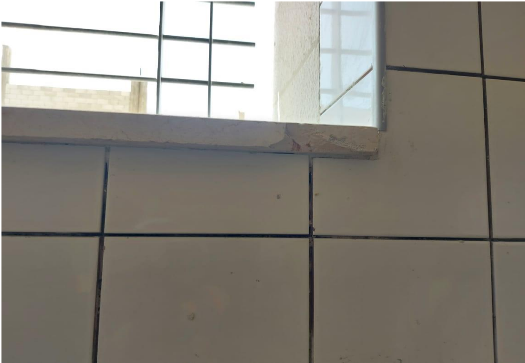
Broken sill and shortage in length