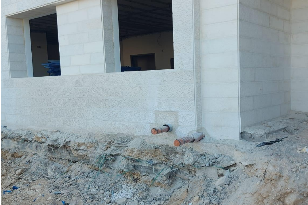
Finishing around the outlet pipes