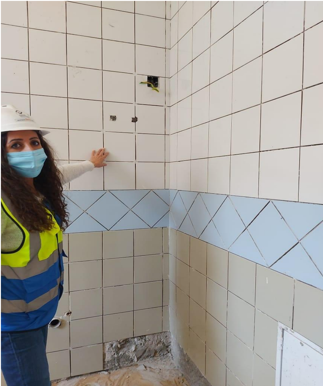
Small cut-off pieces of tiles