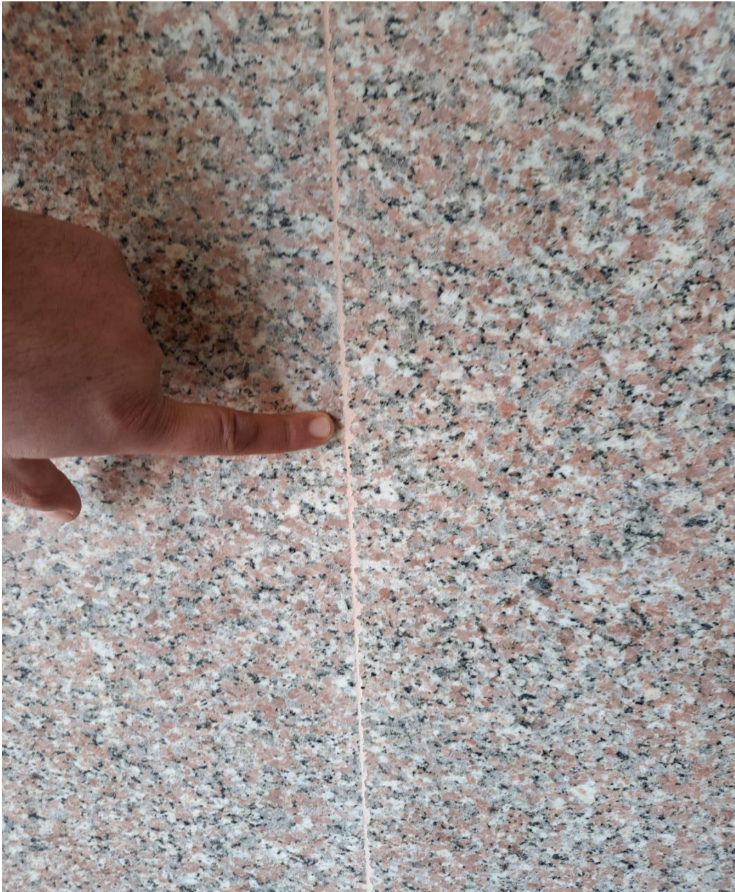
Defect in wall cladding