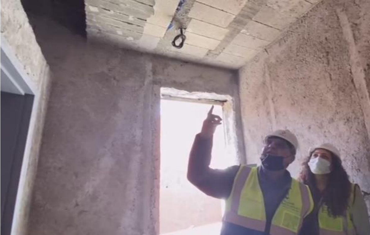
Gaps within the block walls over the suspended ceiling at wet area