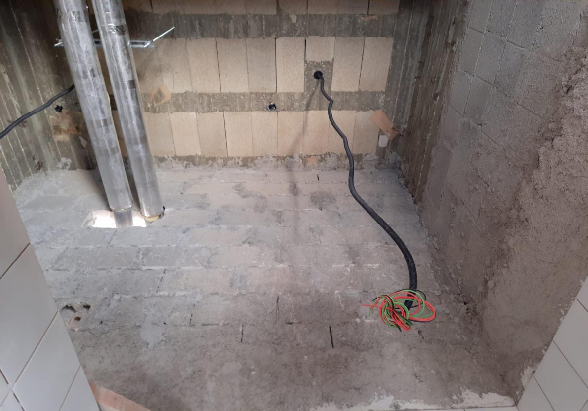
Rectified block wall