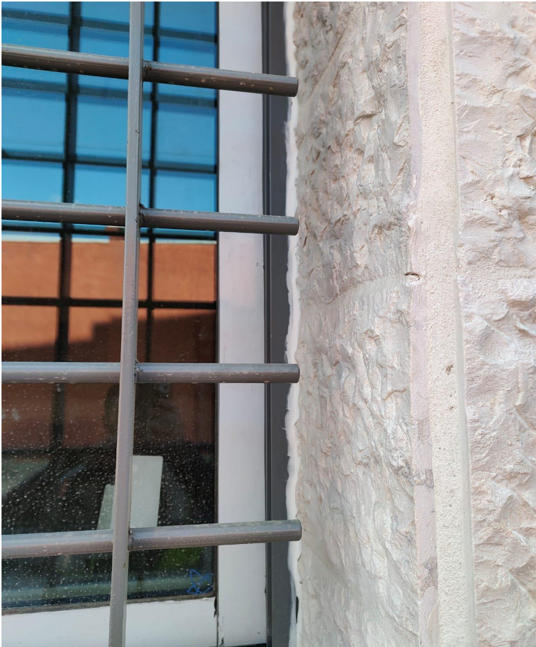
Example of unapproved sealant