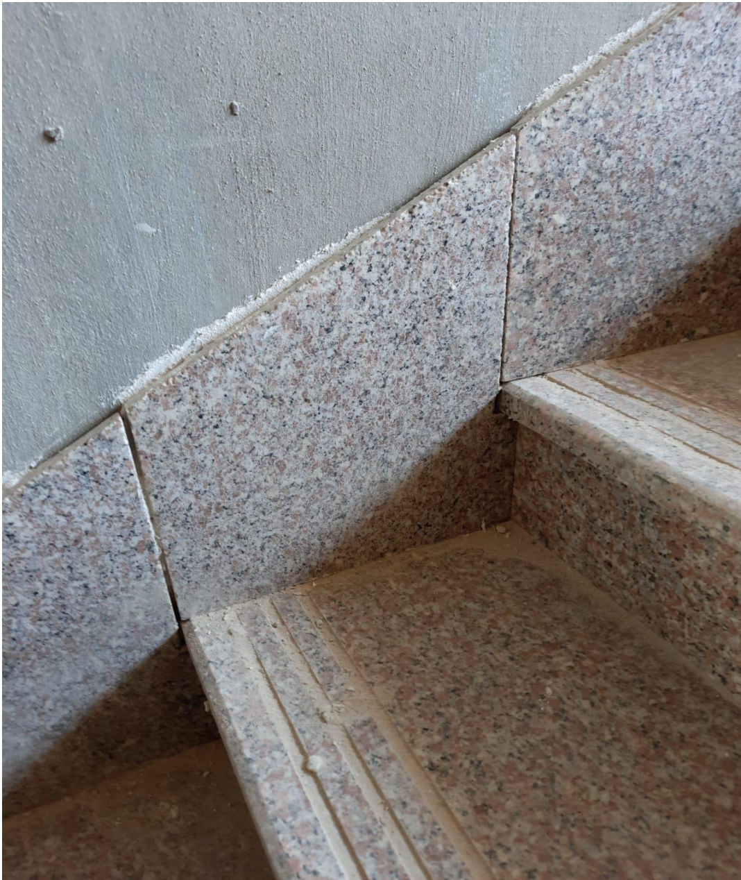
Defects in inclined skirting