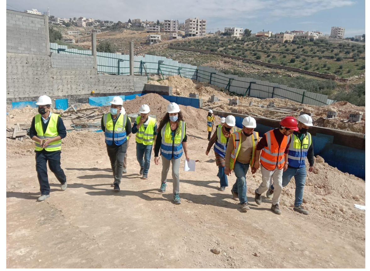
A tour inside the site was conducted