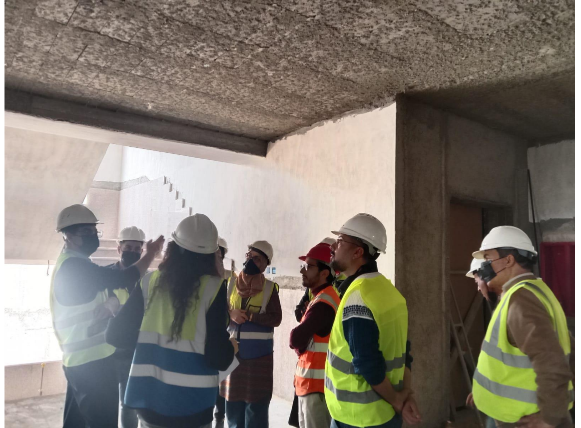
The team discussed with the Contractor the limits of the false ceiling and requested the Contractor to extend the false ceiling to reach the drop beam