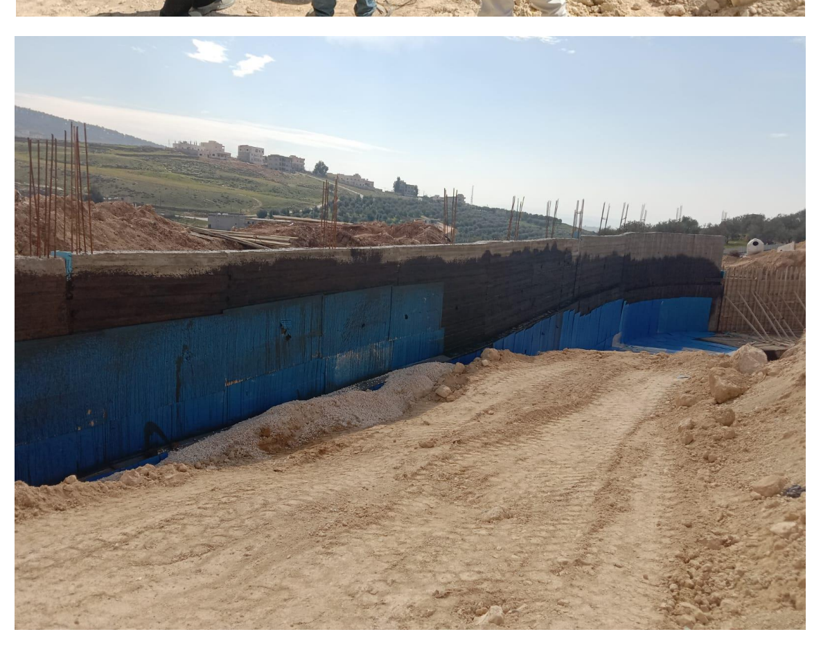
The team inspected the ongoing work in the external walls and requested the Contractor to accelerate the work there in order to start with the backfilling and the rest of the external works