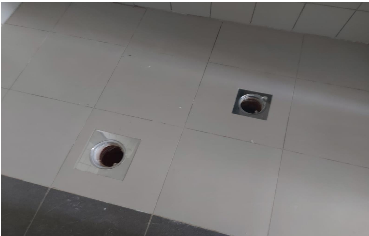
Open cleanouts and drains