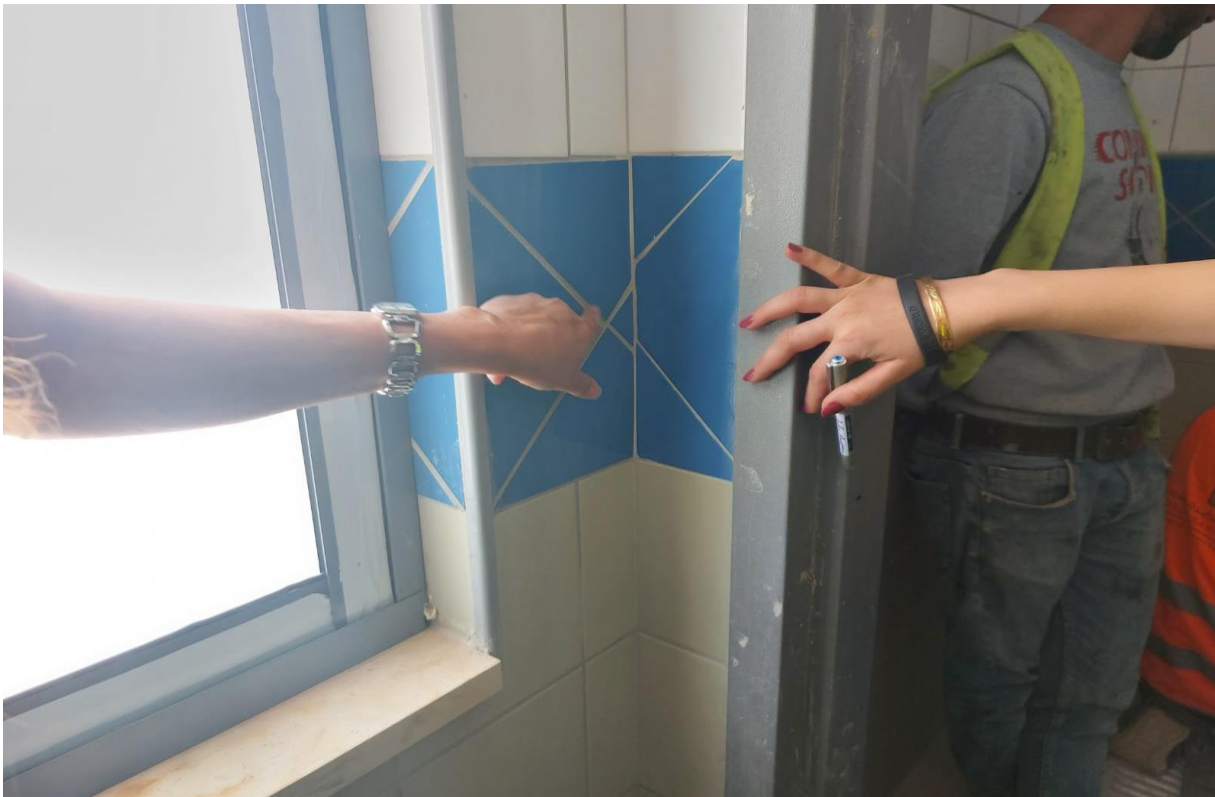
Wider gaps at the tiled wet areas