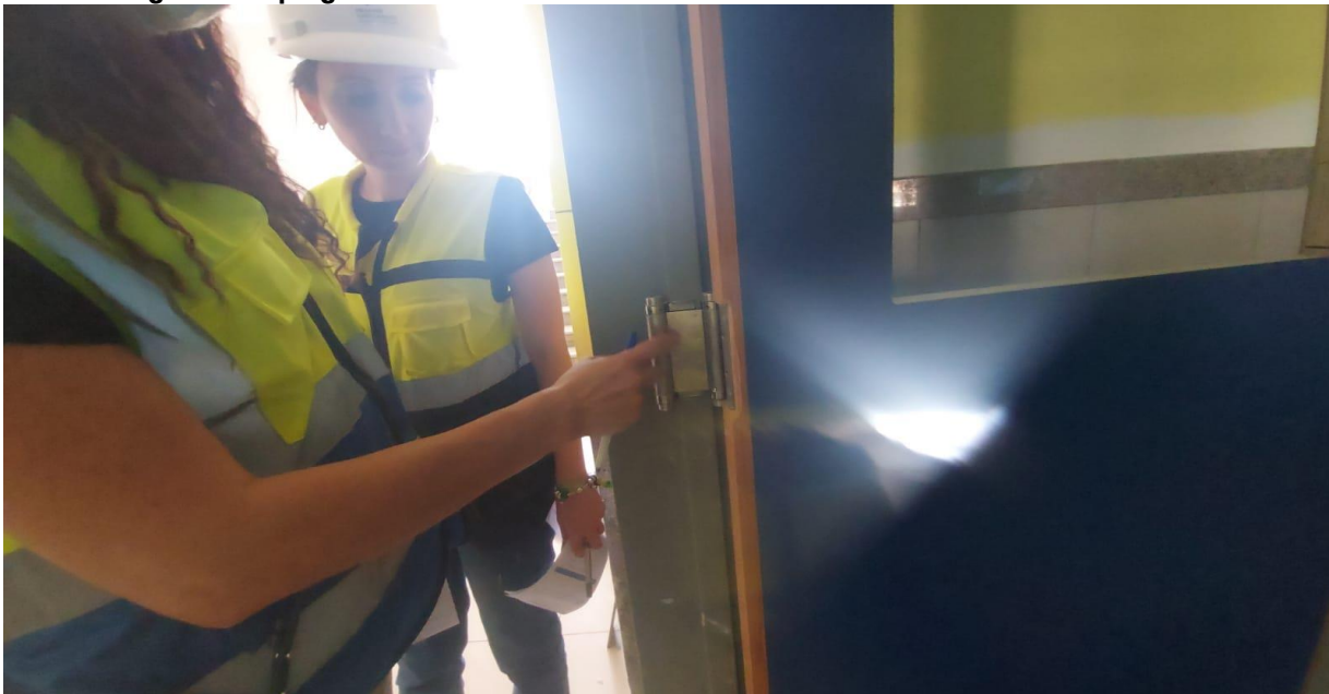
Unacceptable installation for door hinges