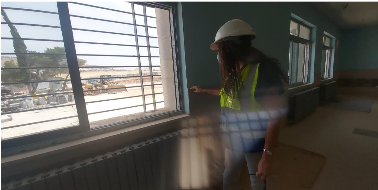
Smaller dimension for aluminum section