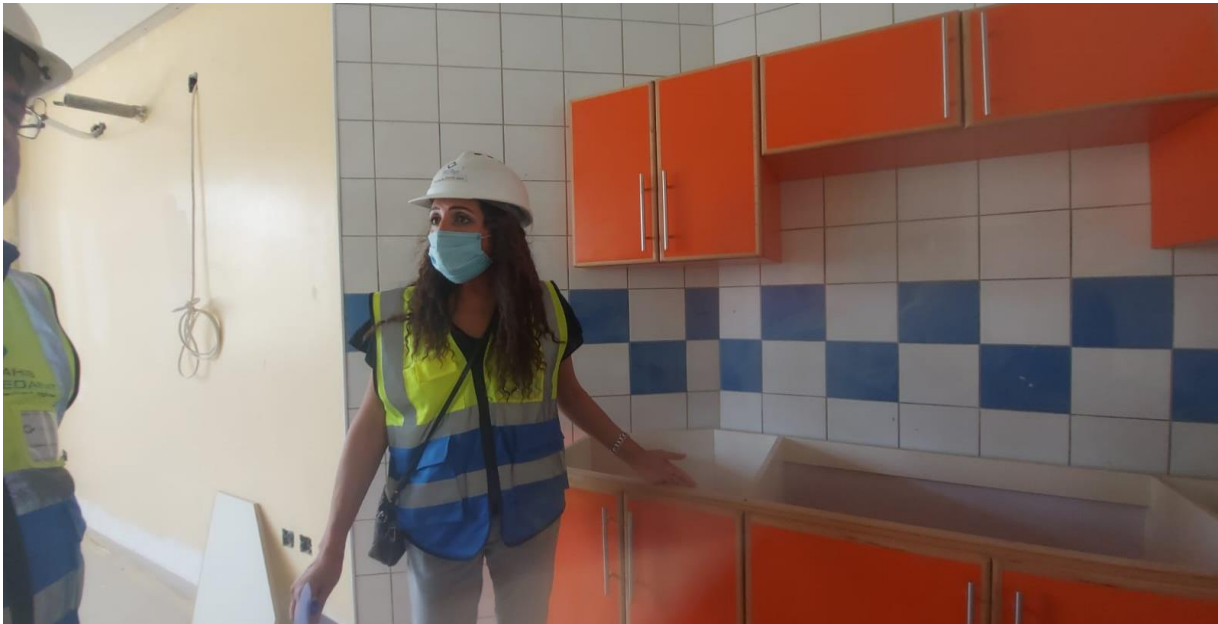
Defects in the beech wood frames