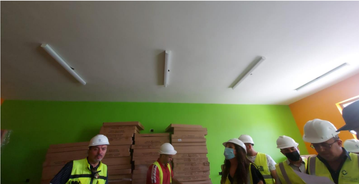
Gaps around the lighting fixtures