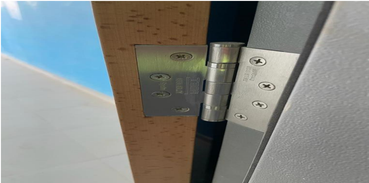
Reinstallation of the door hinges