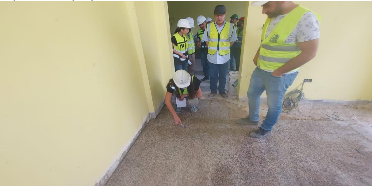
Broken edges of granite