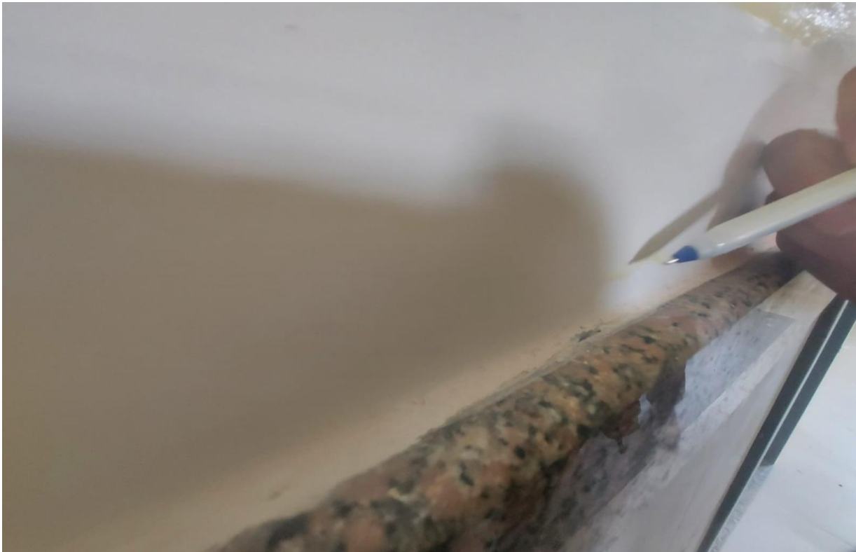
Defects in granite coping