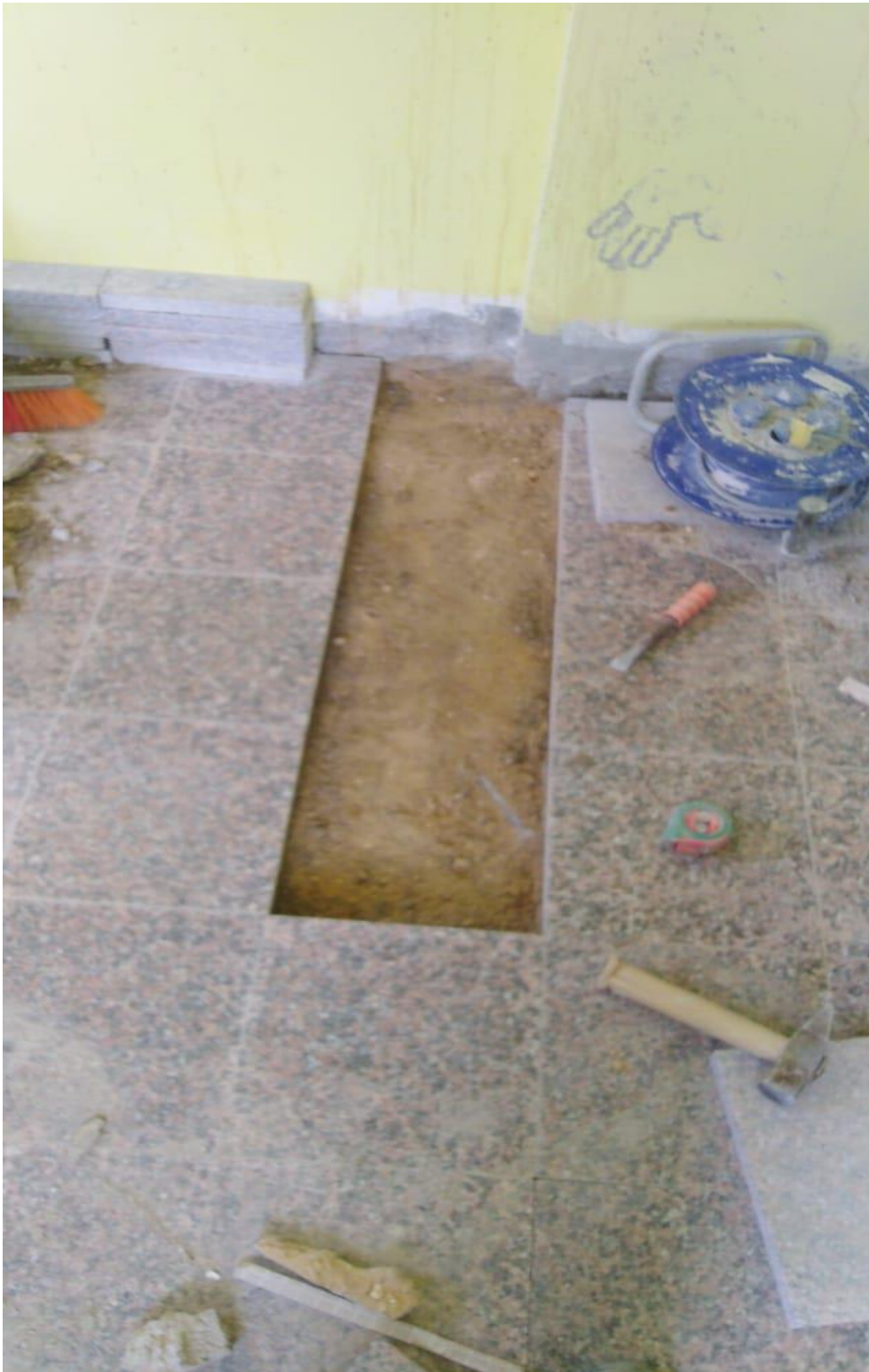
Removing of defected granite tiles