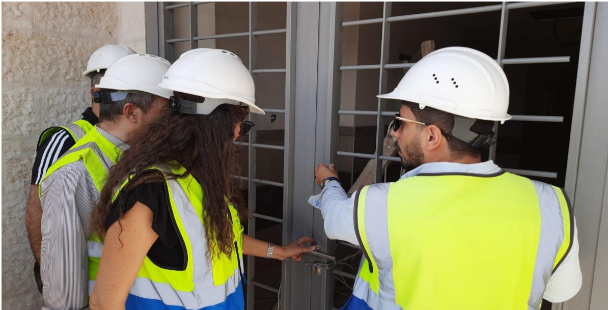
Door part does not comply with architectural details