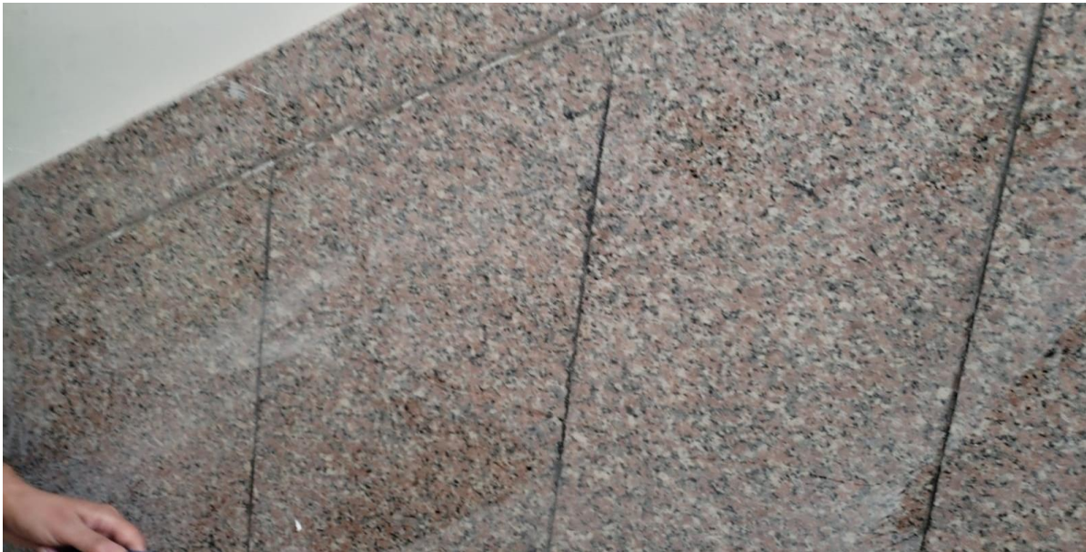
Defected granite pieces