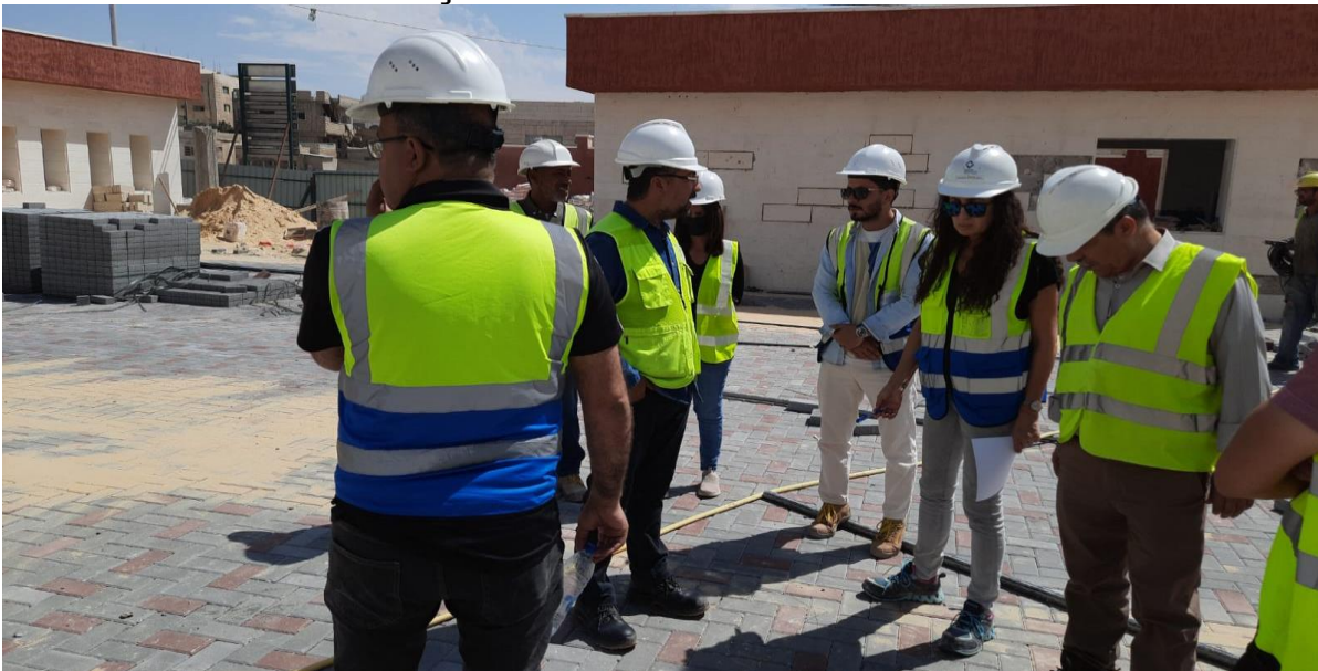
Defects in levelling of interlock tiles