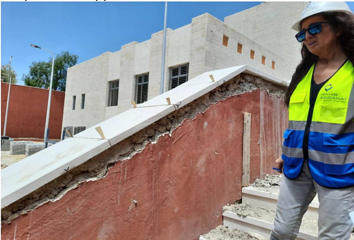
Broken stone coping