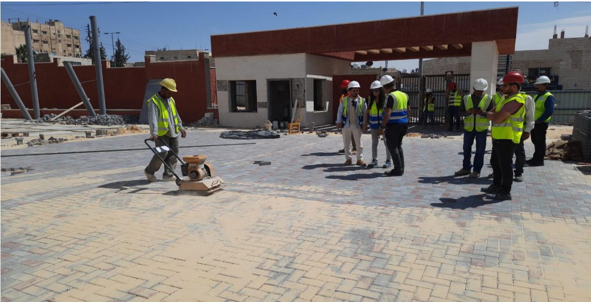
Repair of interlock tiles levelling