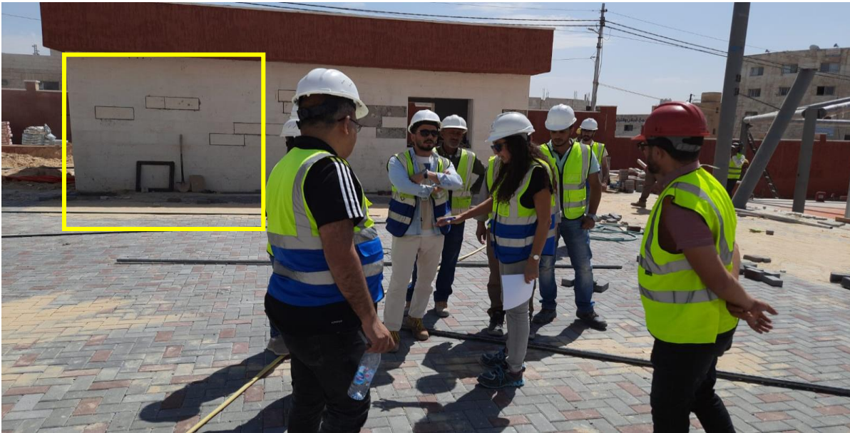
Replacement of defected stones