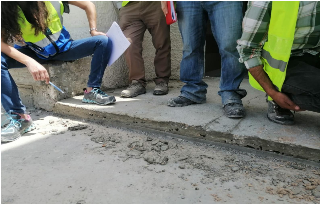
Cracks and voids in concrete cover