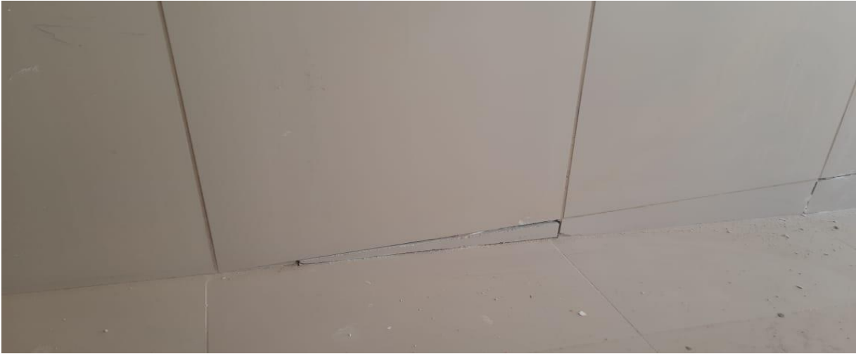
Replacement for cut-off pieces