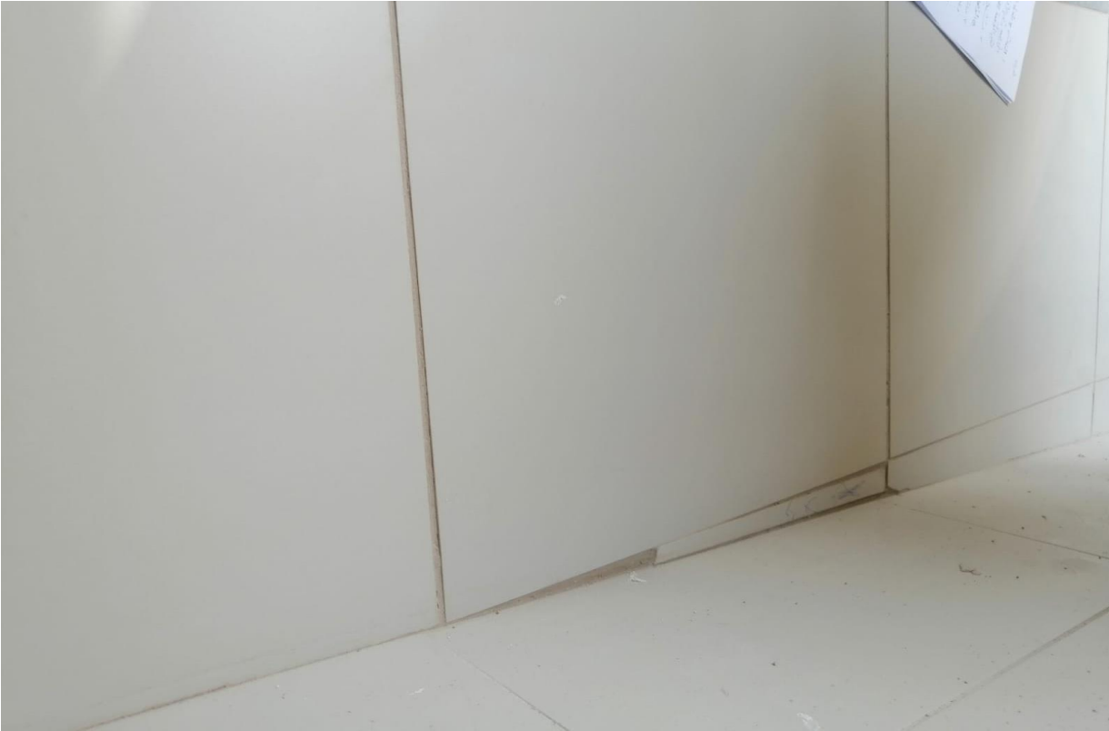
Defects in cut-off pieces in ramp