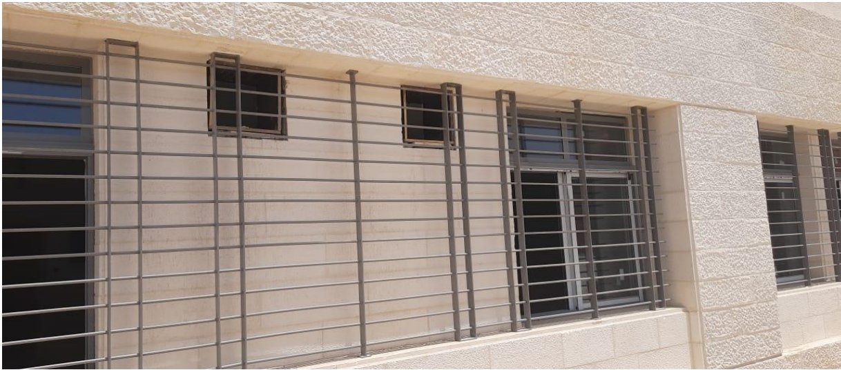
Rectification of steel protection screens