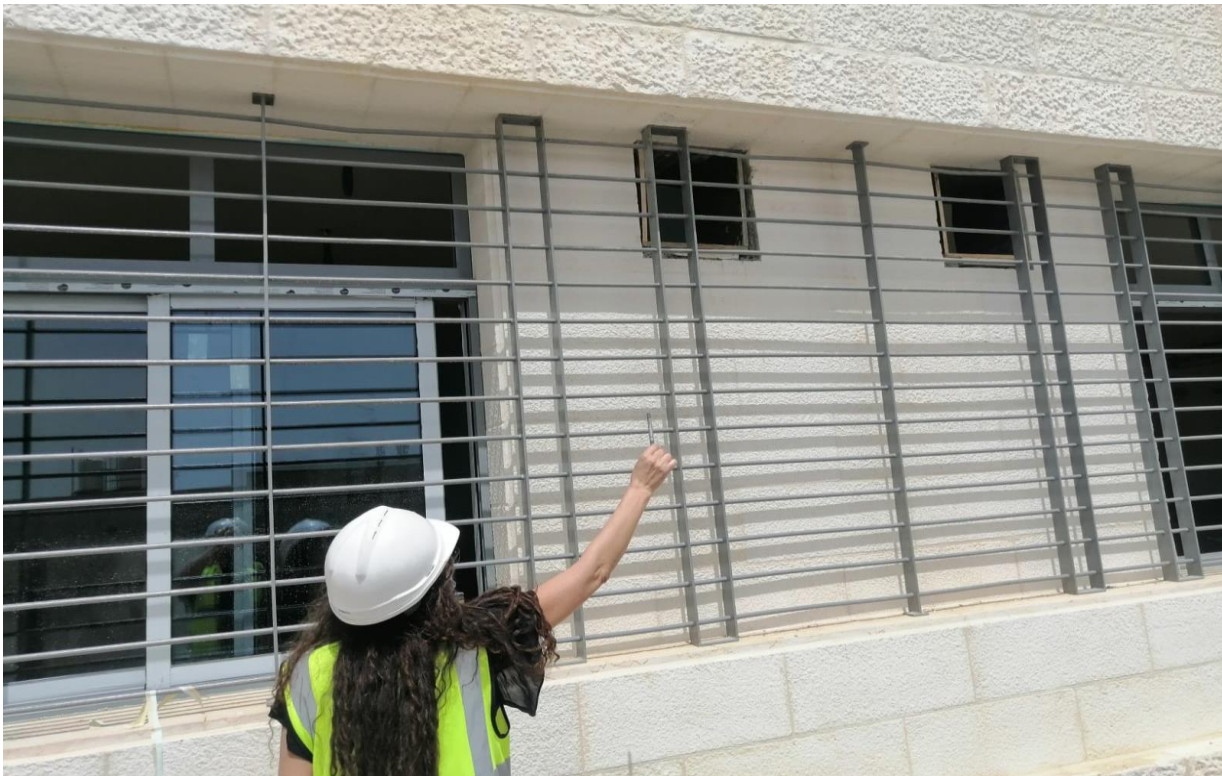
Defected steel protection screens