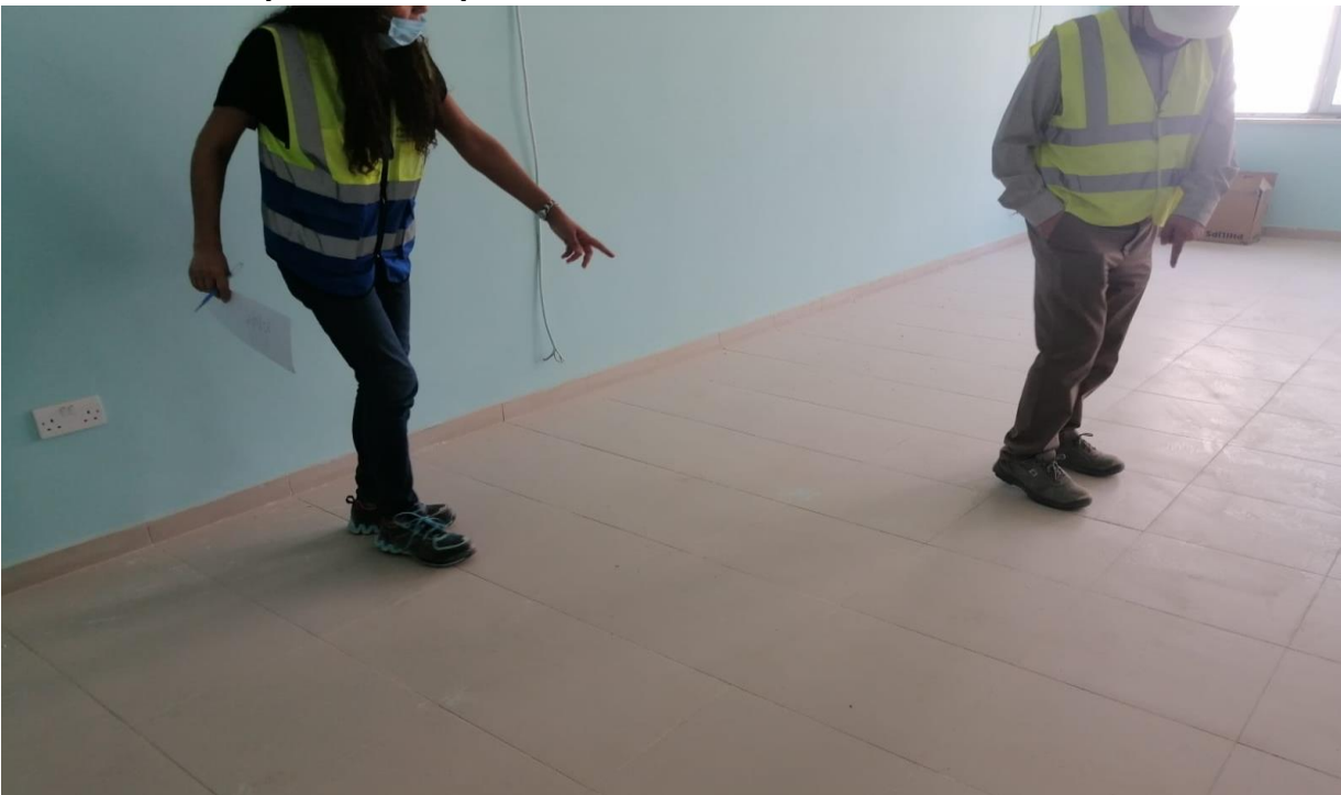
Teething in porcelain floor tiles