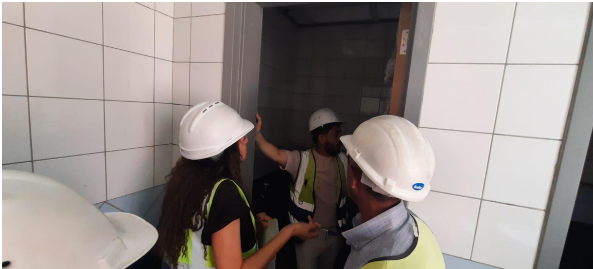
(Figure: 11 & 12)

Marking the last stage of tiling, doors and sanitary fixtures installation