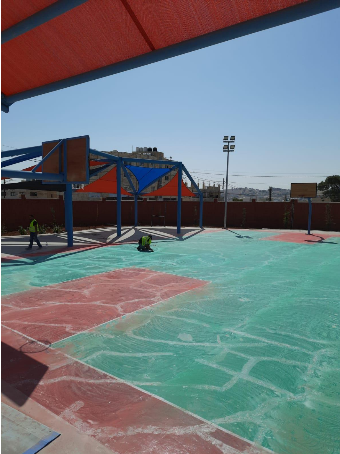
Inspecting rectification work for the painting at the basketball court