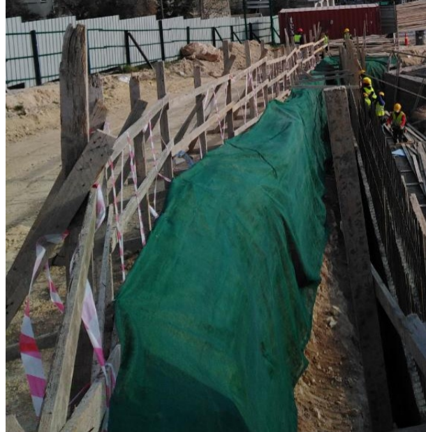
Figure #2 – CORRECTIVE ACTION PLAN CLOSED. Photo credit: Odai Tawalbeh, 11/6/2021