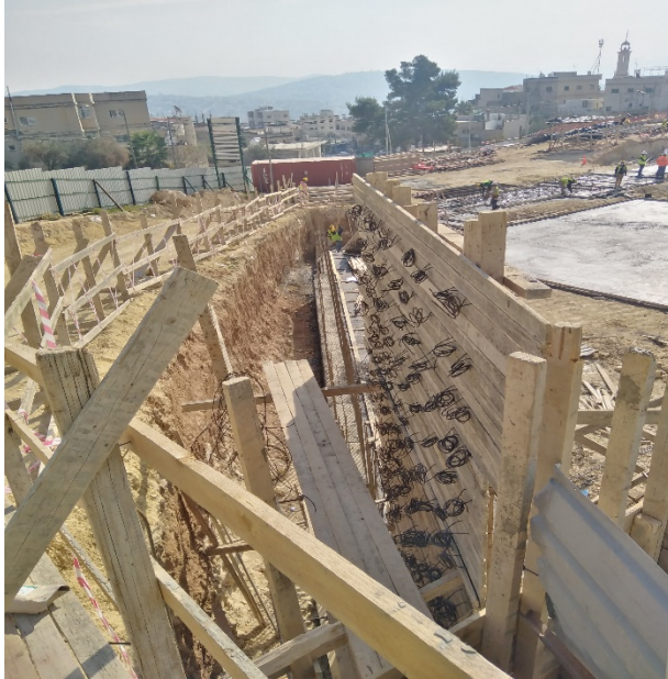
Figure #2: Excavation not properly protected against collapse – immediate action required.