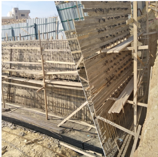
Figure #4: Unsafe scaffolding and platform units that were observed on site – must be properly erected and secured. Photo credit: Odai Tawalbeh, 11/6/2021