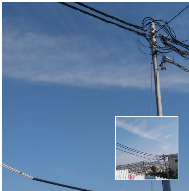
Figure #3: Utility poles that were observed within site boundaries – this item must be addressed by the responsible party. Photo credit: Odai Tawalbeh, 11/6/2021