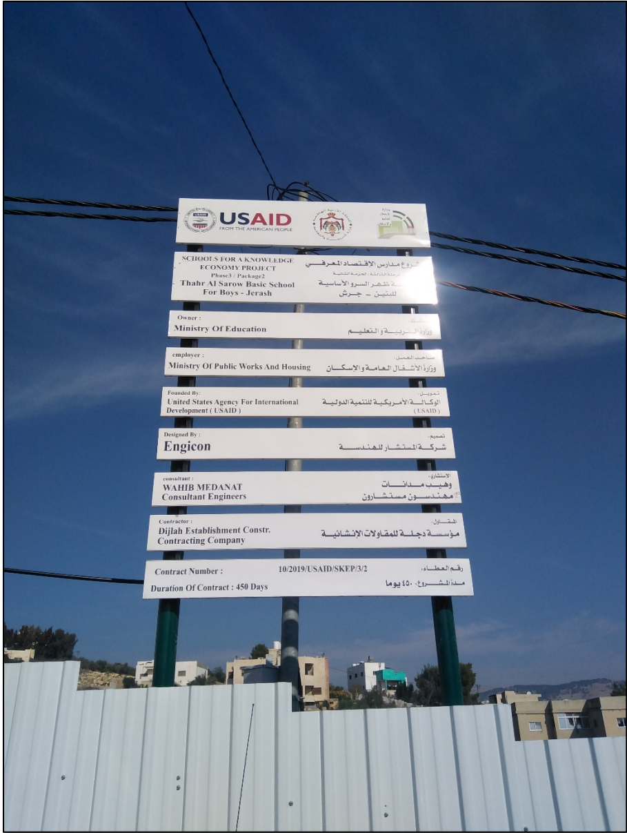
Figure #1: Project ID Sign Board on site. Photo credit: Odai Tawalbeh, 1/16/2021