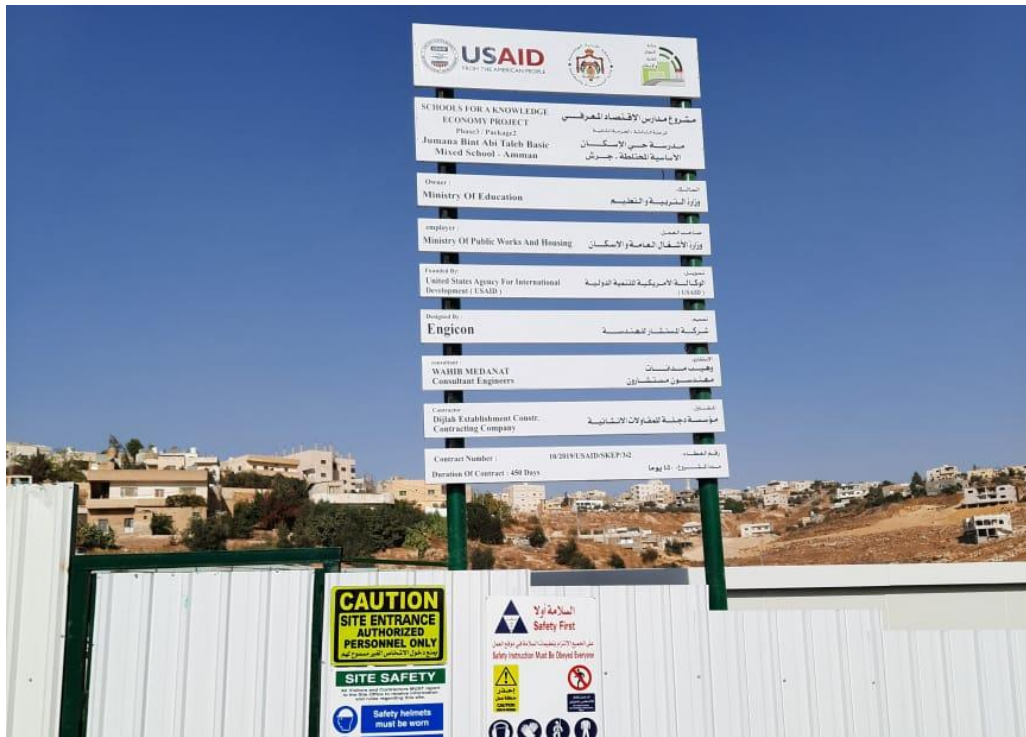
Hay Al Iskan Basic Mixed School- Jerash