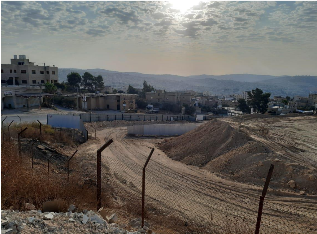
Thahr Al Sarow Basic School for Boys- Jerash