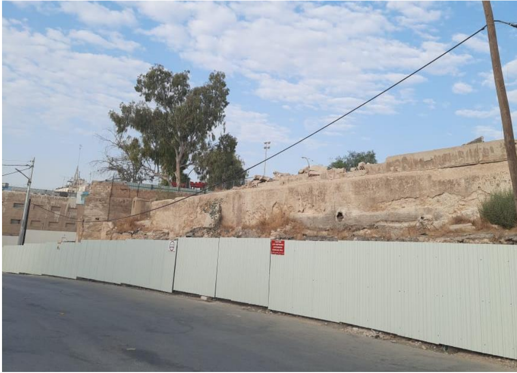
Jumana Bint Abi Taleb Basic Mixed School- Amman